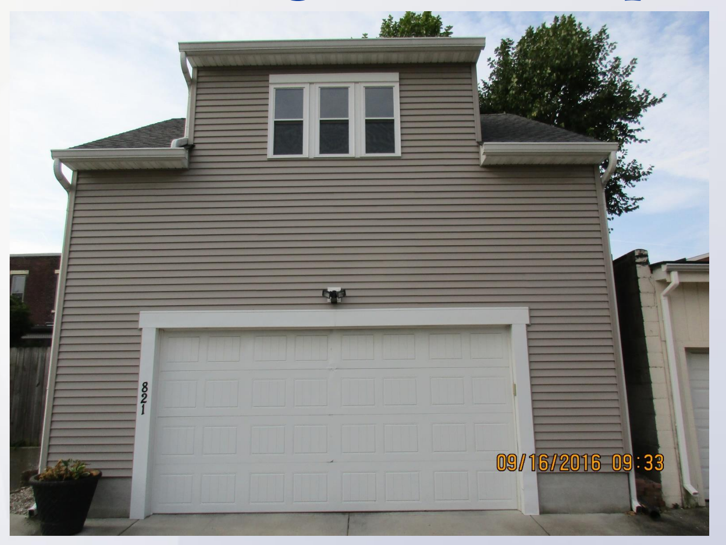
Garage located two doors east of the subject site.