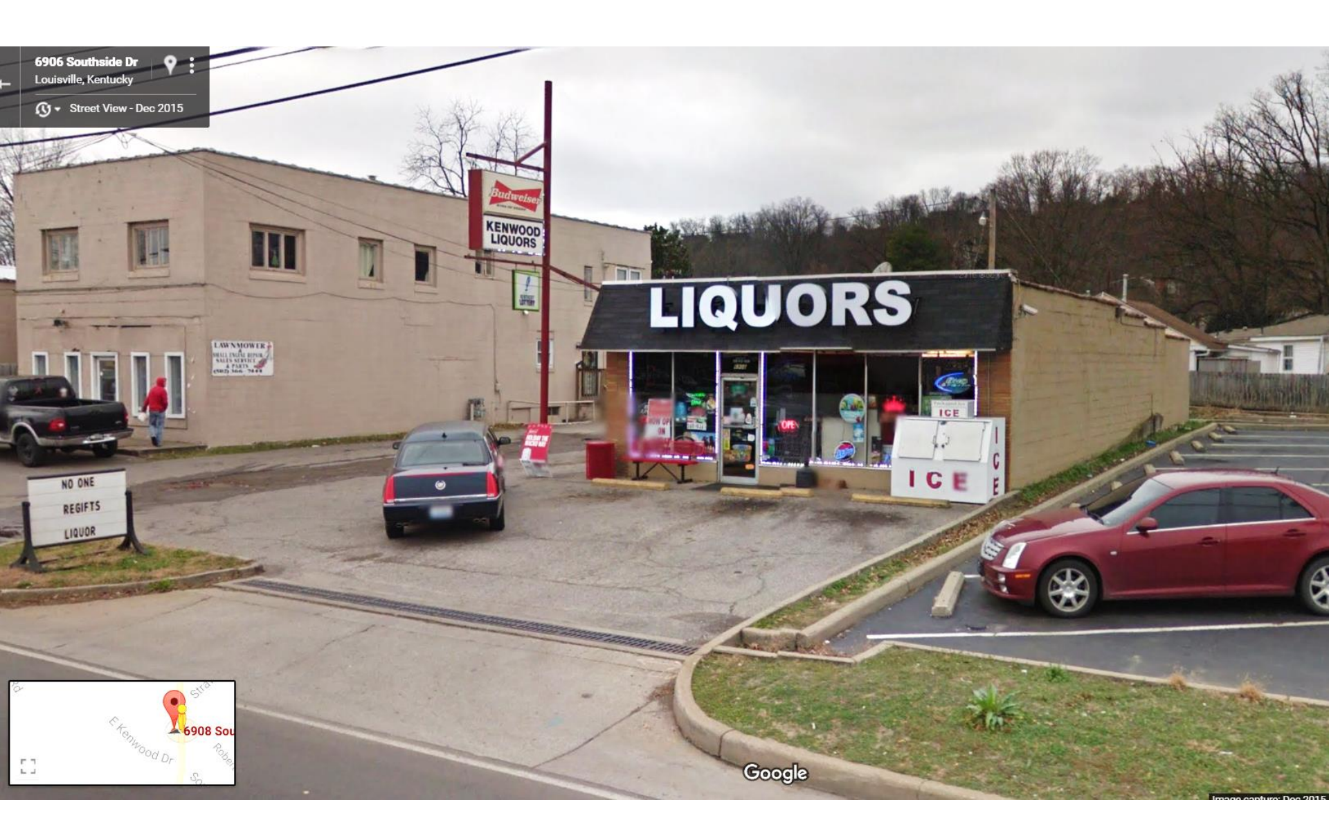
View of existing Kenwood Liquor store.