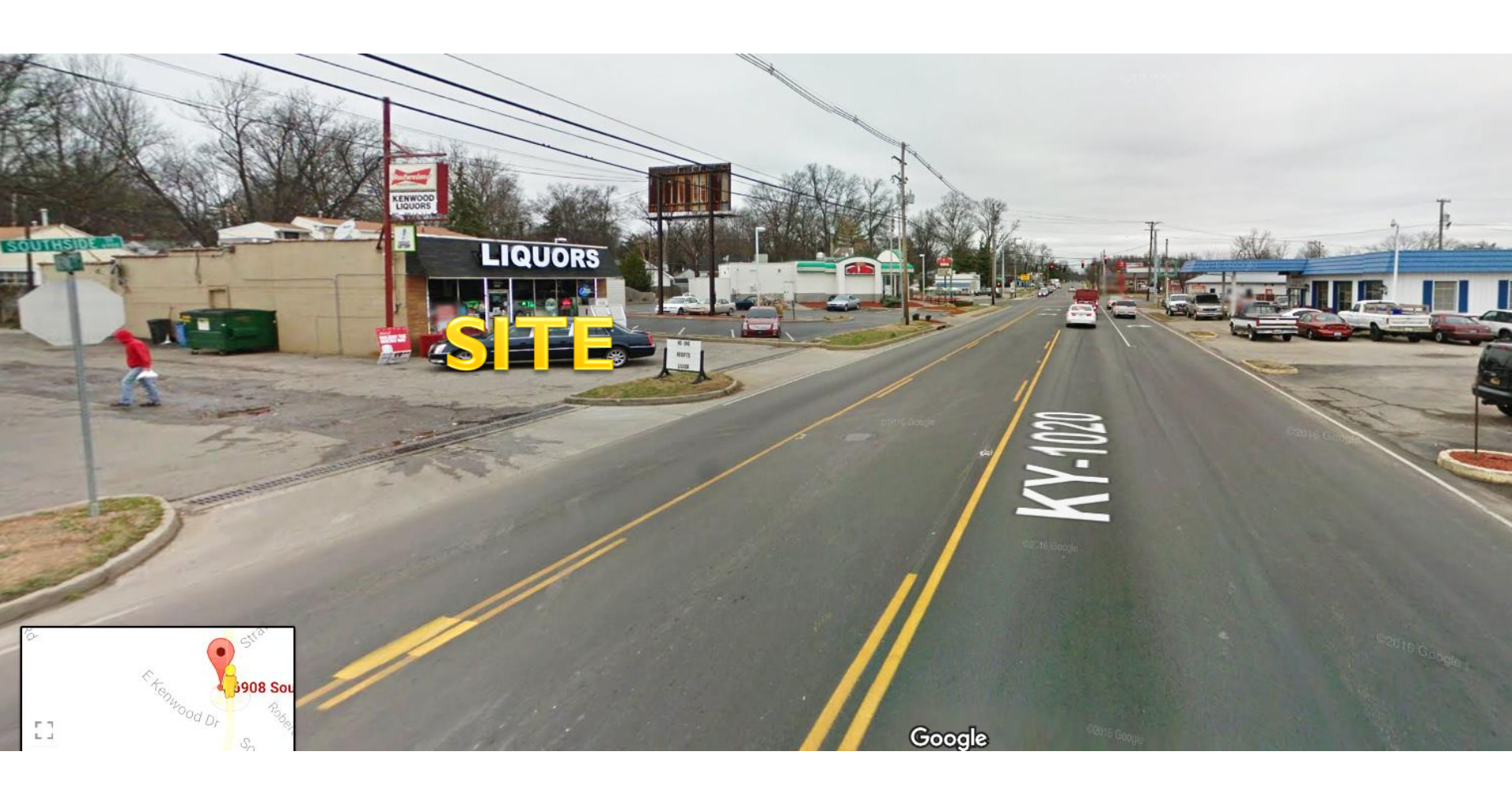
View of Southside Drive, looking north towards Strawberry Lane. Site is to the left.