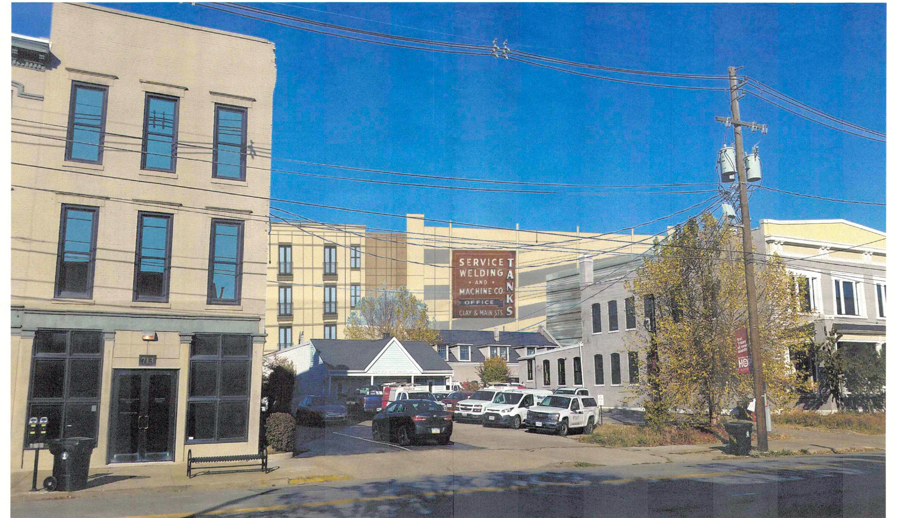
VIEW NORTHEAST FROM MARKET STREET - AFTER w/BANNER

Prepared by: SABAK, WILSON & LINGO, Inc.