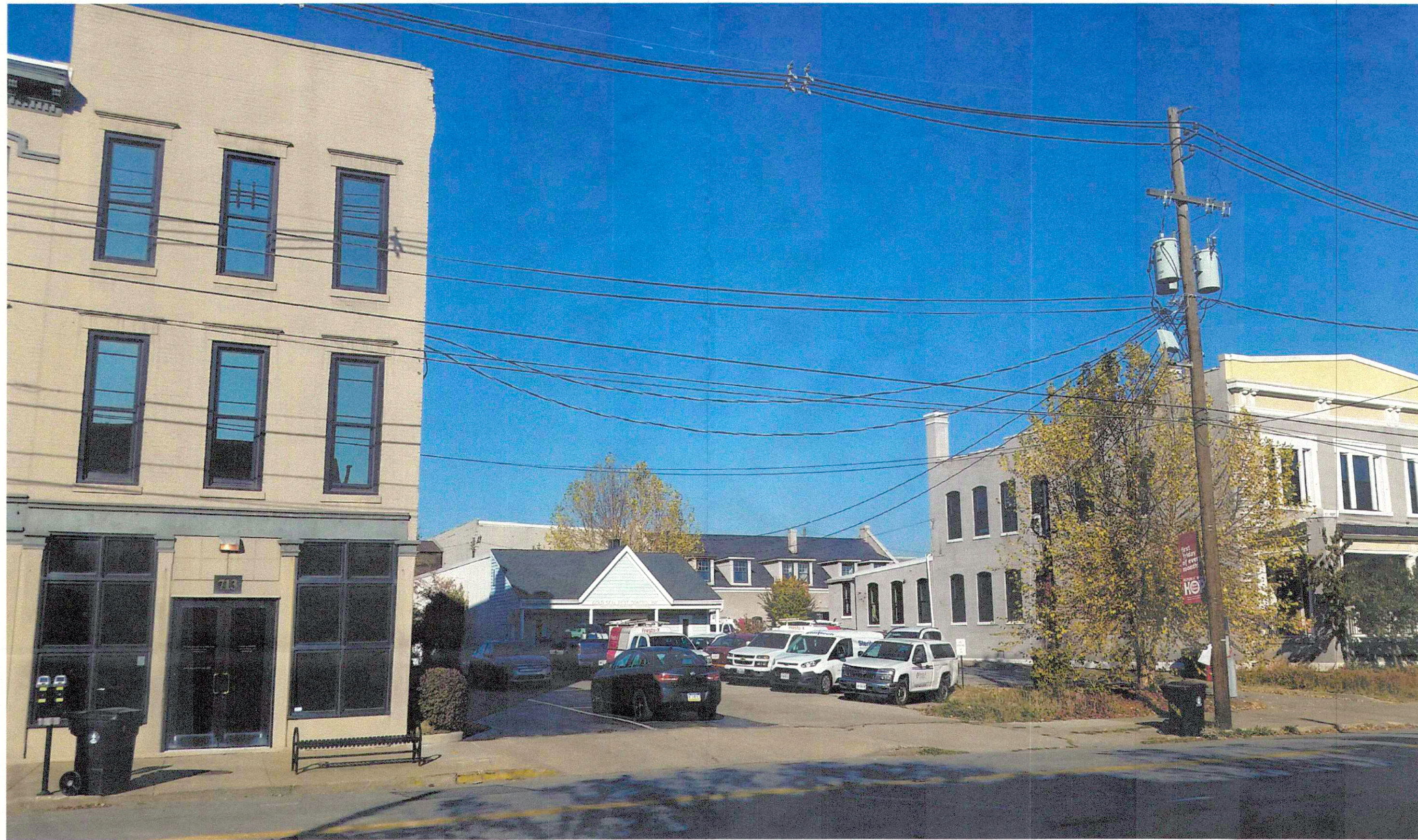
VIEW NORTHEAST FROM MARKET STREET - BEFORE