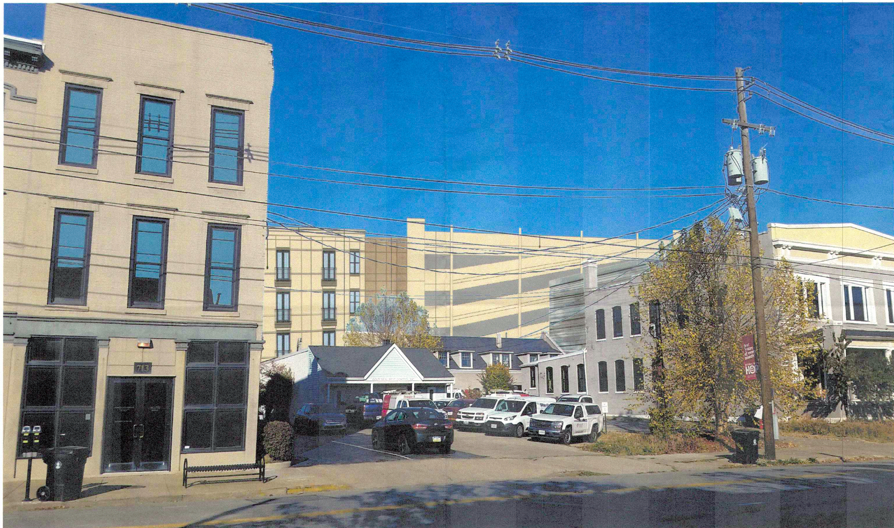
VIEW NORTHEAST FROM MARKET STREET - AFTER