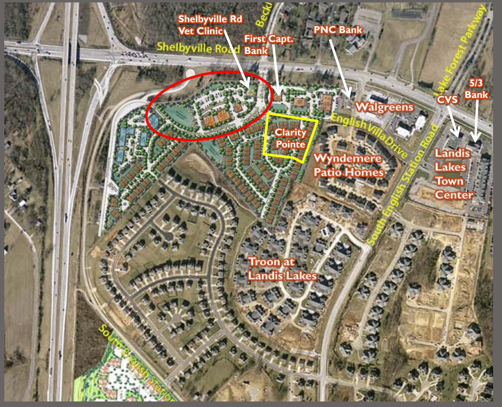
January 5, 2005 approved overall development plan. Site is circled in red. Clarity Pointe senior care facility outlined in yellow.