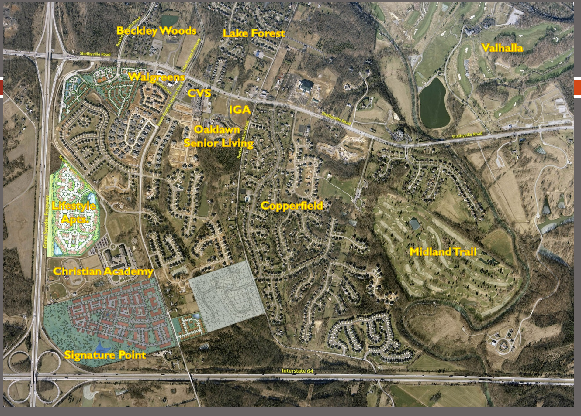
Aerial of Landis Lakes/Villages of English Station area