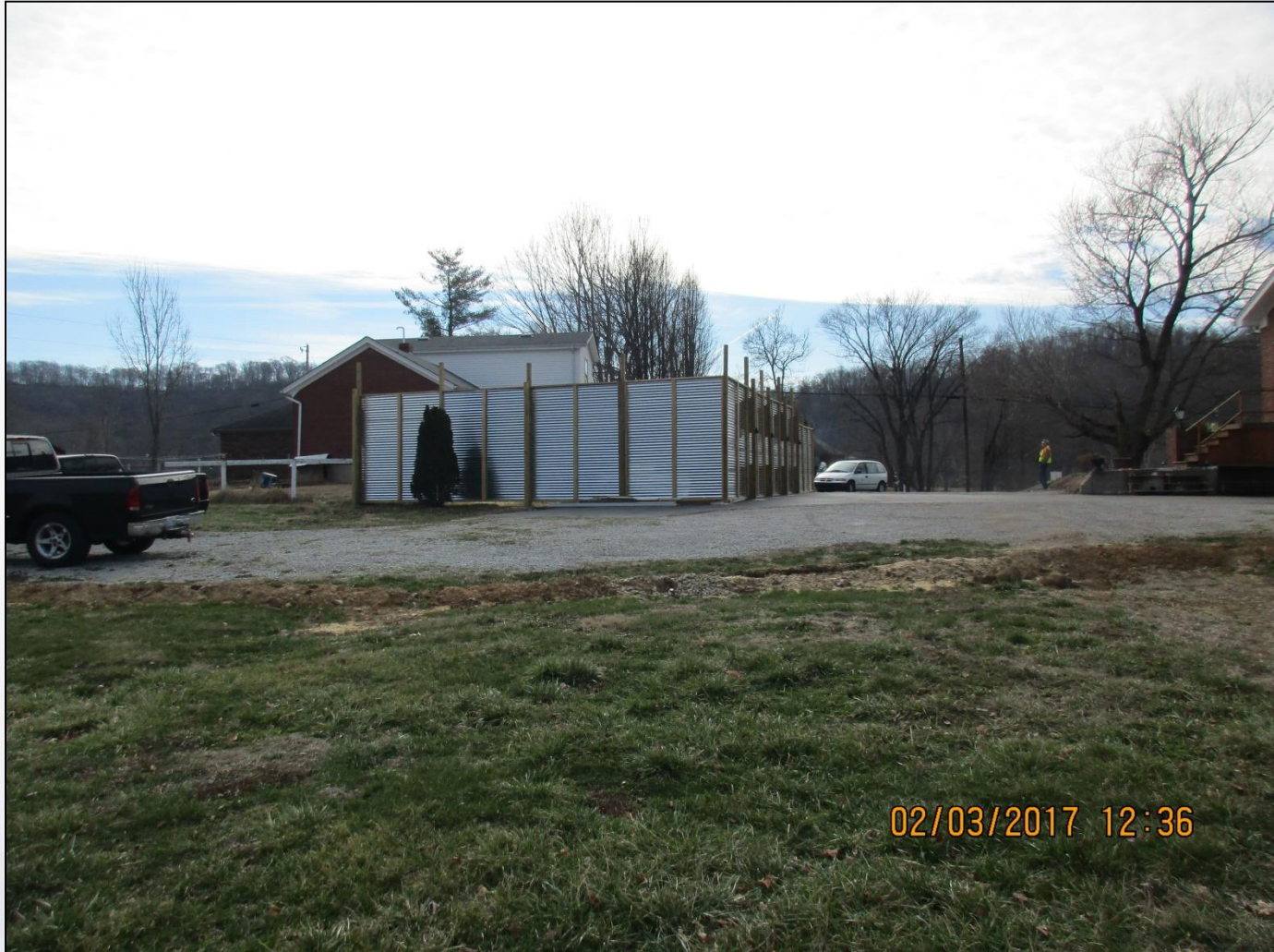
View of the fence from the subject property.