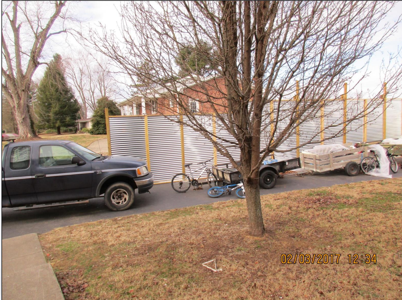
View of the fence from the neighboring property.