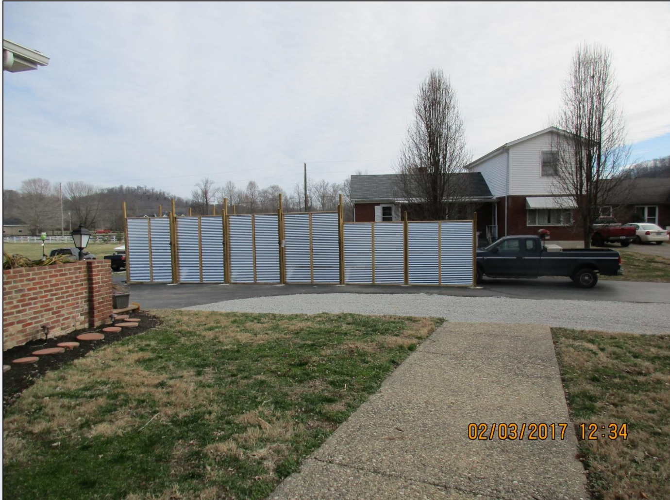
View of the fence from the subject property.