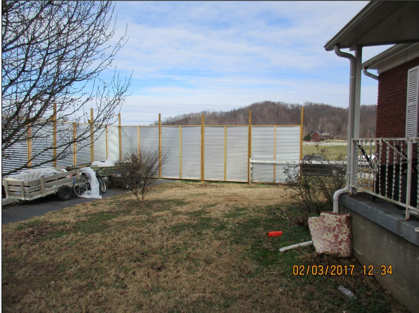
View of the fence from the neighboring property.