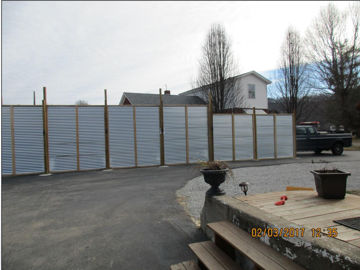
View of the fence from the subject property.