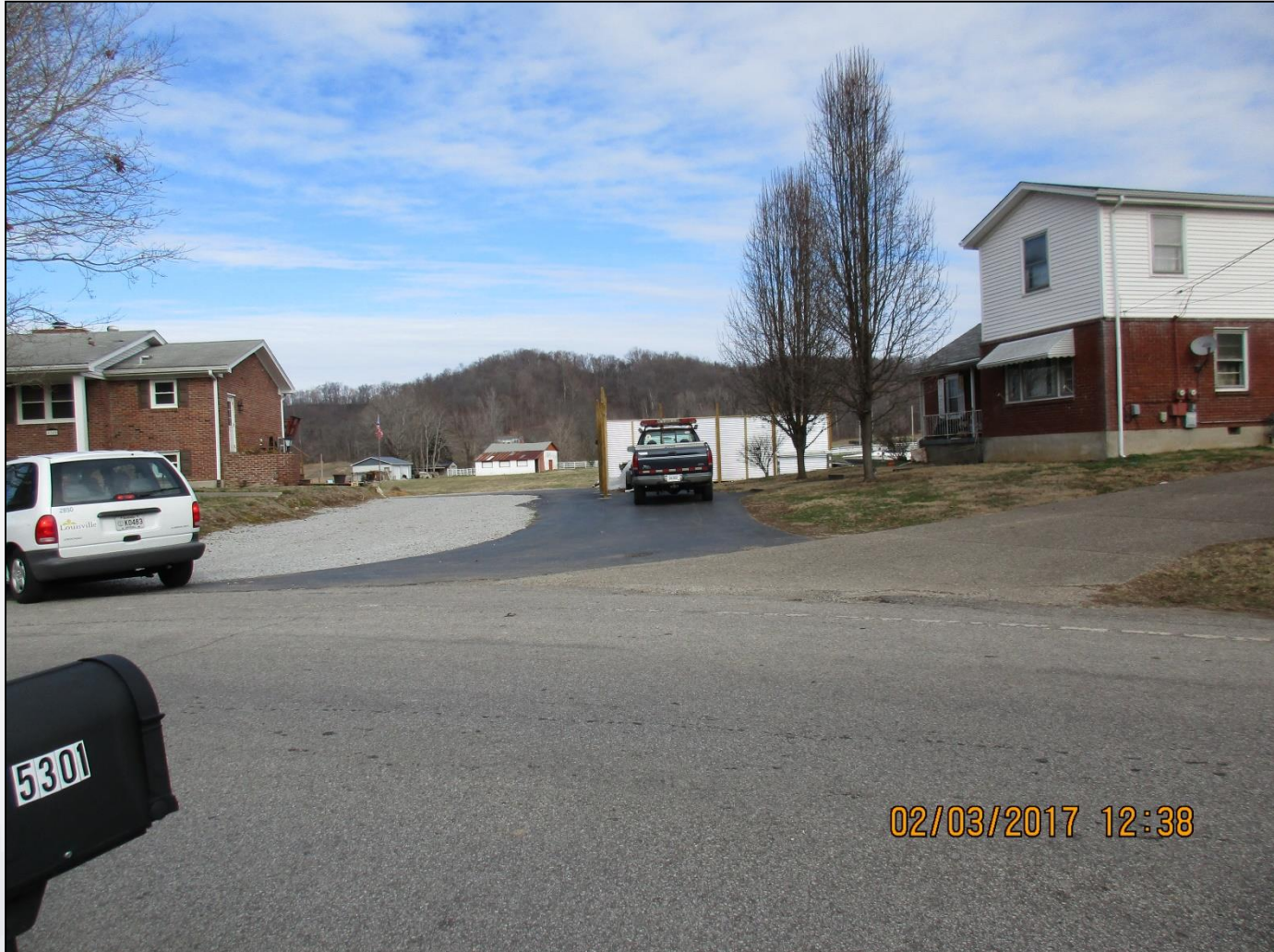
View of the fence from across the street.