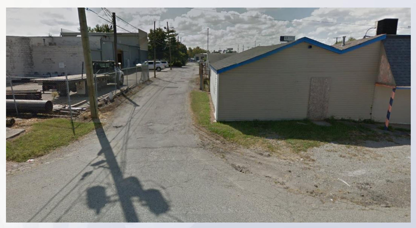
Northside of alley, Looking South