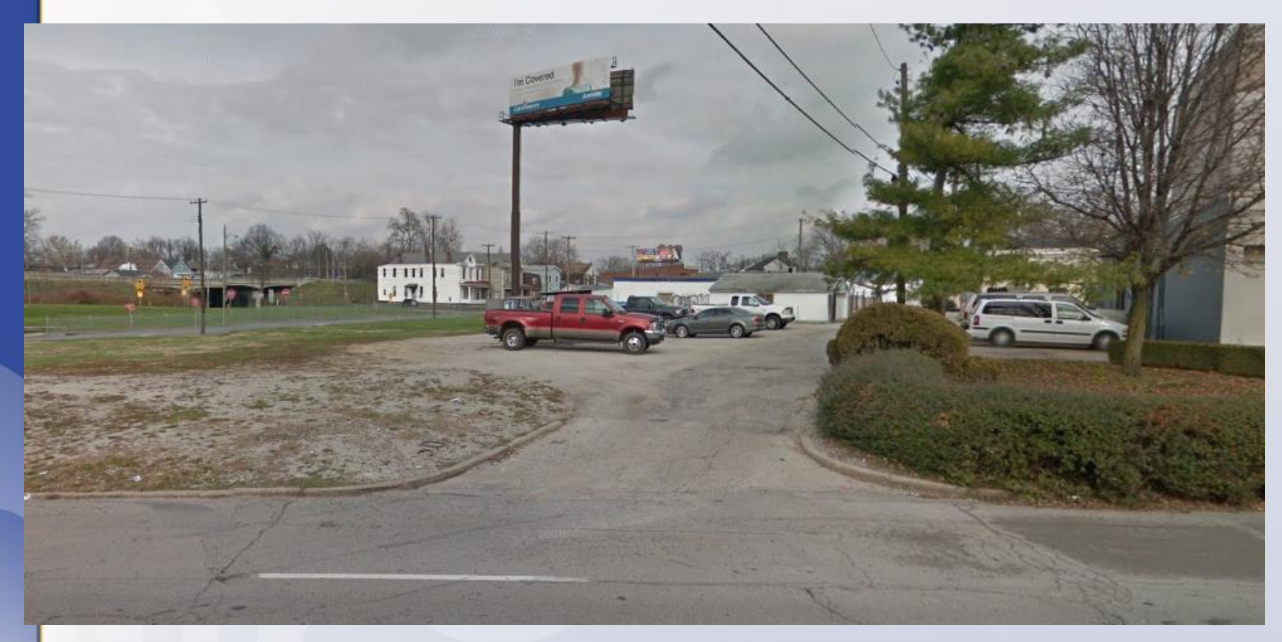
Southside of alley, looking North