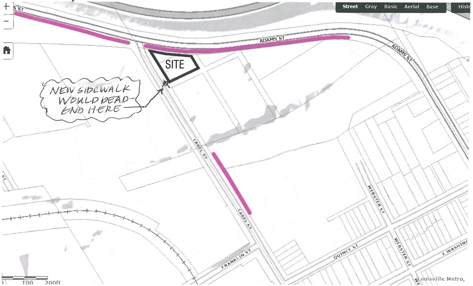
IMAGE 1 - SIDEWALK DIAGRAM