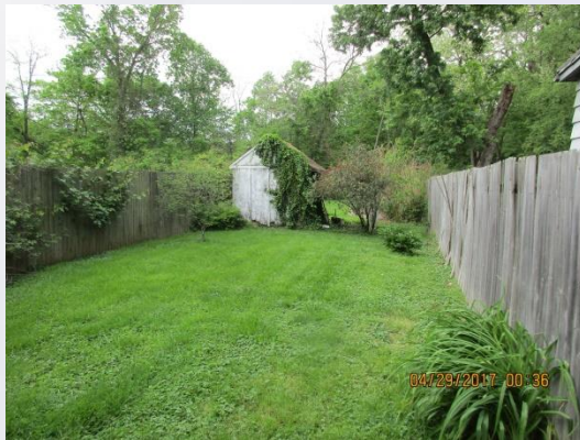
Rear Yard: house to shed