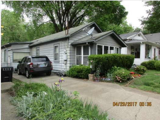
Adjacent to north