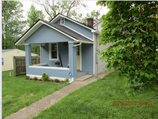
Adjacent to south