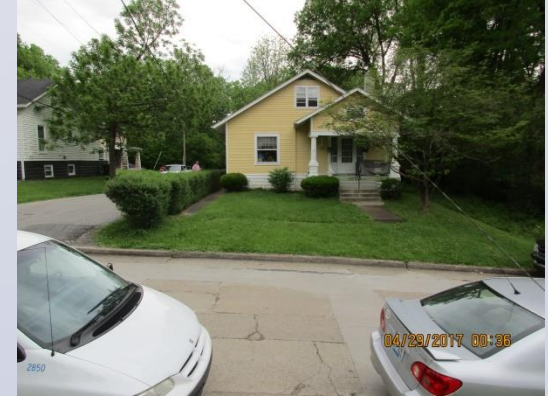
Across street to east