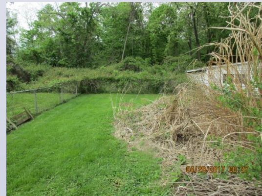
Rear Yard: shed to property line