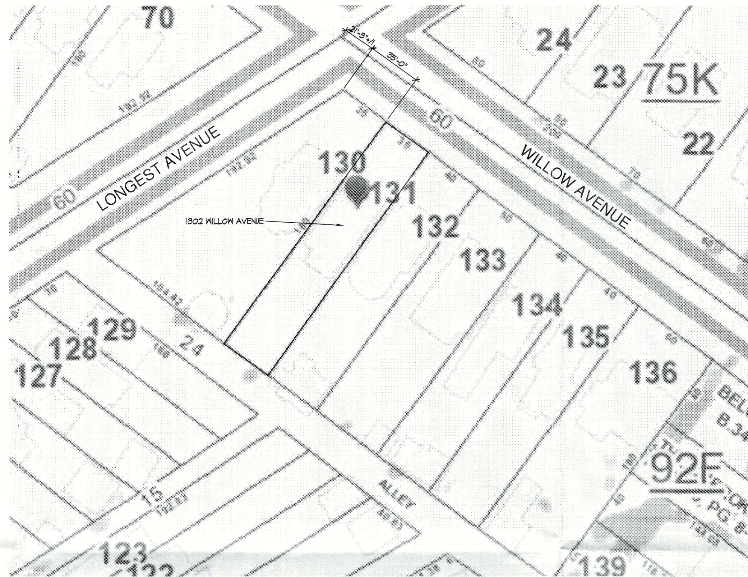
2 VICINITY MAP SCALE: NTS

NEW GARAGE IS APPROXIMATELY THE SAME DEPTH AS THOSE ON ADJACENT PROPERTIES