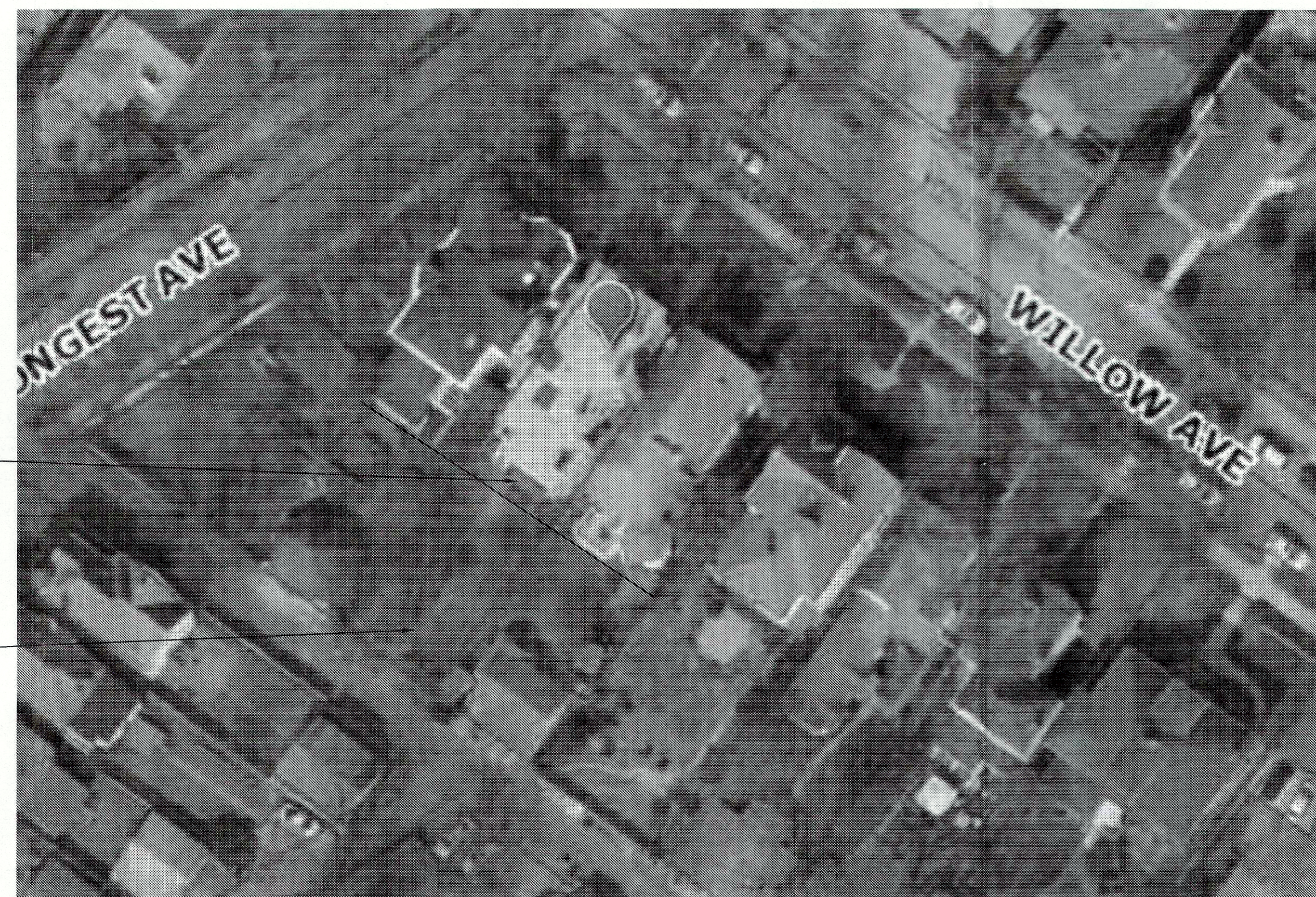
3 AERIAL VIEW SCALE: NTS