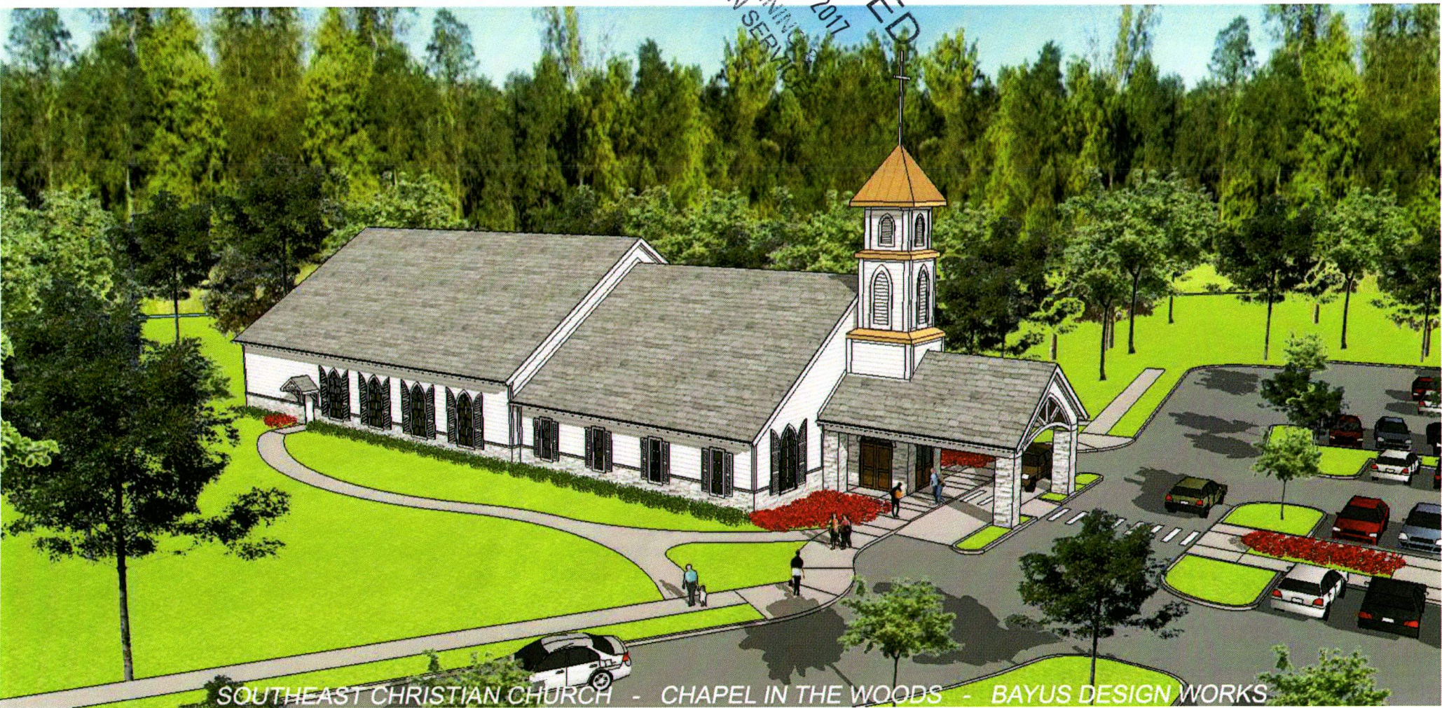
SOUTHEAST CHRISTIAN CHURCH - CHAPEL IN THE WOODS - BAYUS DESIGN WORKS

RECEIVED JUL 24 2017 PLANNING DESIGN SERVICE