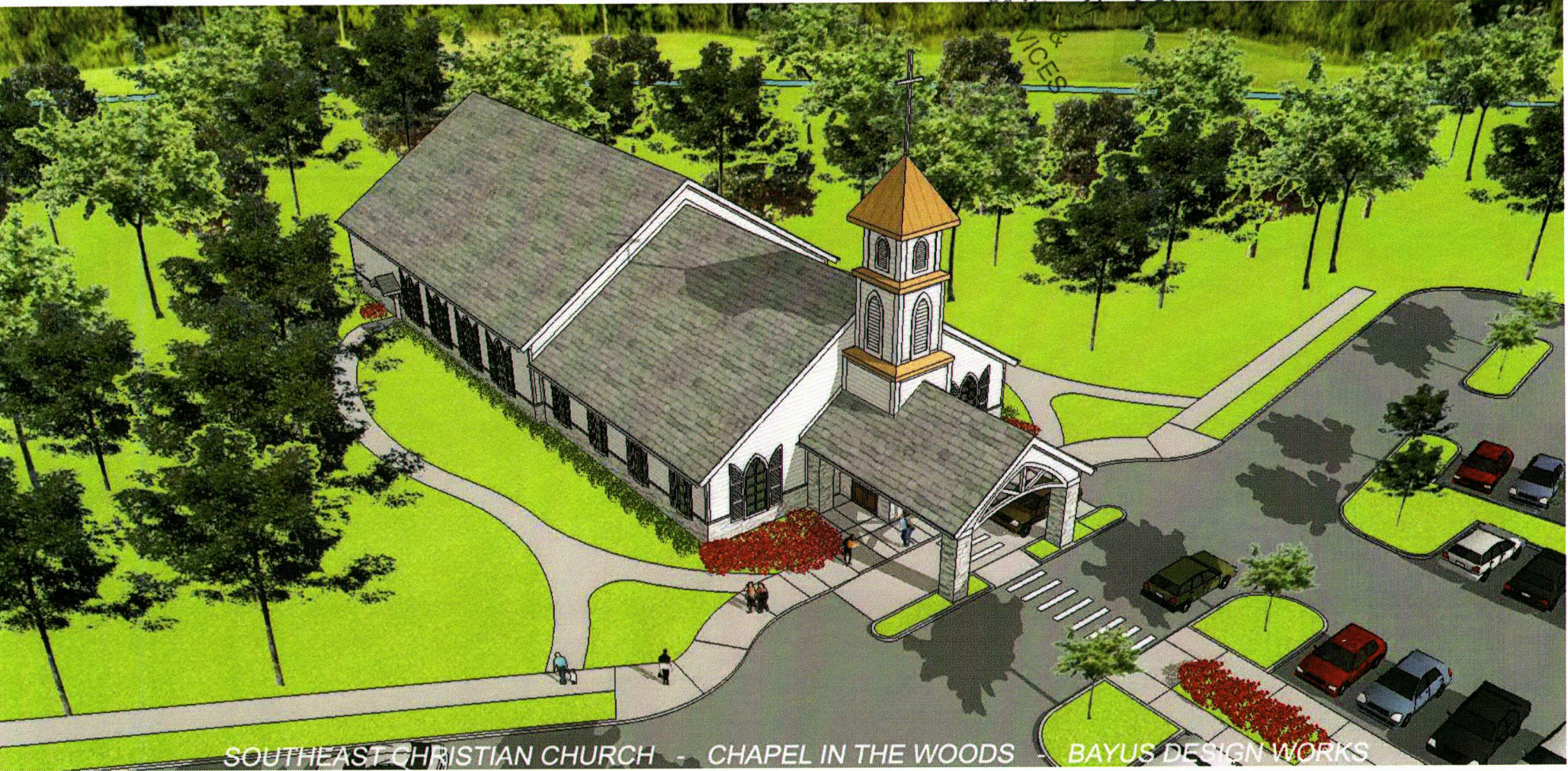
SOUTHEAST CHRISTIAN CHURCH - CHAPEL IN THE WOODS - BAYUS DESIGN WORKS

RECEIVED JUL 24 2017 PLANNING & DESIGN SERVICES