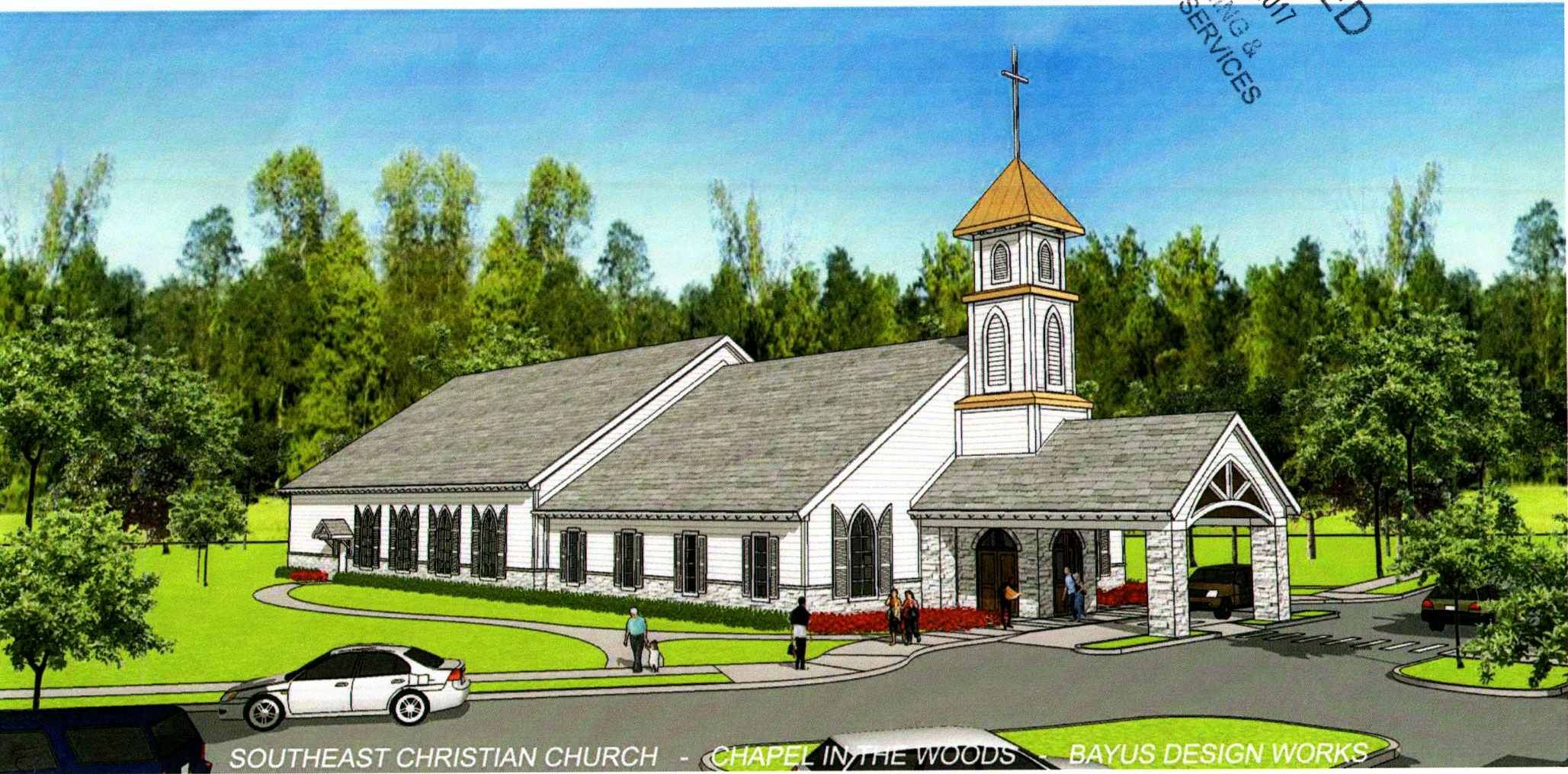
SOUTHEAST CHRISTIAN CHURCH - CHAPEL IN THE WOODS - BAYUS DESIGN WORKS

RECEIVED JUL 24 2017 PLANNING & DESIGN SERVICES