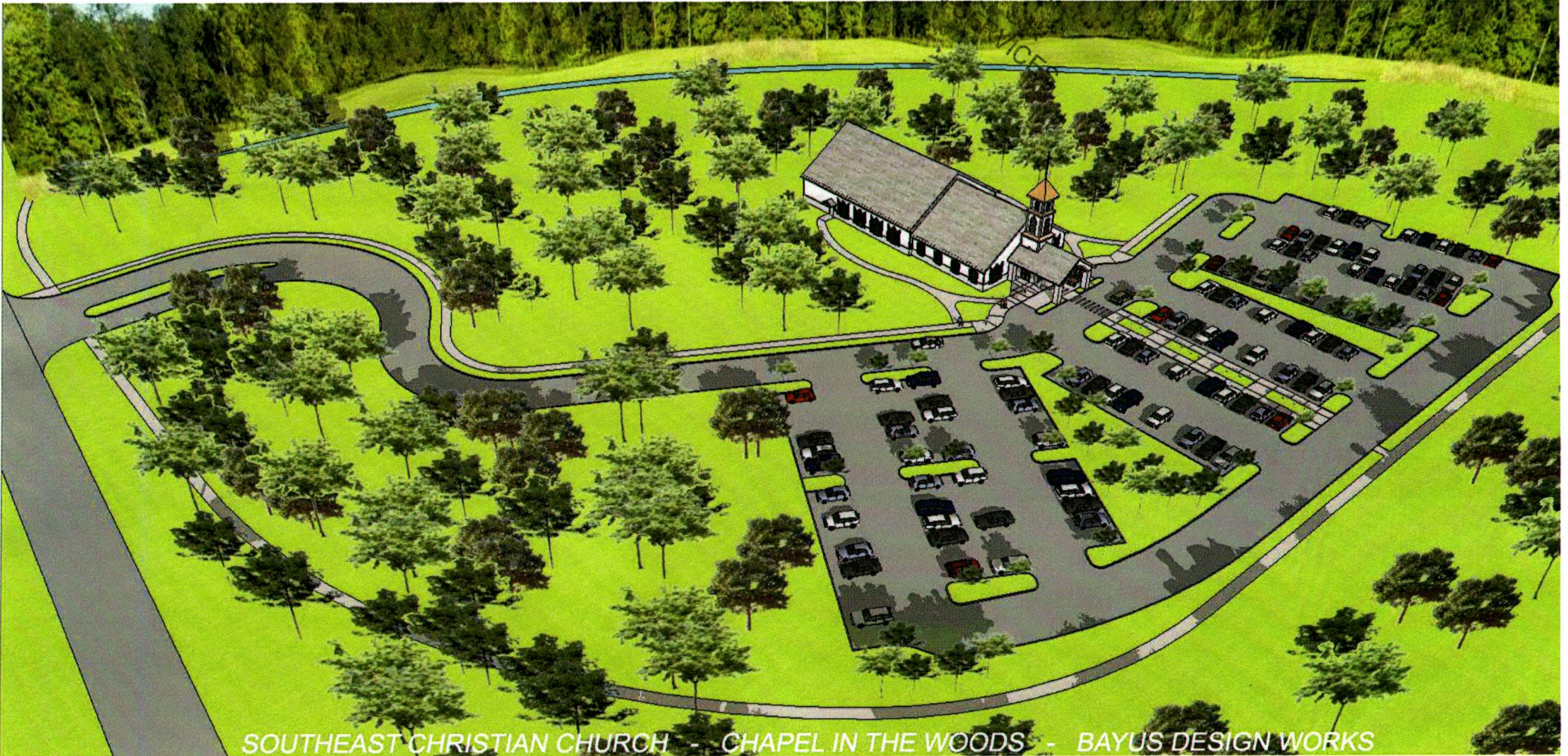
SOUTHEAST CHRISTIAN CHURCH - CHAPEL IN THE WOODS - BAYUS DESIGN WORKS