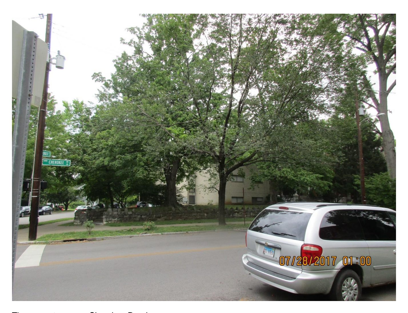
The property across Cherokee Road.