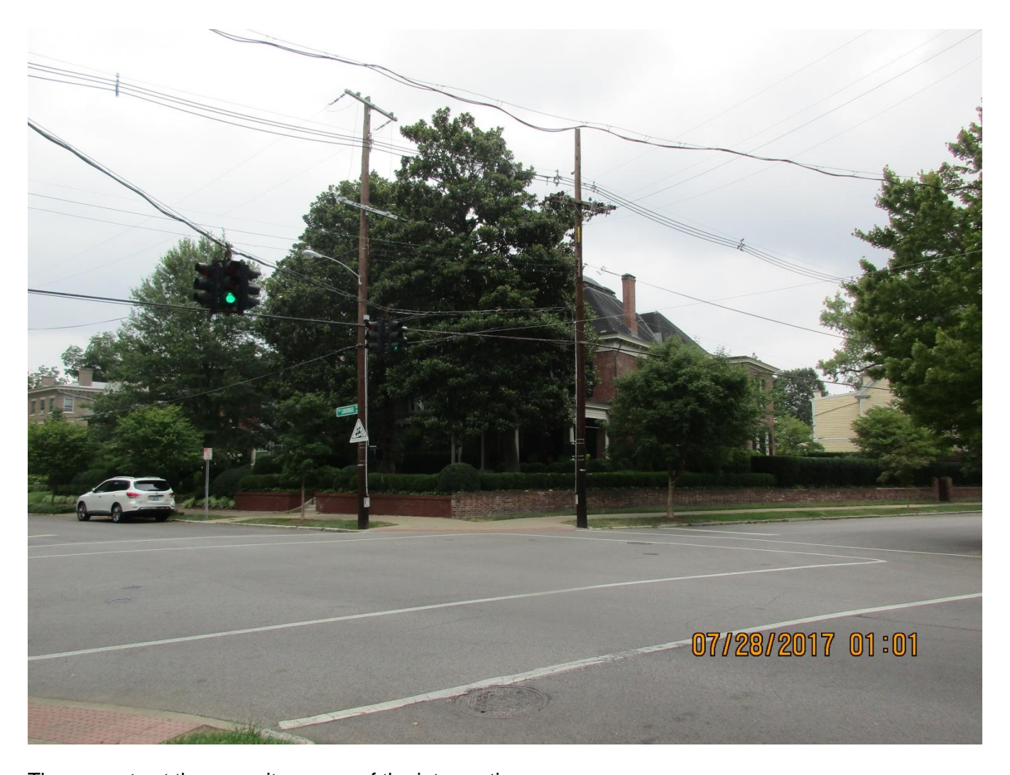
The property at the opposite corner of the intersection.