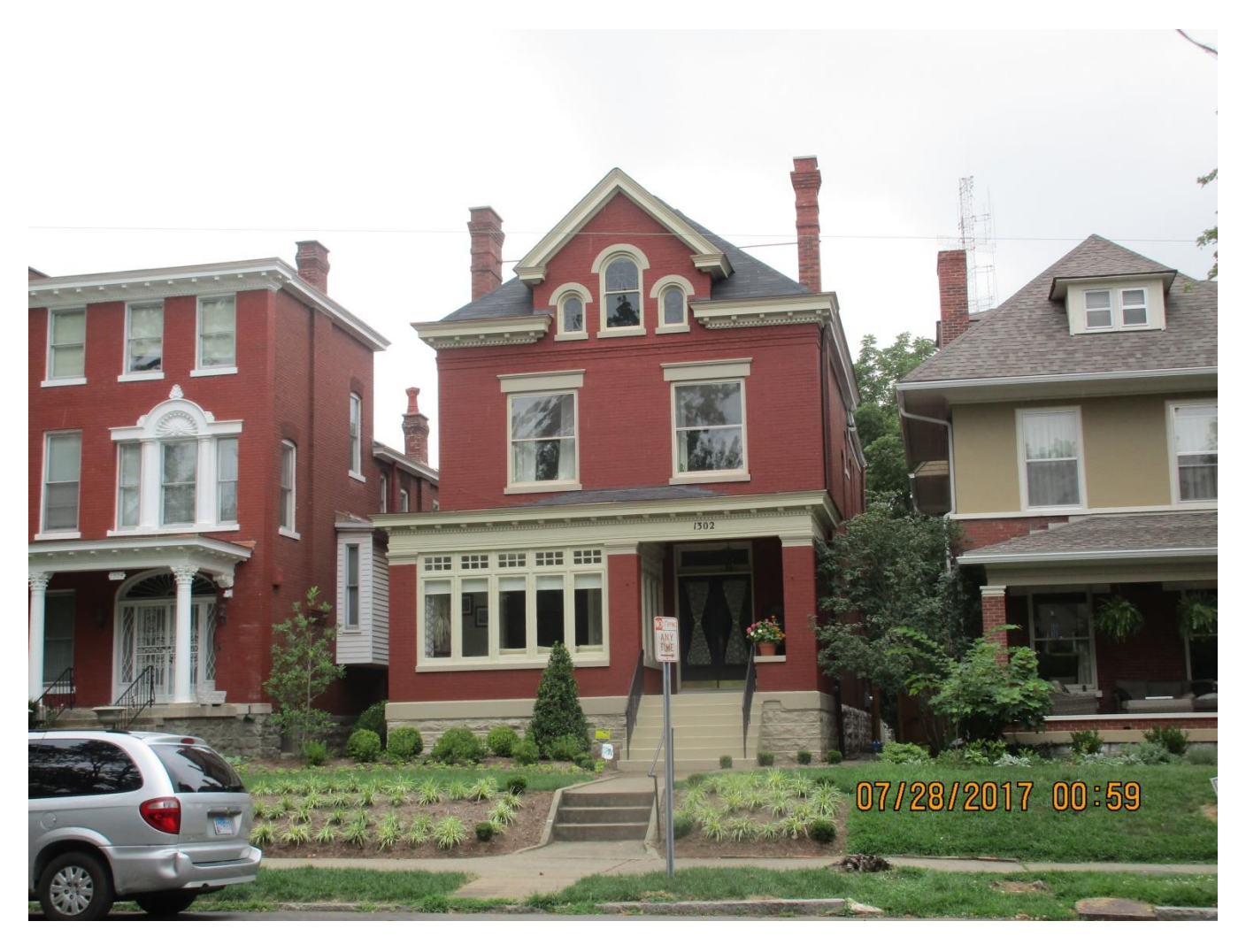
The property to the left of the subject property.