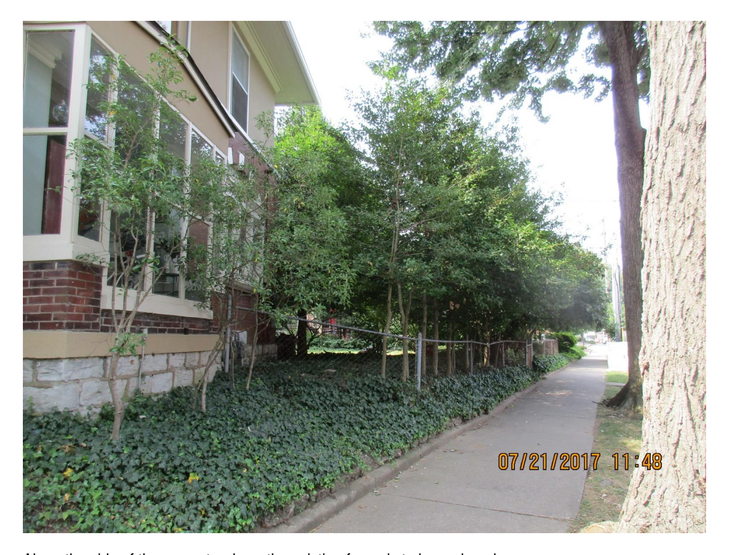
Along the side of the property where the existing fence is to be replaced.