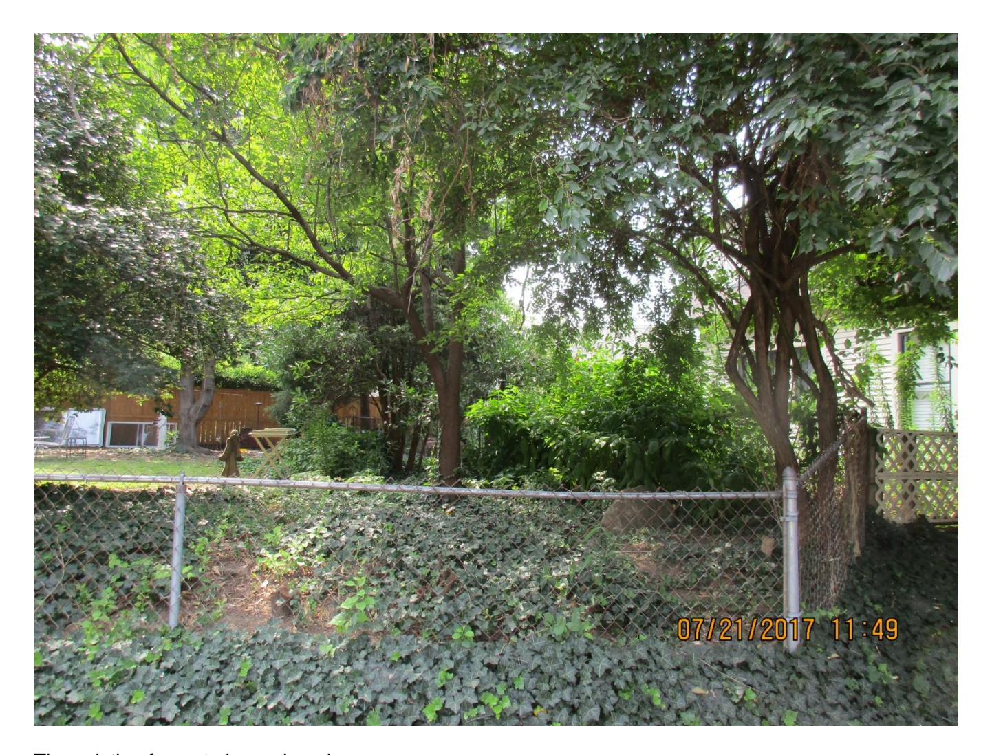
The existing fence to be replaced.