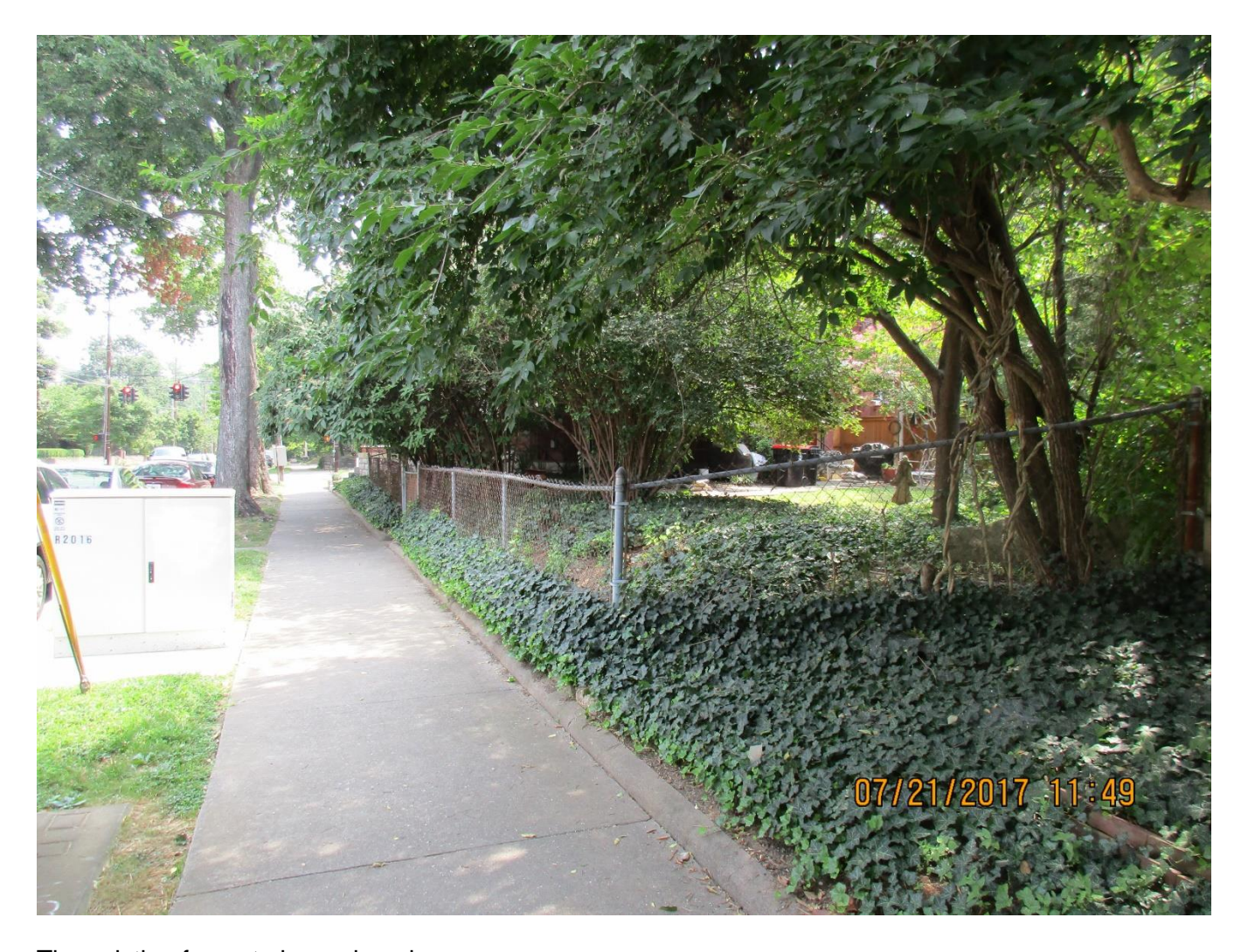
The existing fence to be replaced.