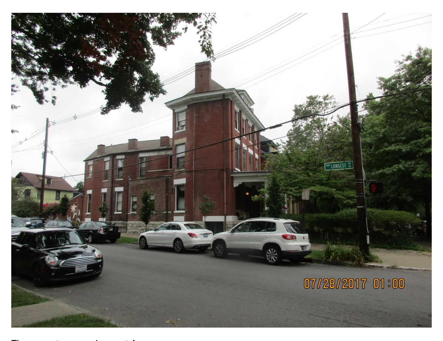
The property across Longest Avenue.