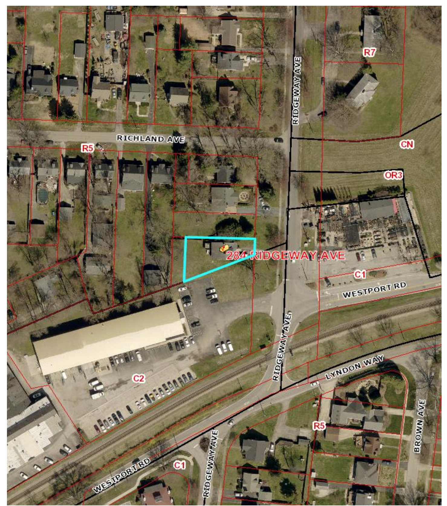
3. Staff Checklist Cornerstone 2020