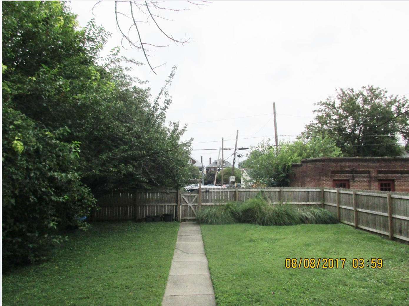
Rear Yard: House to Alley