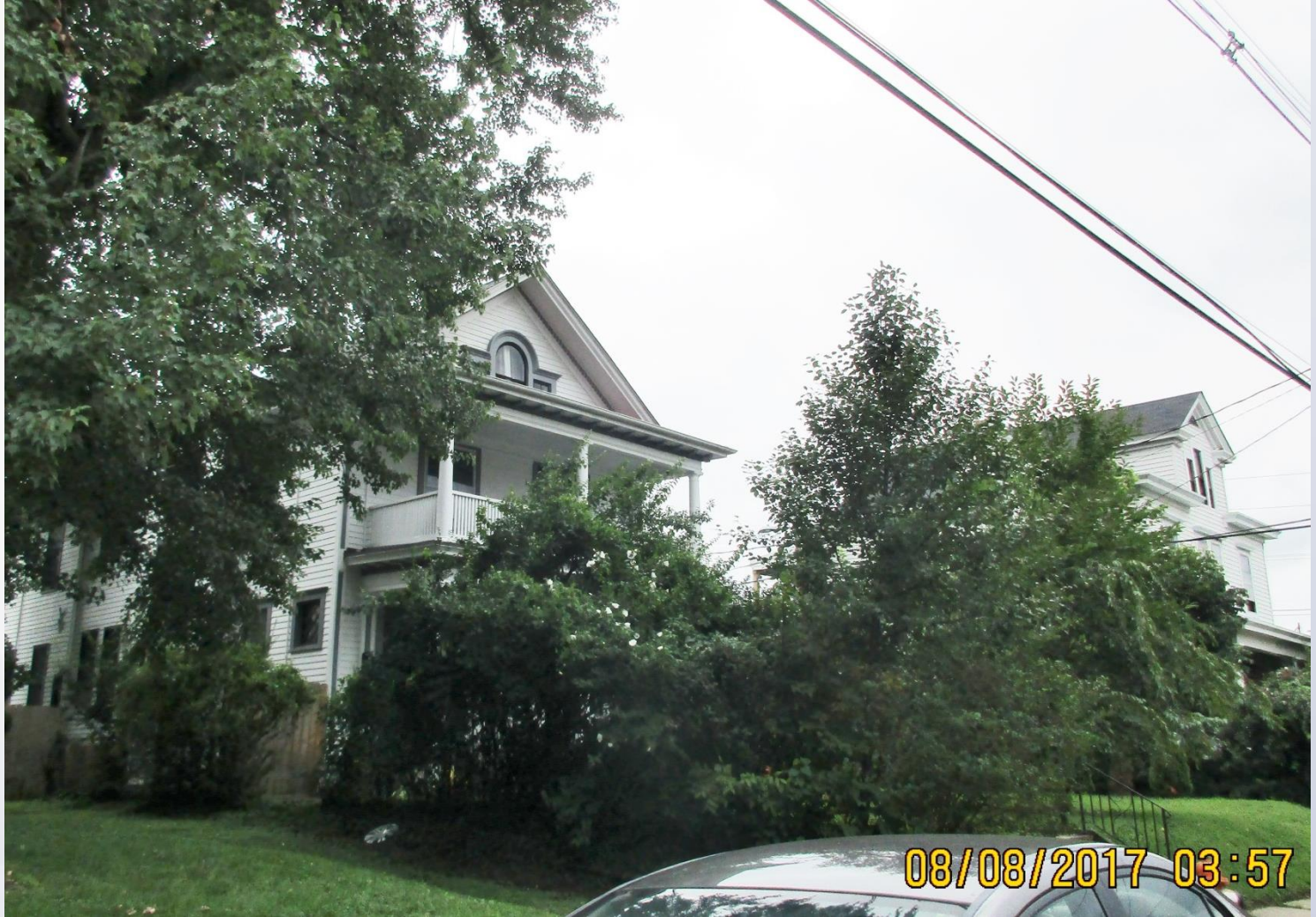
Adjacent to West