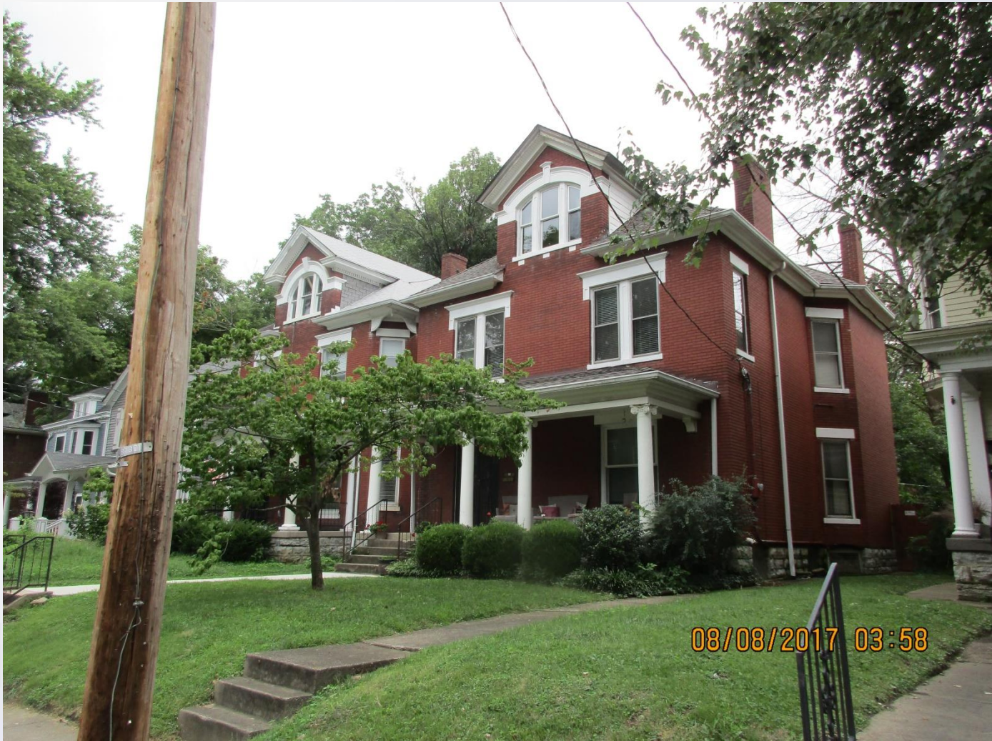
Adjacent to East