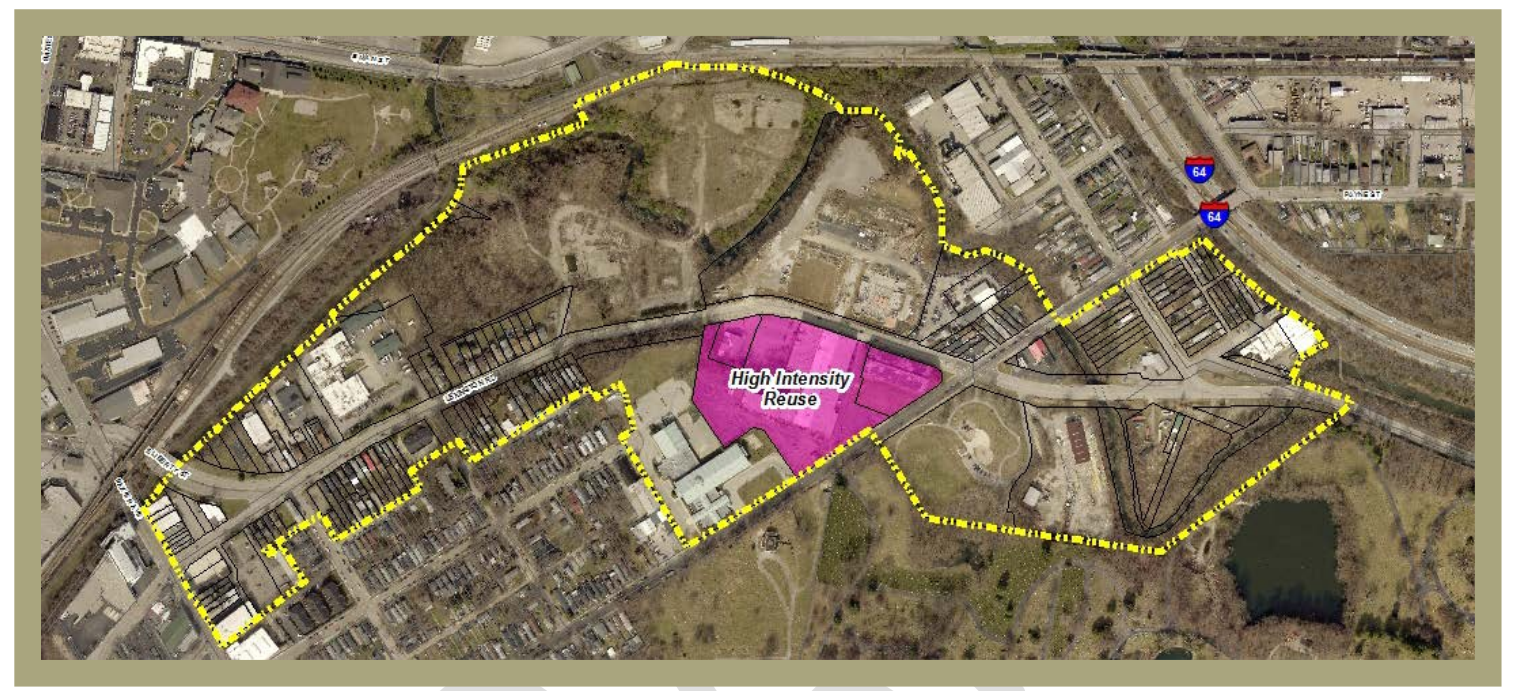
LU4 is permitted in the High-Intensity Reused sub-area depicted above.