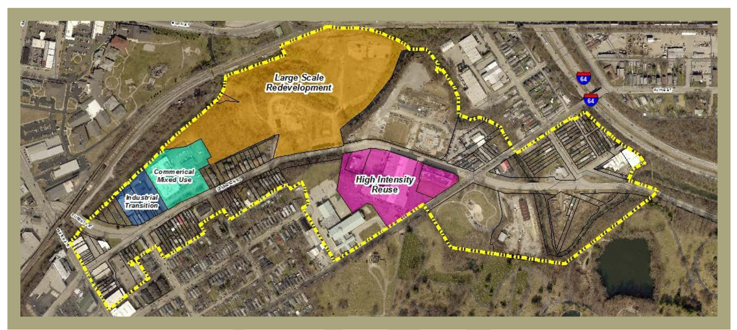
LU1 is permitted in each of the sub-areas depicted above.