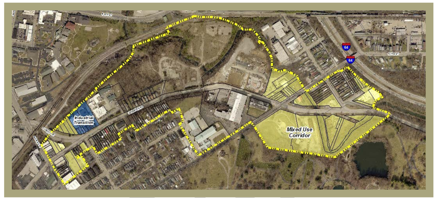
LU2 is permitted in the Industrial Transition sub-area (blue) while LU3 is permitted in all subareas..