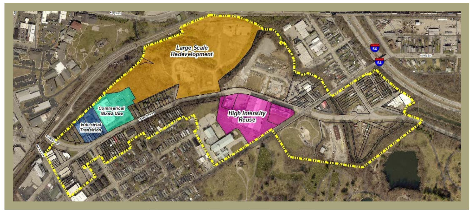
LU1 is permitted in each of the sub-areas depicted above.