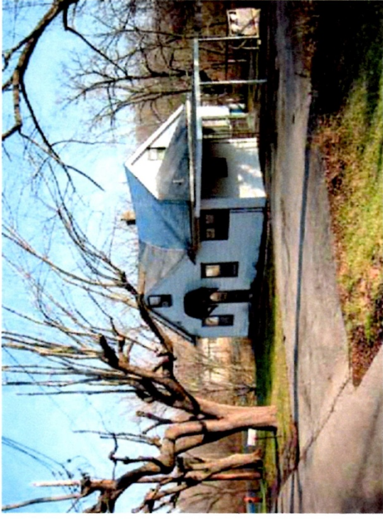
Typical home on Eastwood Fisherville Road

Most of the properties within the Village Center are zoned residential and commercial. There are two properties which are zoned M-2, Industrial, also located within the Village Center. These include Kentuckiana Auto Sales at 16121 Shelbyville Road and East End Welding at 116 Gilliland Road. An area-wide rezoning to downzone these properties to C-1 would permit land uses in the future which are compatible with uses envisioned for the Village Center. Current use of the M-2 properties would continue as non-conforming land uses. The requirements and restrictions of the less intense C-1 would only apply for new development and expansion.