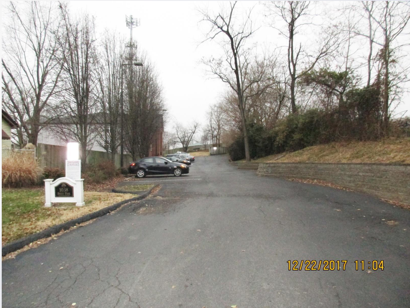
Site from Brent Street