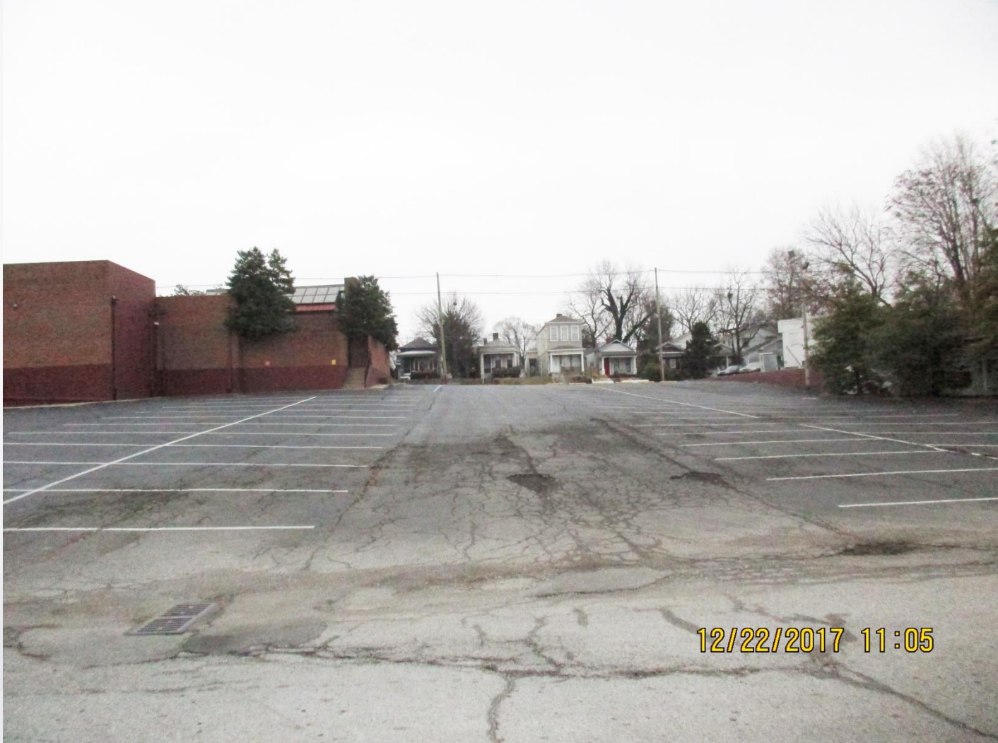
Across to East