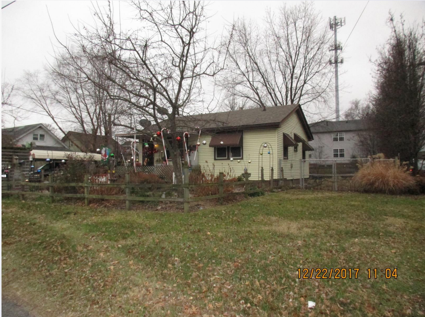
Adjacent to South