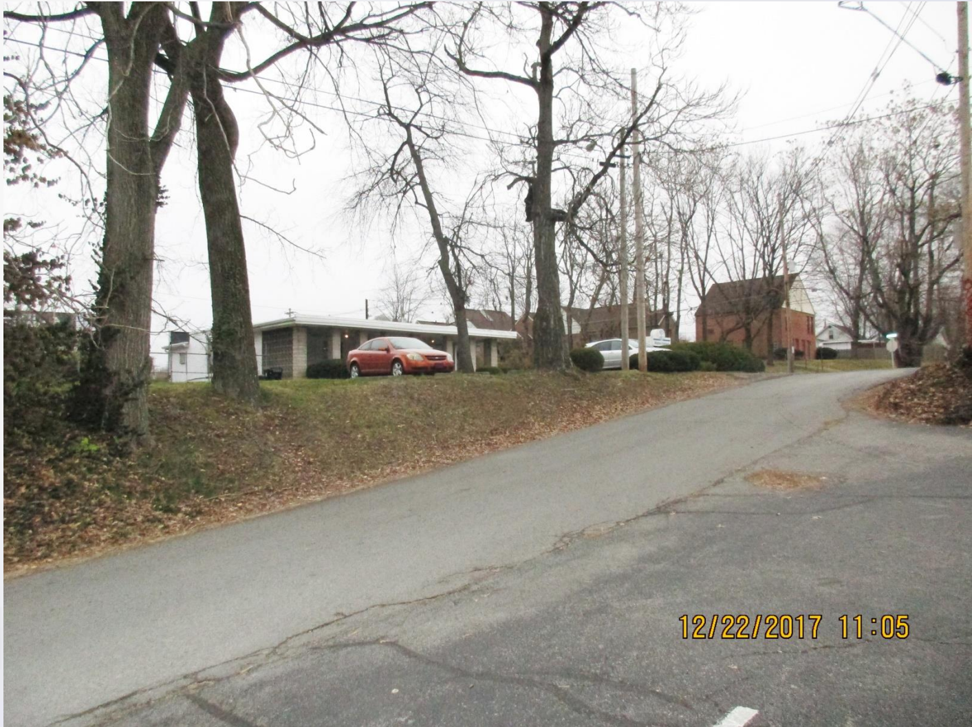
Adjacent to North