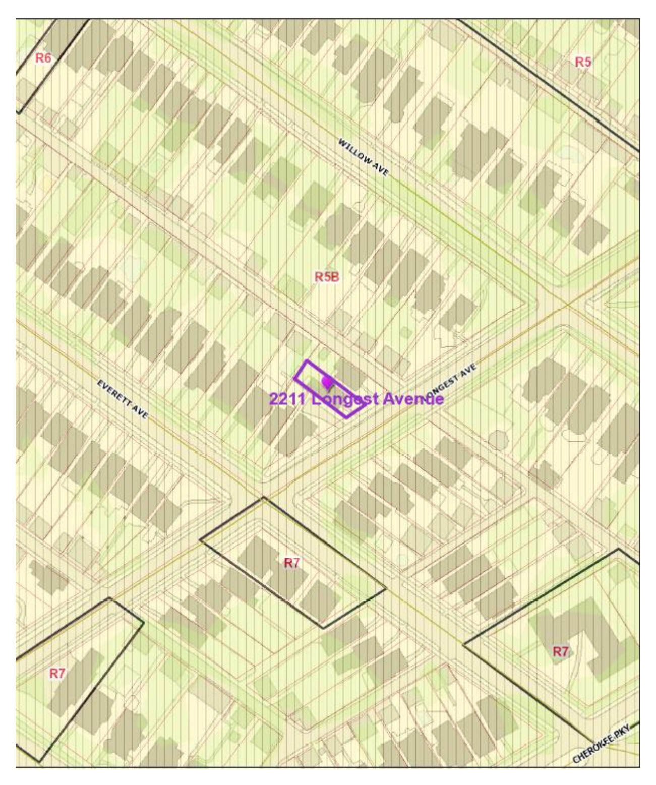
2. <u>Aerial Photograph</u>