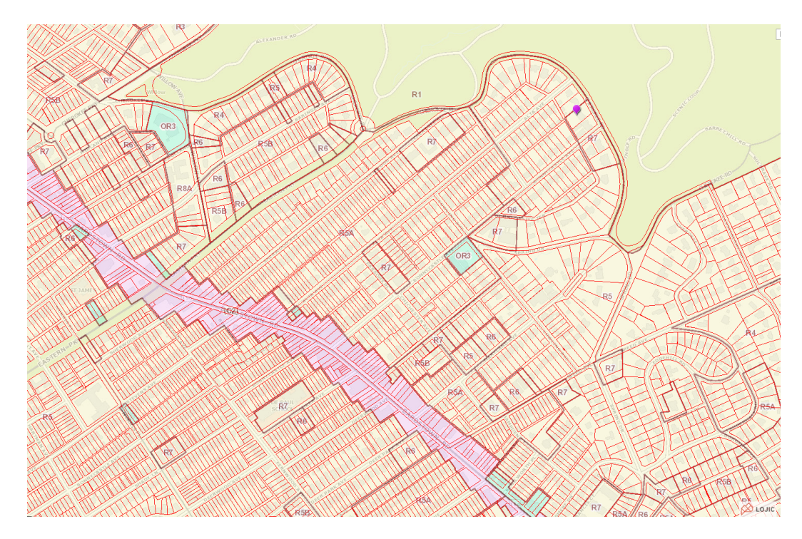
Figure 2. The proposed development would be the only R-8A zoning in the area, and would be surrounded by R-5 properties with the exception of the Southwest neighbor on Cherokee Road.

10) Neighbors, the BHA, and others have met and are willing to meet with the developers. However, the developers insist on increasing the height and bulk of the building in a way that destroys the character of the neighborhood and far exceeds the allowable limits.