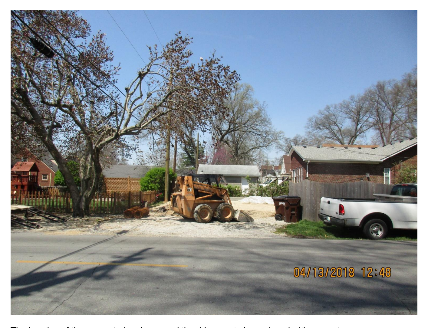
The location of the requested variance and the driveway to be replaced with concrete.