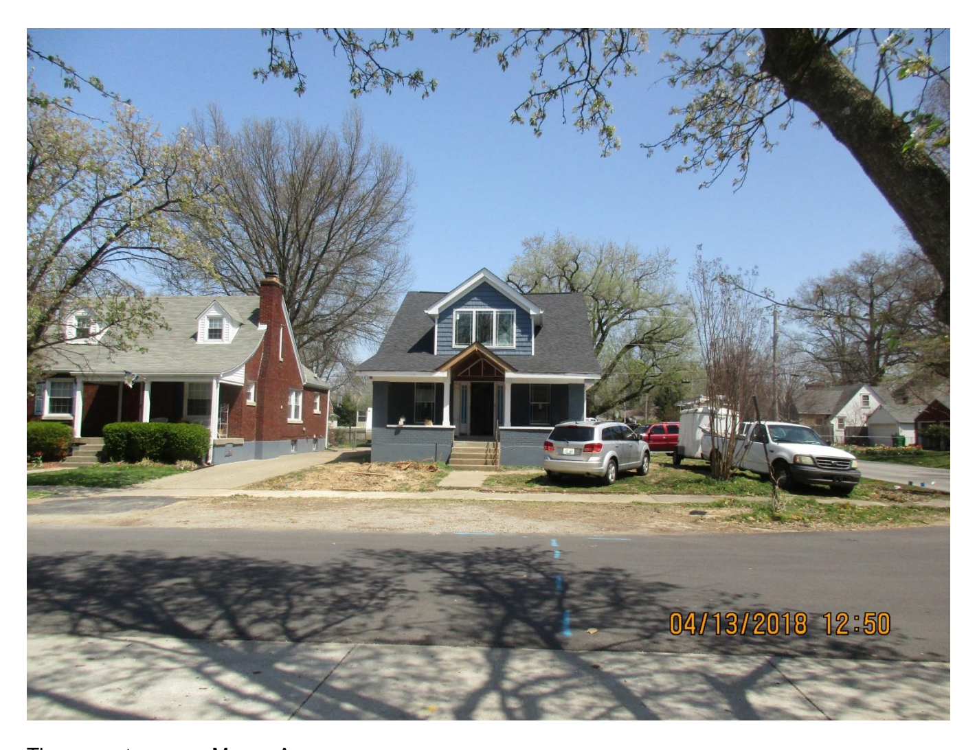
The property across Macon Avenue.