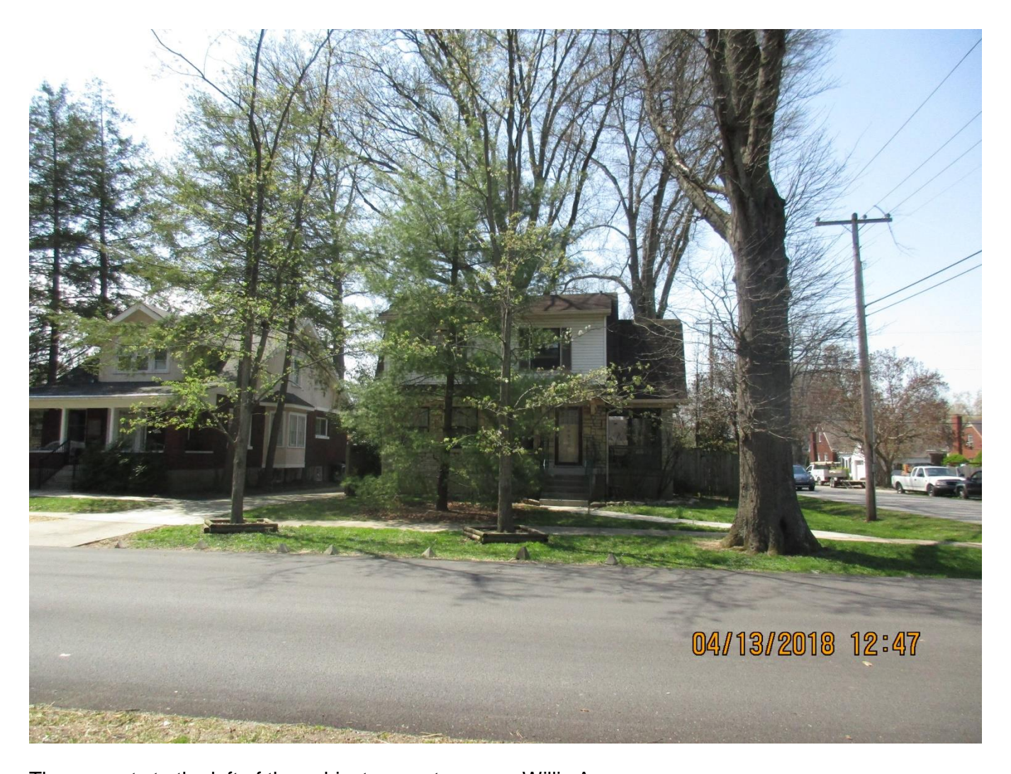
The property to the left of the subject property across Willis Avenue.