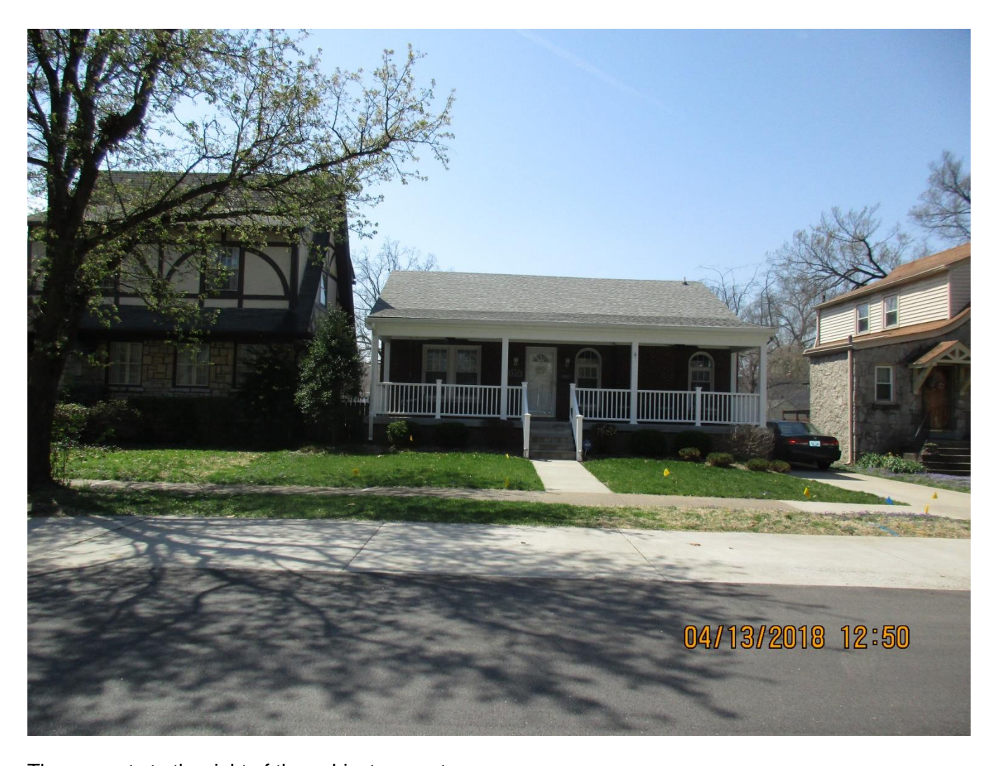
The property to the right of the subject property .