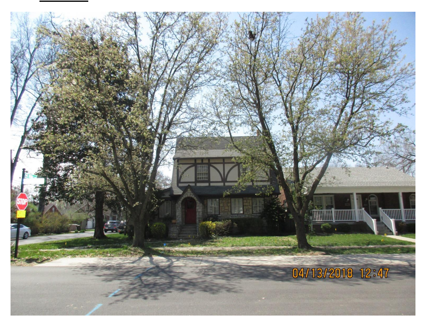
The front of the subject property.