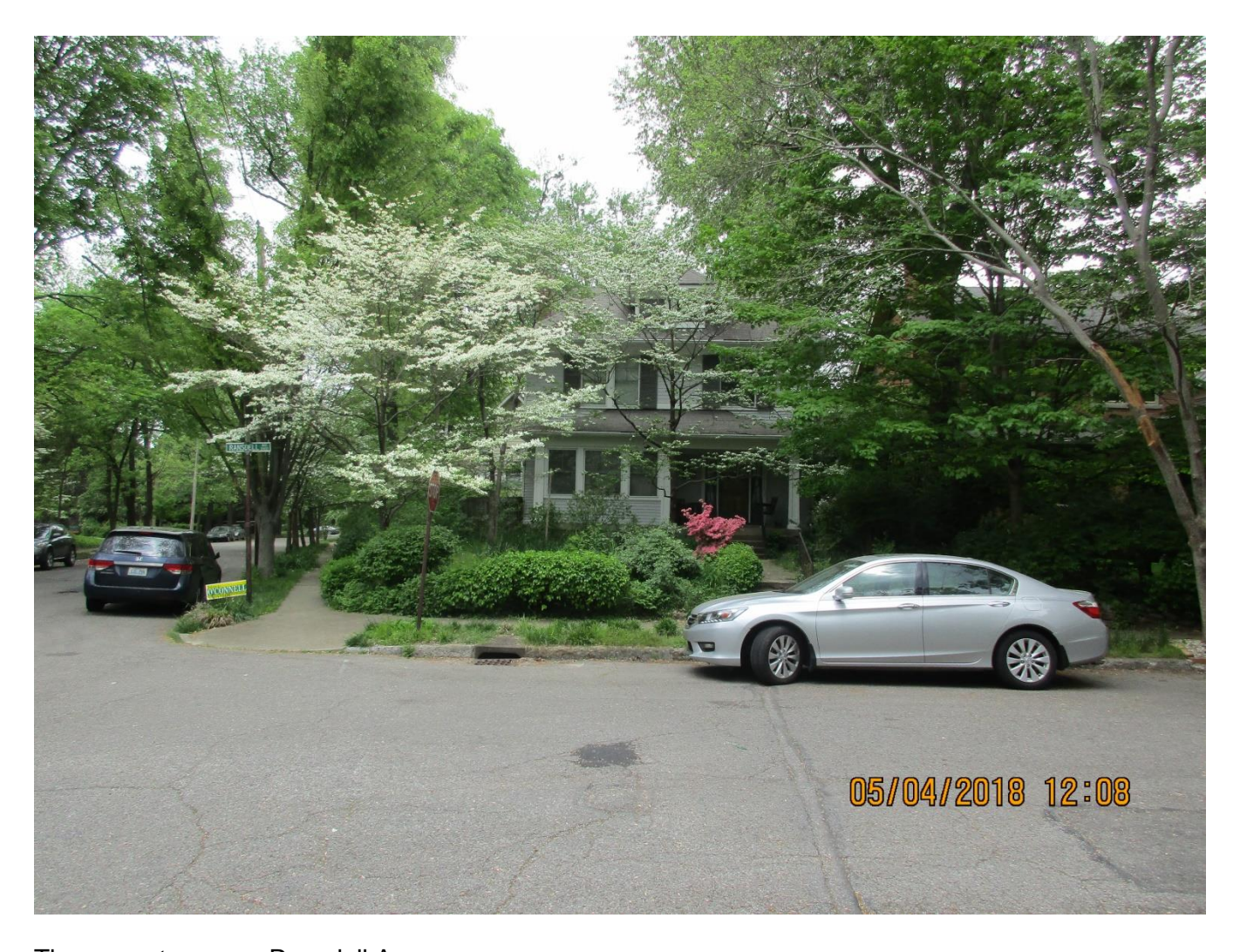
The property across Ransdell Avenue.