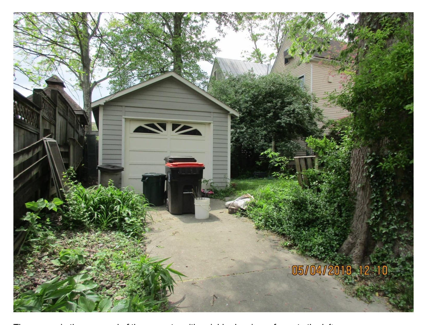
The garage in the rear yard of the property, with neighbor's privacy fence to the left.