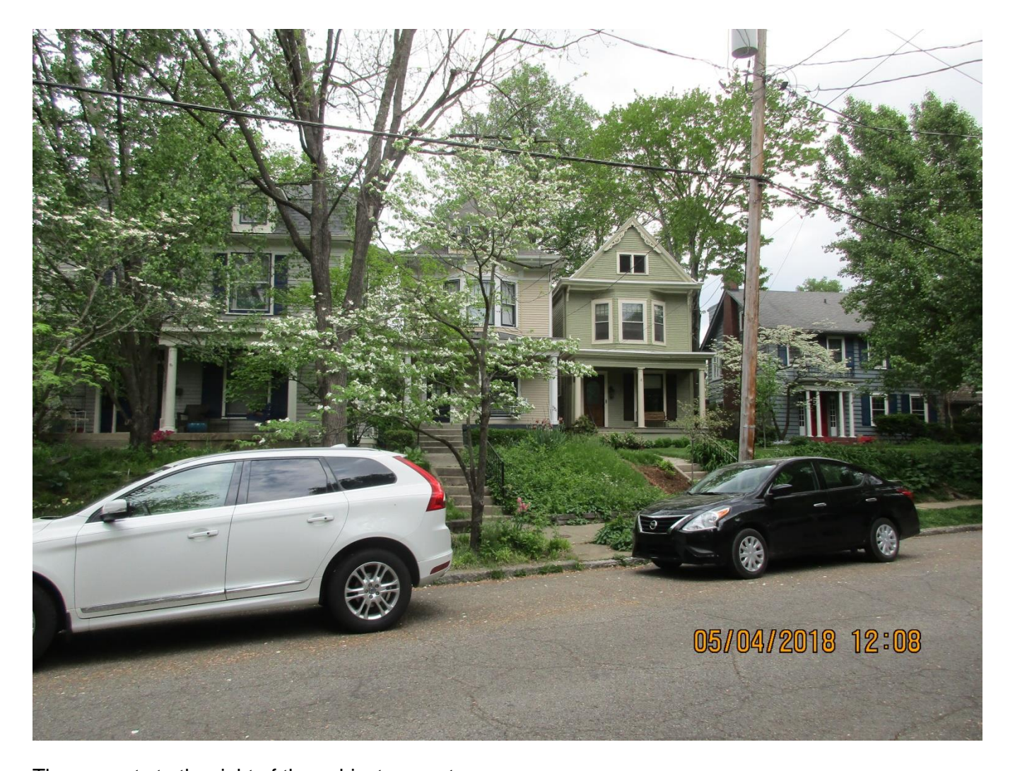
The property to the right of the subject property.