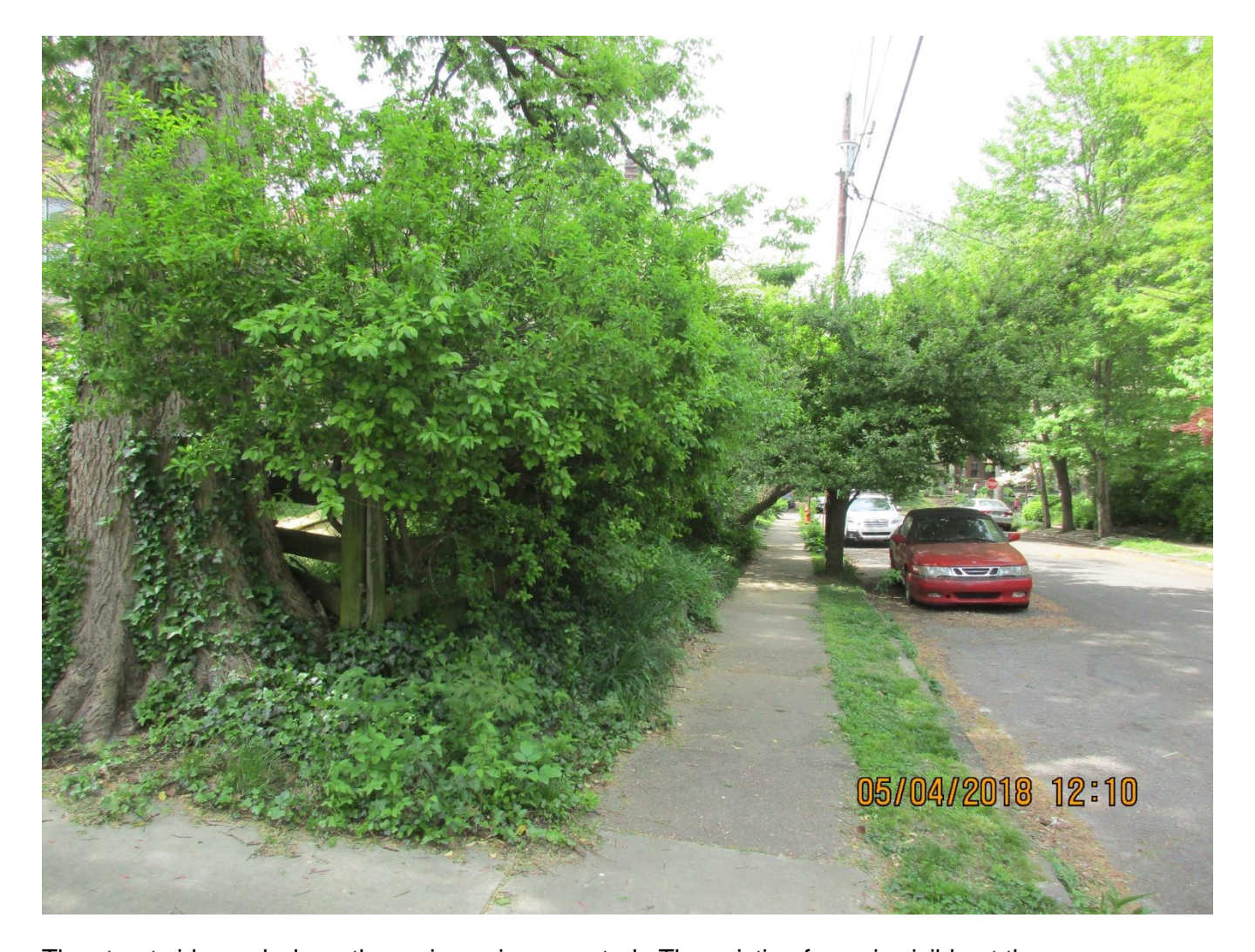
The street side yard where the variance is requested. The existing fence is visible at the corner.