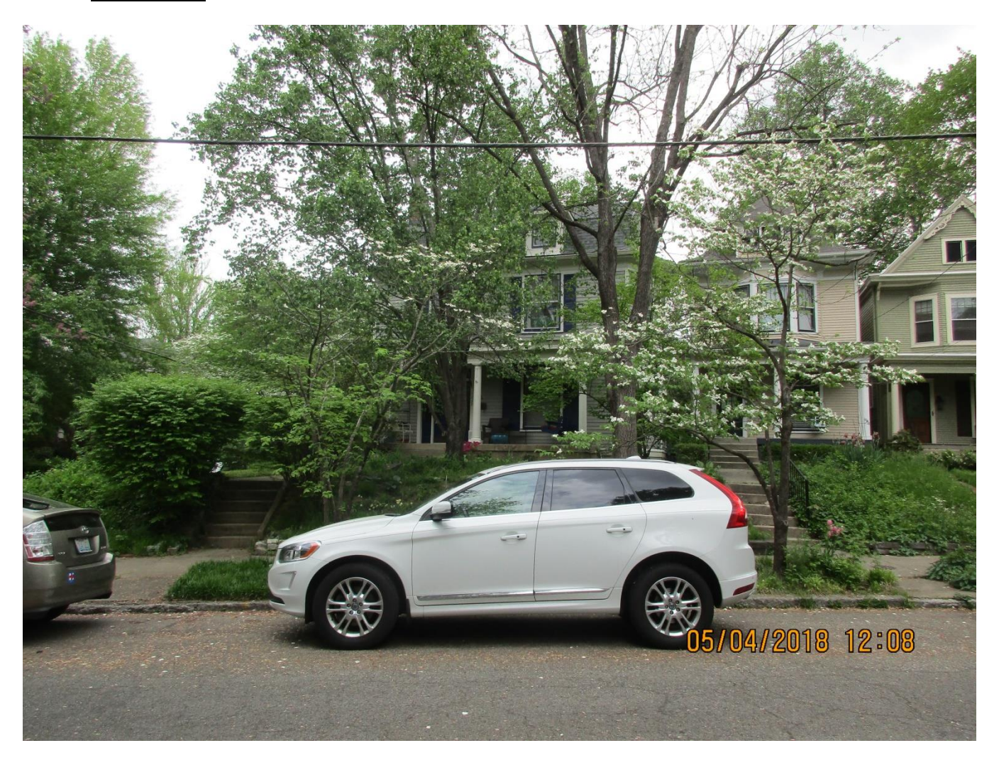
The front of the subject property.