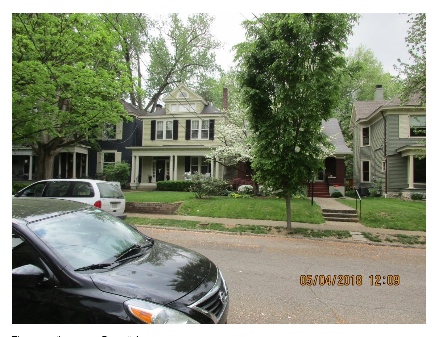
The properties across Bassett Avenue.