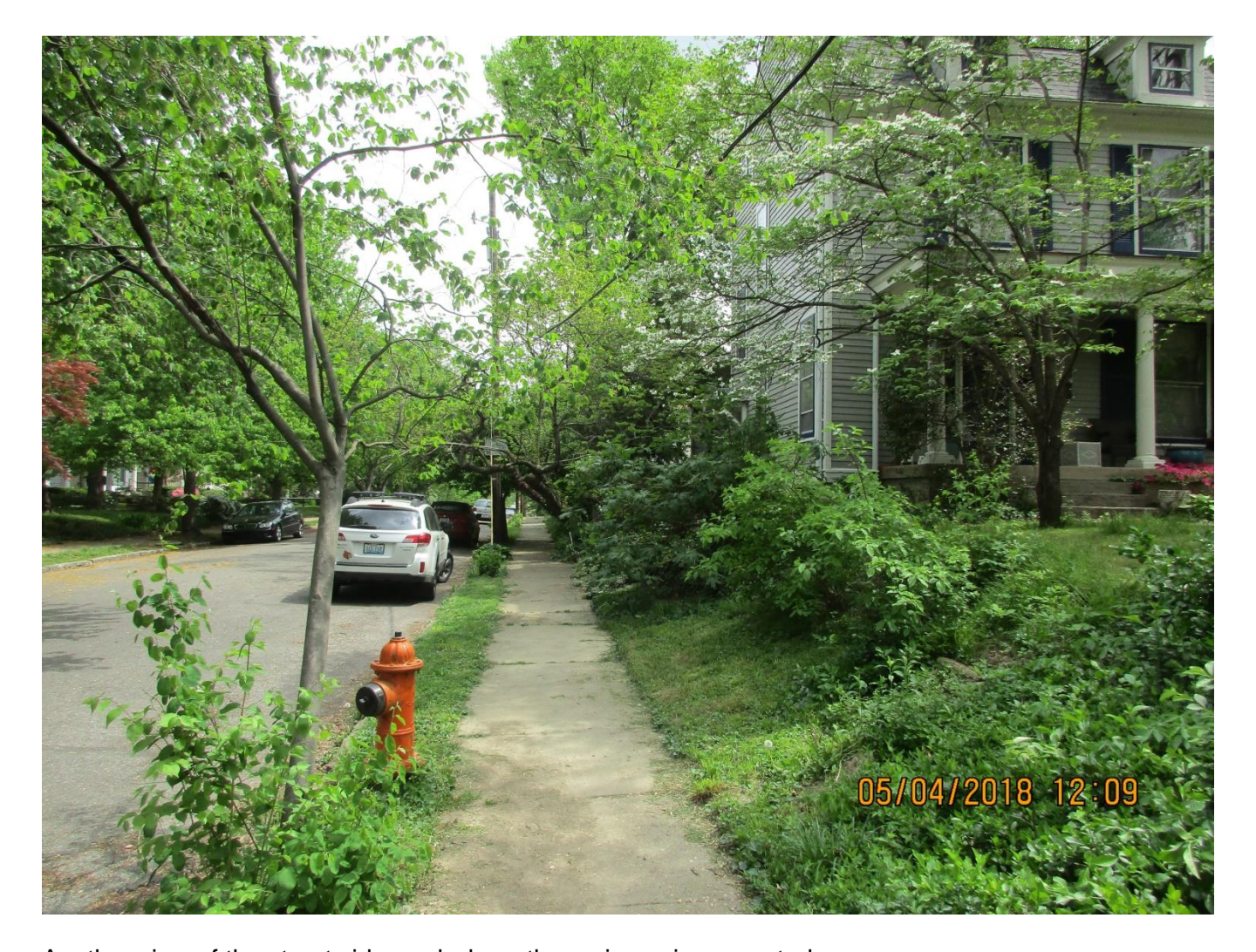
Another view of the street side yard where the variance is requested.