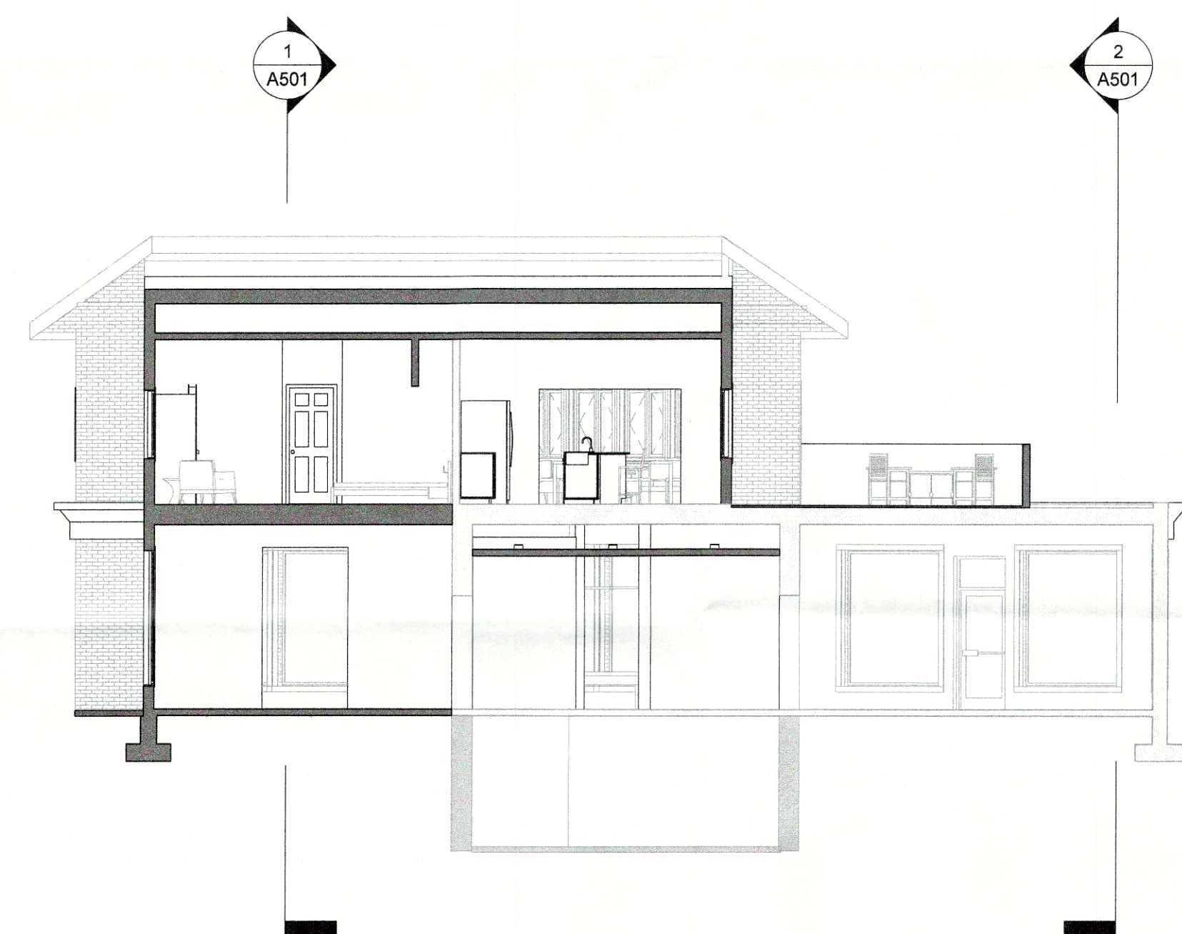
3 BUILDING CROSS SECTION - 2 1/8" = 1'-0"