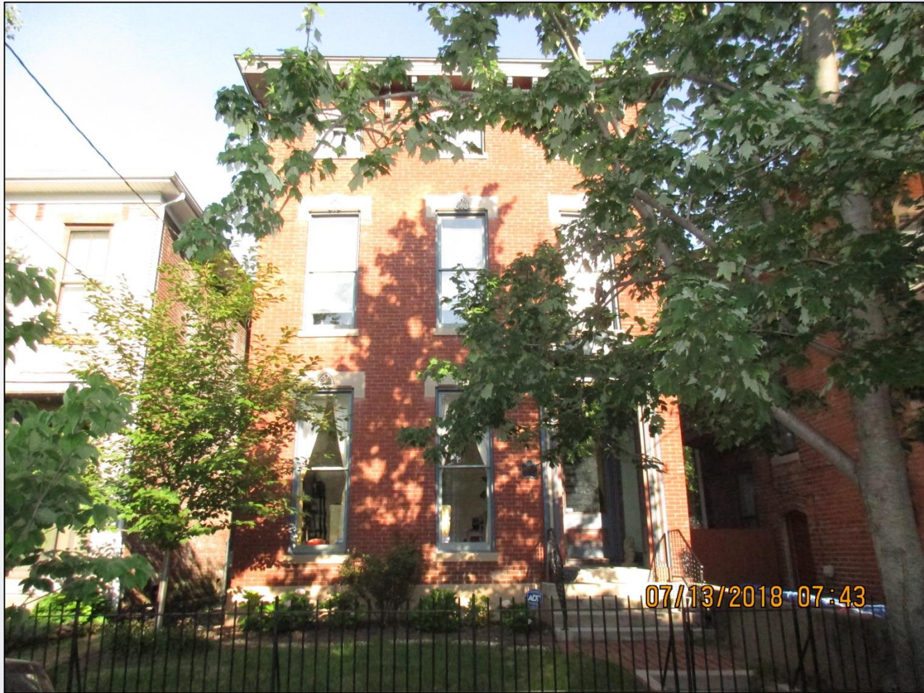
The front of the subject property.