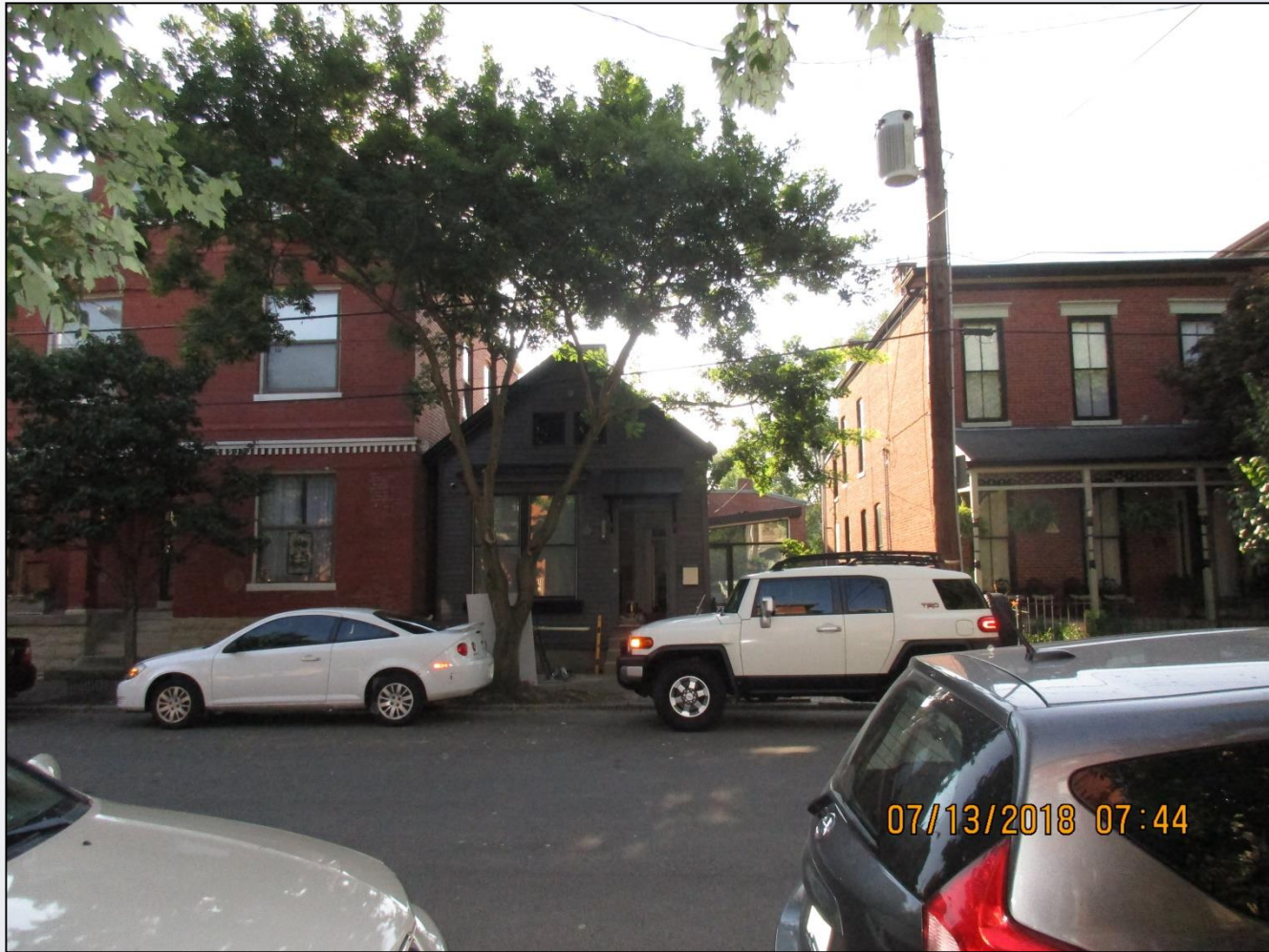
The properties across Garvin Place.