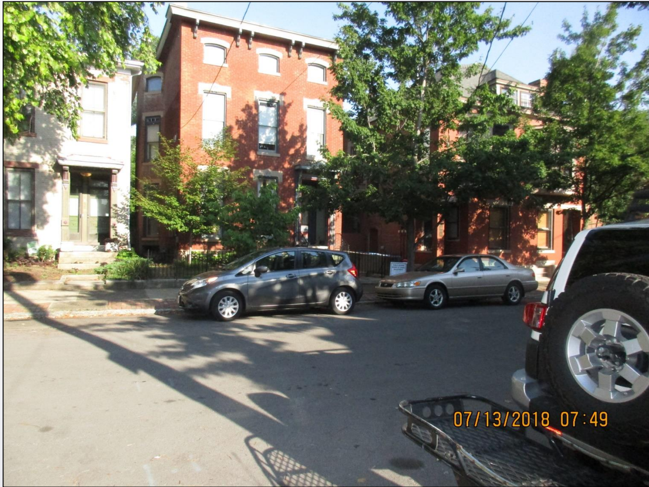
The parking in front of the structure.