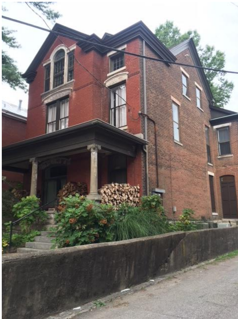
1214 S Brook St.: Façade w/ alley