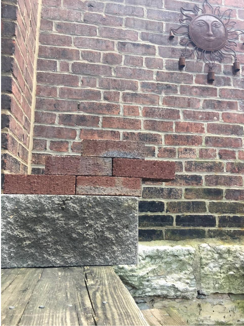
Proposed new brick on split-face foundation concrete block.