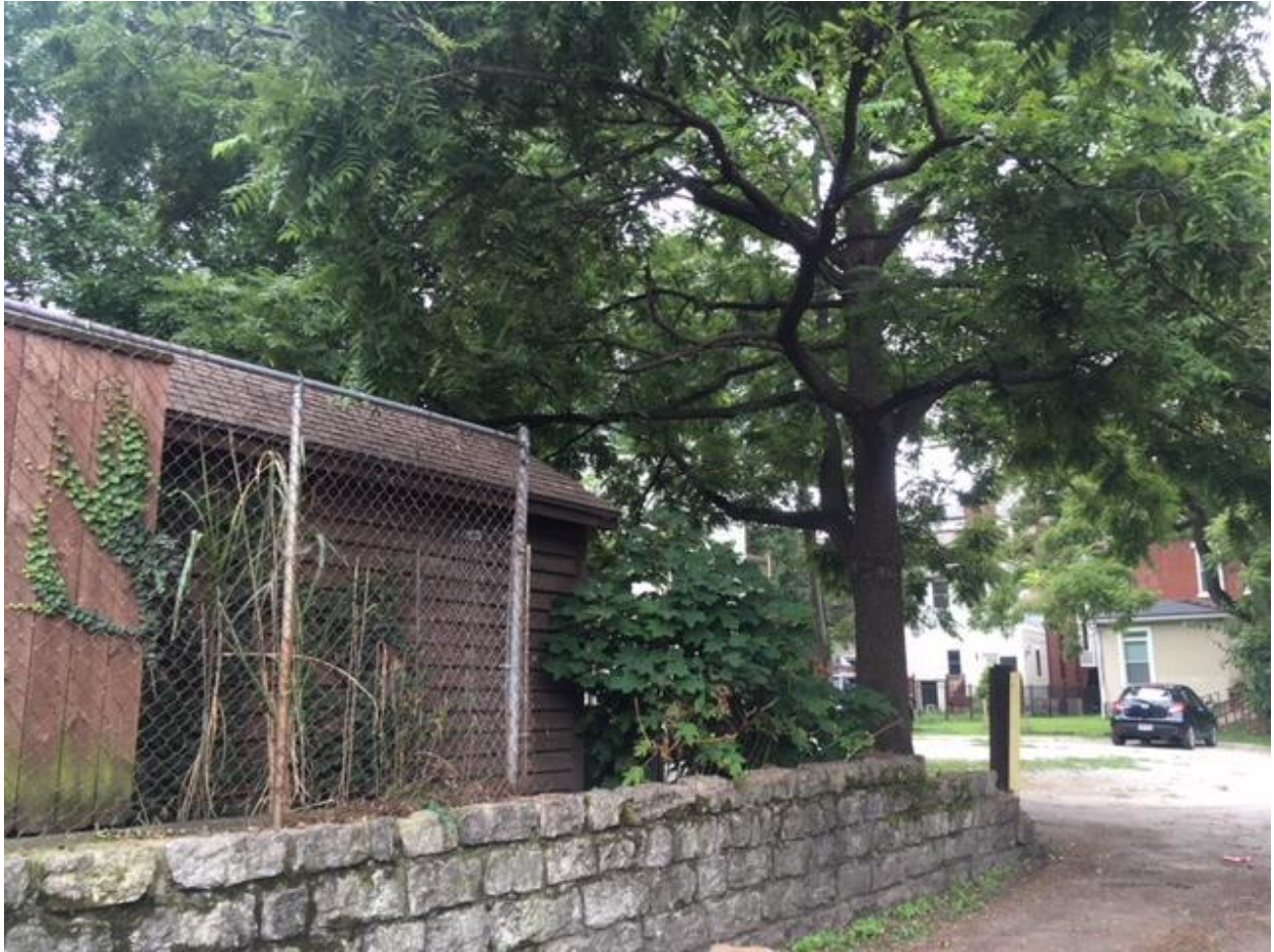
1214 S Brook St.: View down alley toward intersection