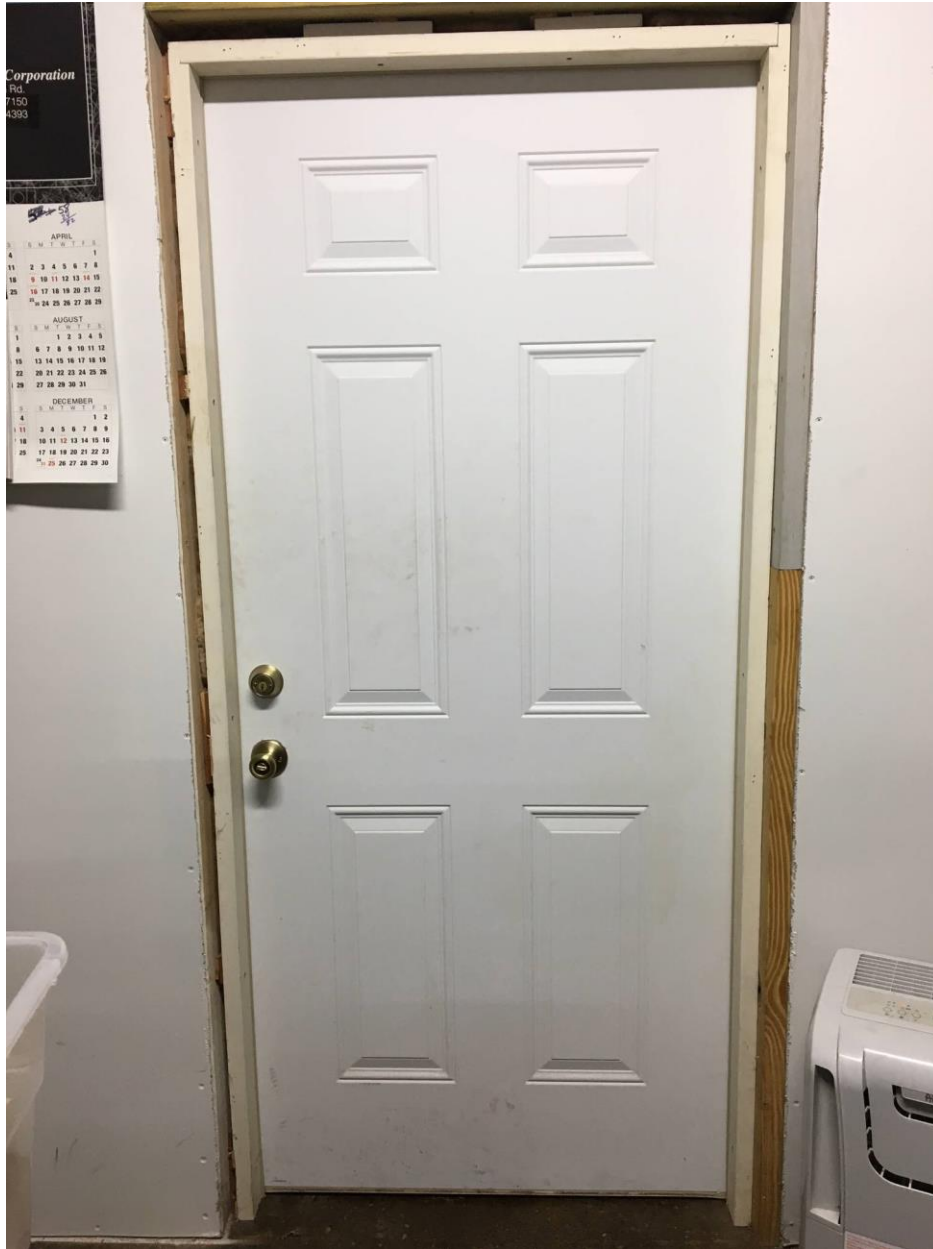
Proposed exterior steel door