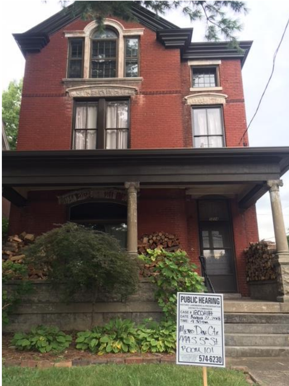
1214 S Brook St.: Facade