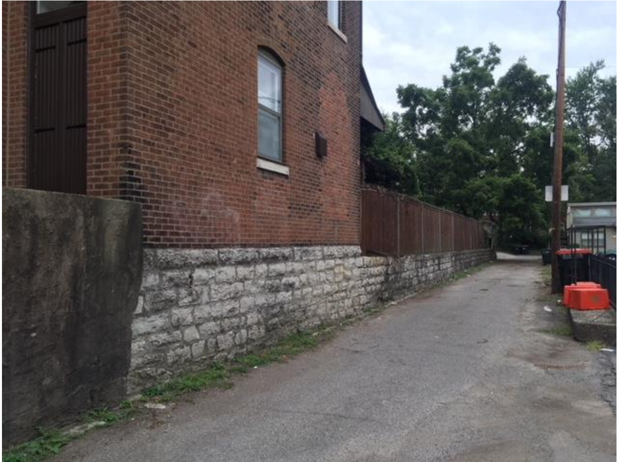
1214 S Brook St.: Foundation & Wall Detail