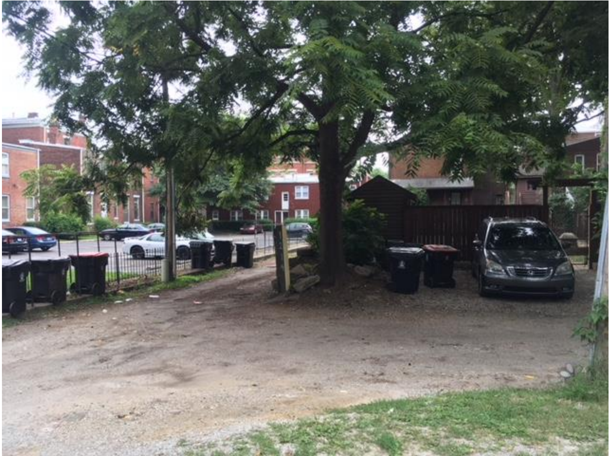
1214 S Brook St.: Three-way alley intersection