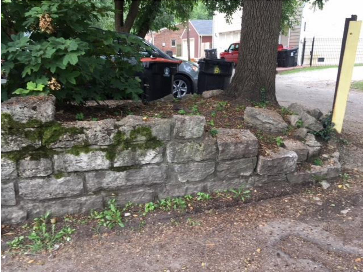
1214 S Brook St.: Limestone wall at alley intersection