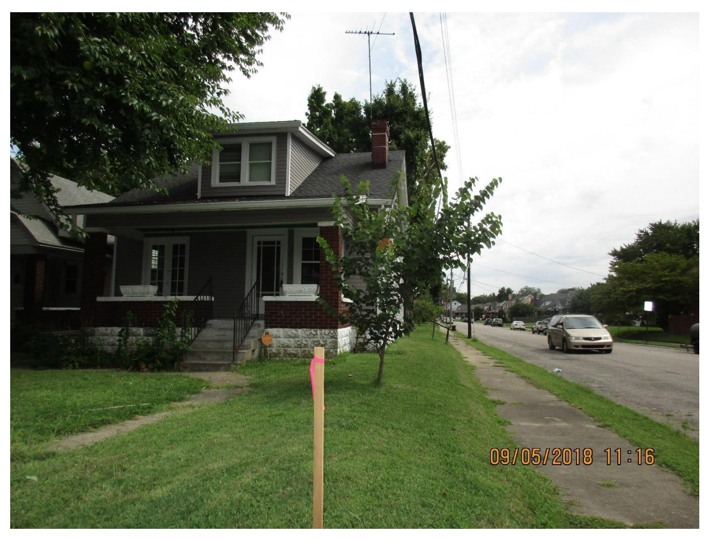
Looking down the street side property line.