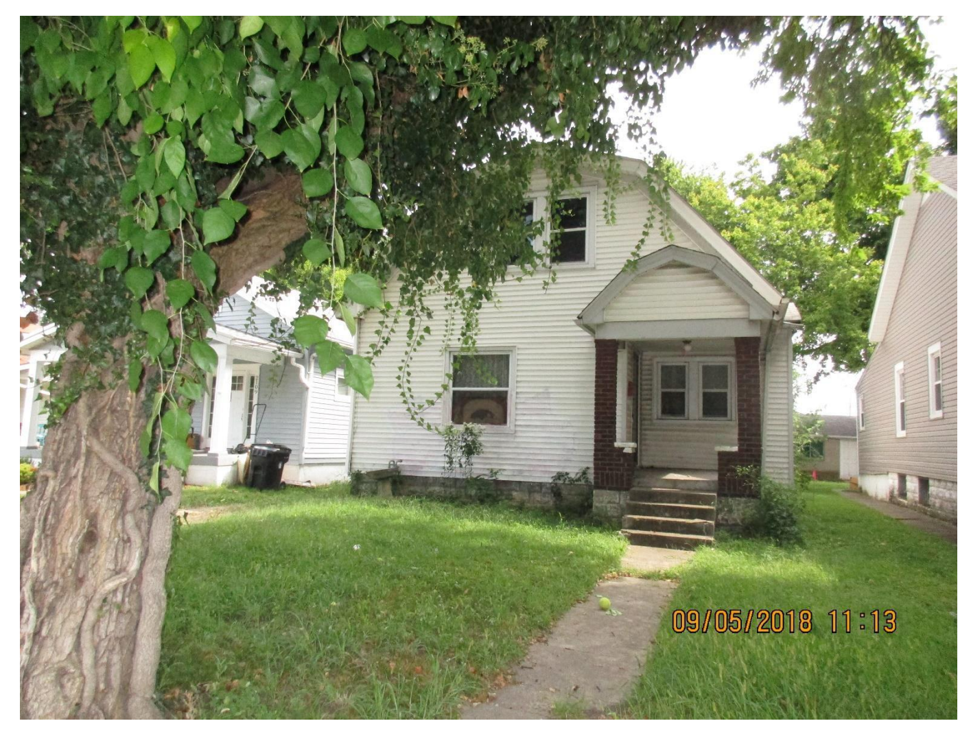
The property to the left of the subject property.