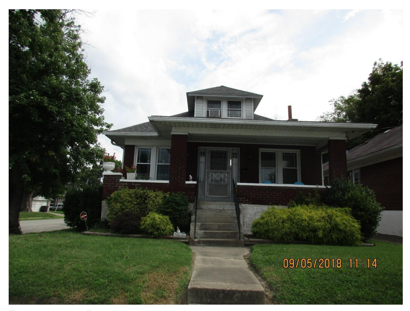
The property across Texas Avenue.