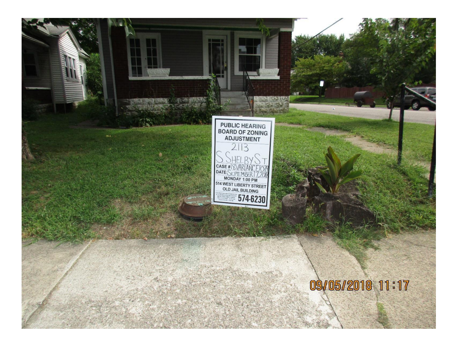
Public hearing notice sign.