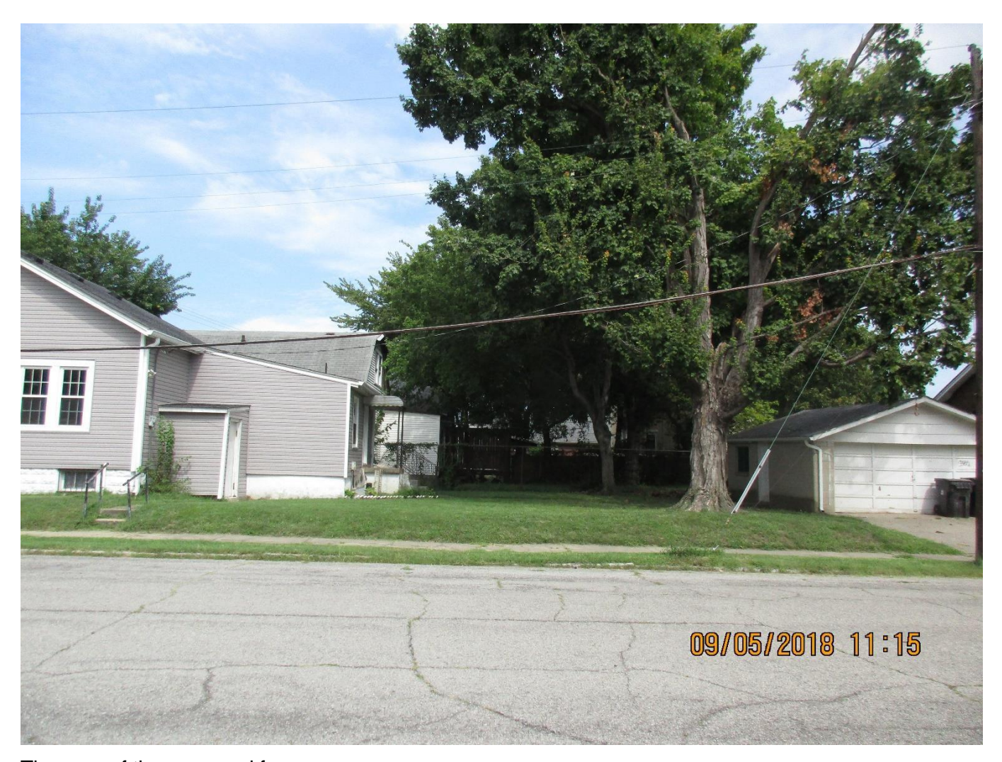
The area of the proposed fence.