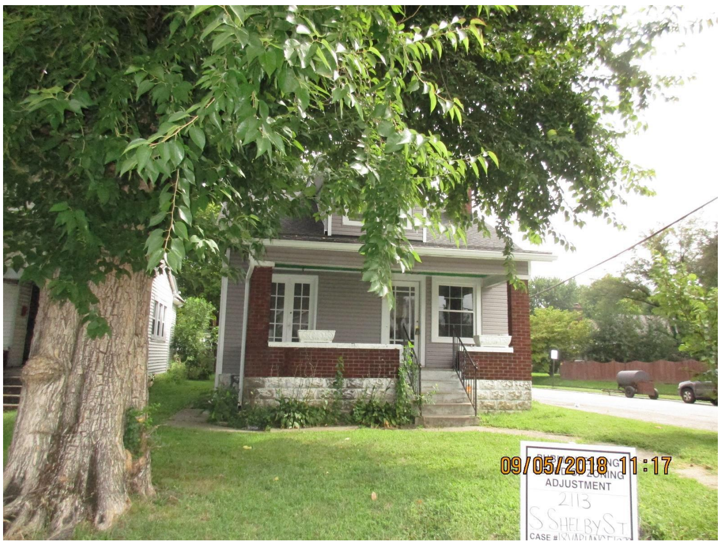
The front of the subject property.