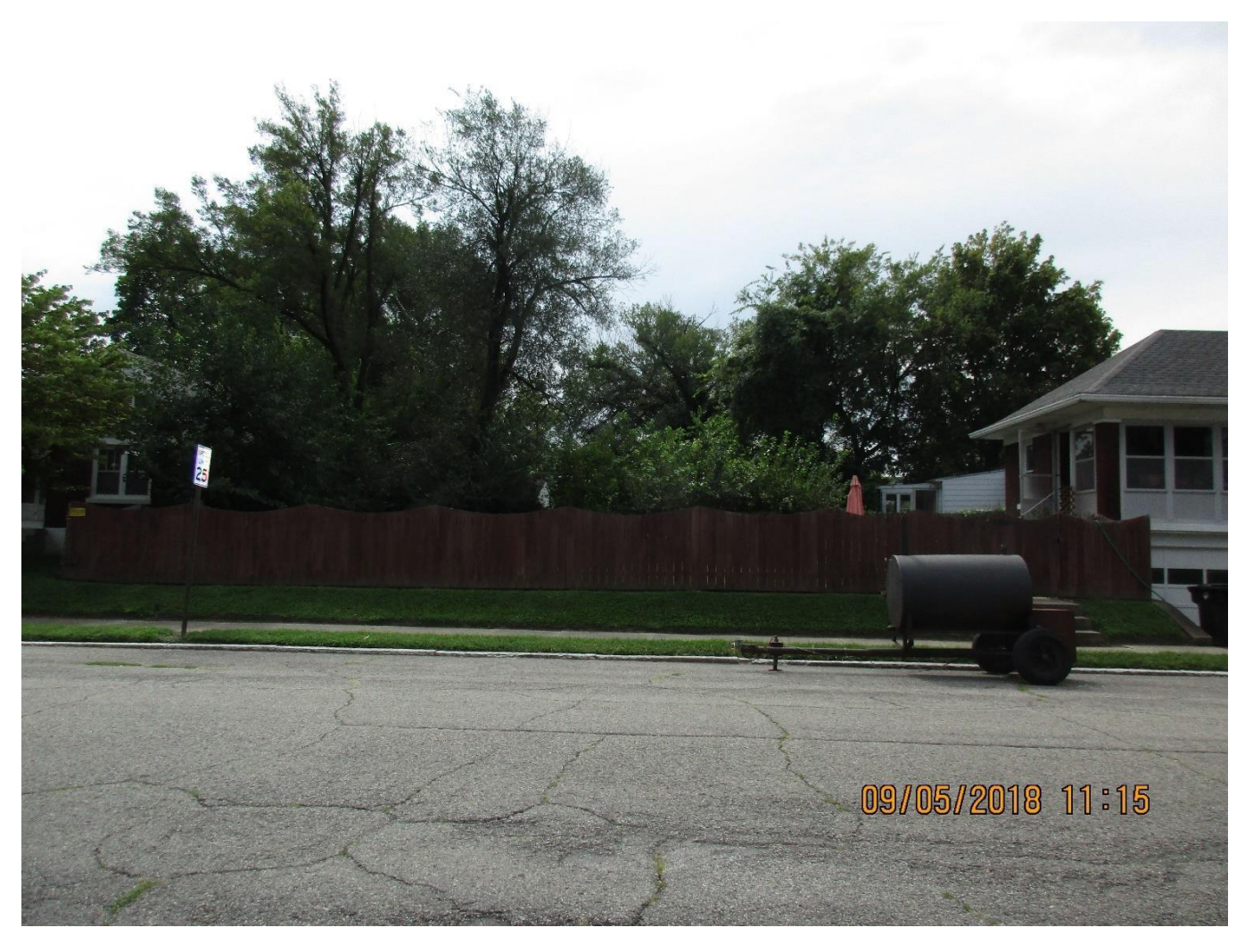
The existing fence across Texas Avenue.