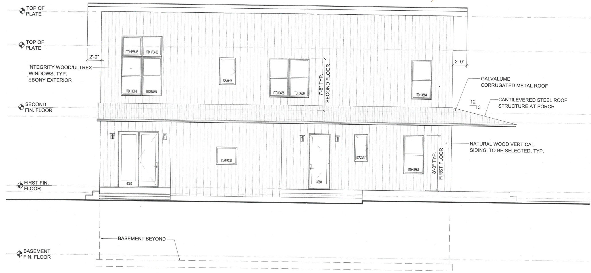
1 PROPOSED NORTH (SIDE) ELEVATION SCALE: 1/4" = 1'-0" 0 2' 4'

RECEIVED APR 13 2018 PLANNING & DESIGN SERVICES