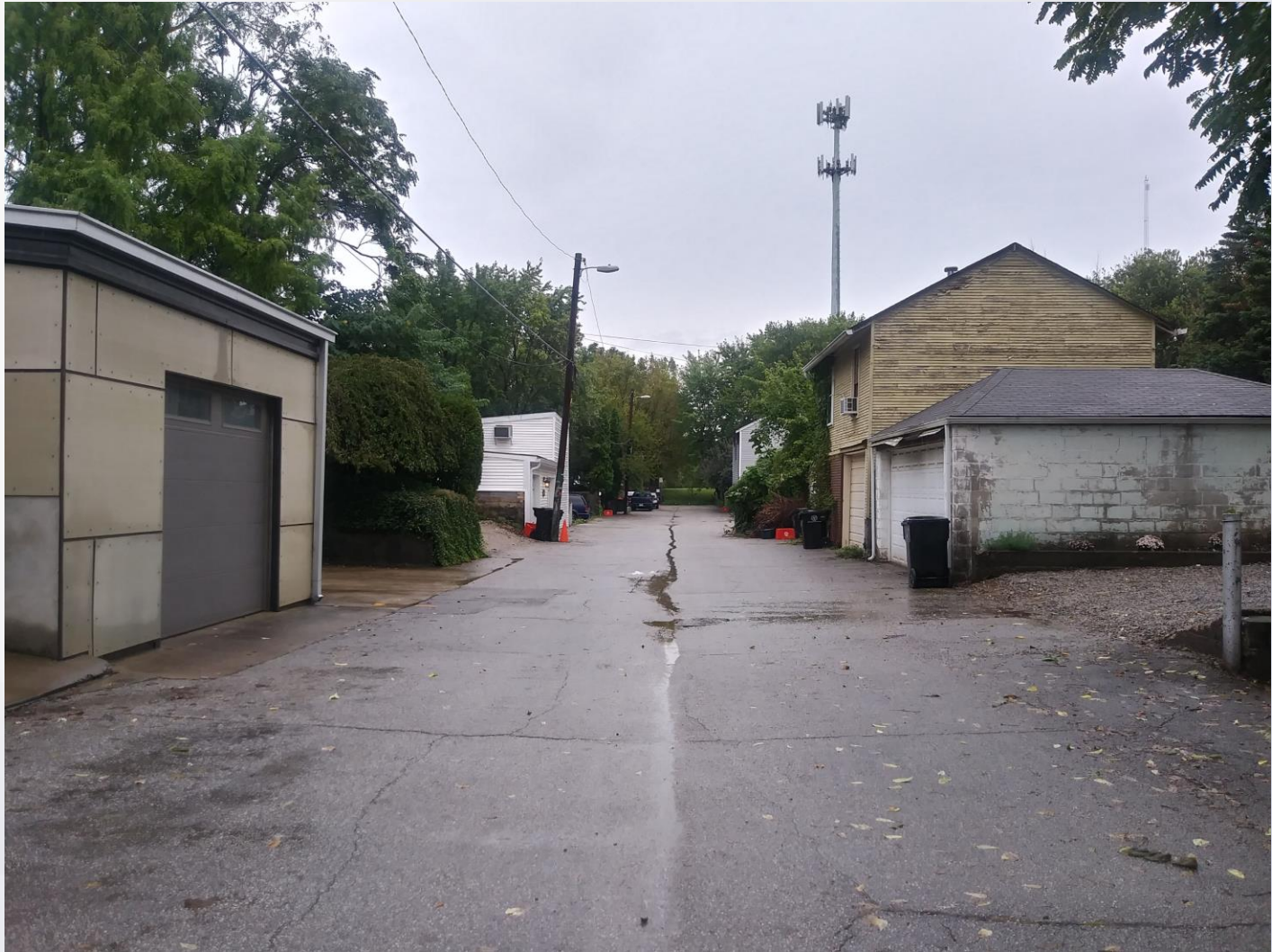
Rear Alley to East