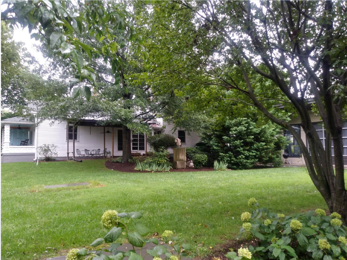
Primary Dwelling Unit