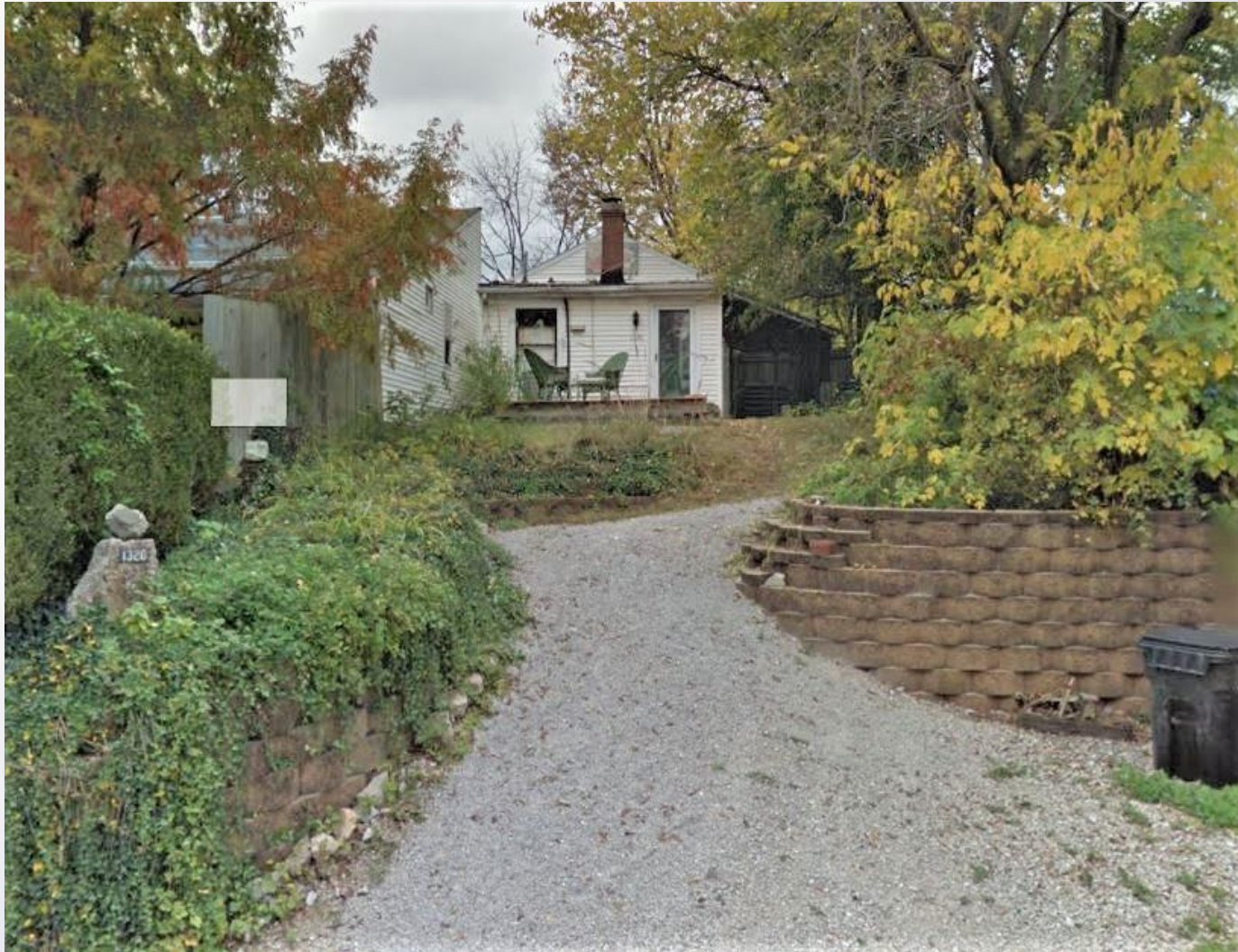
Adjacent to East