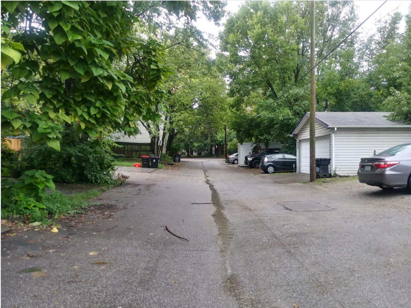
Rear Alley to West