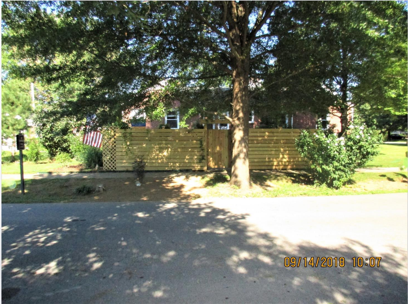
Emerson Ave Street View