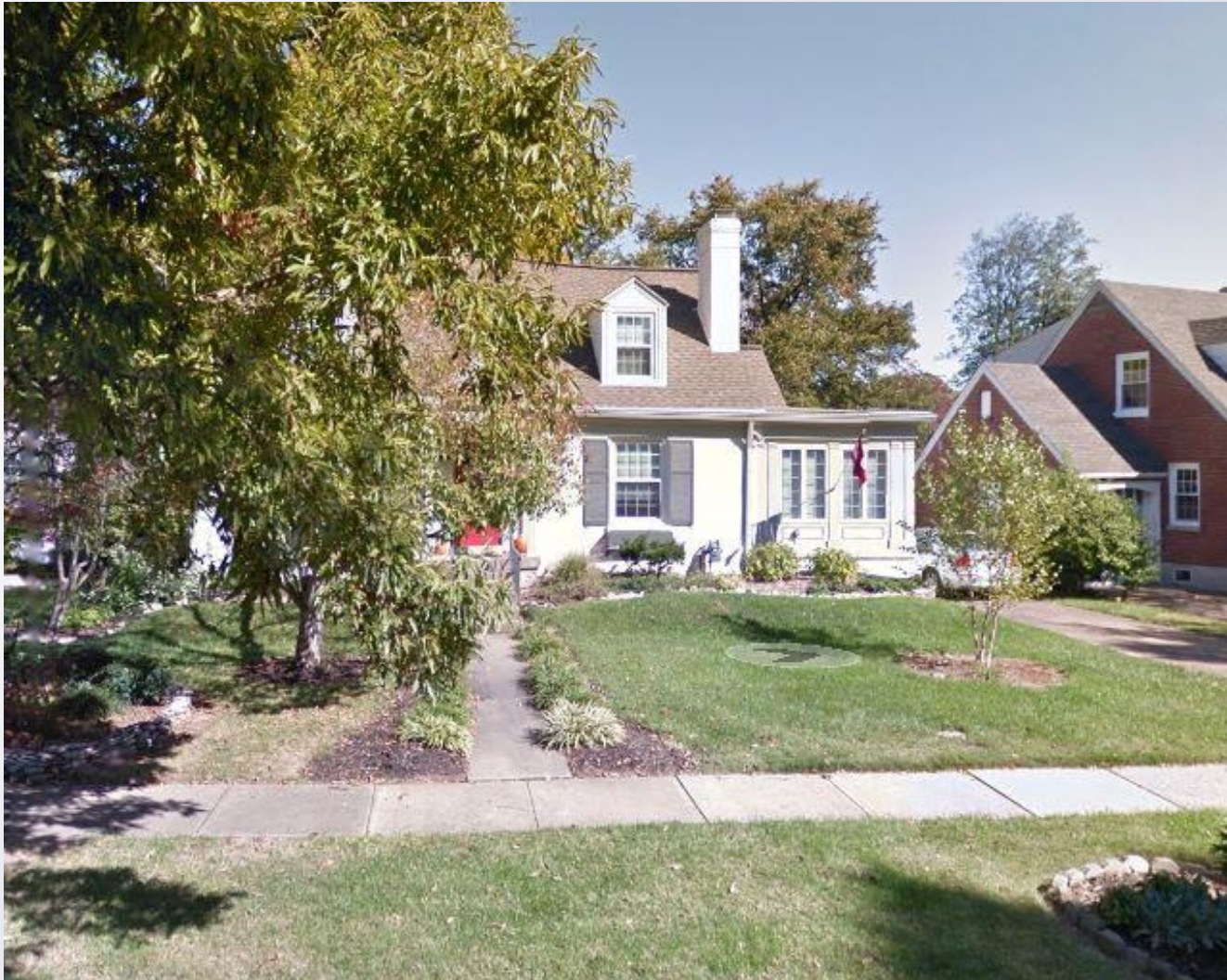
Across Kings Highway