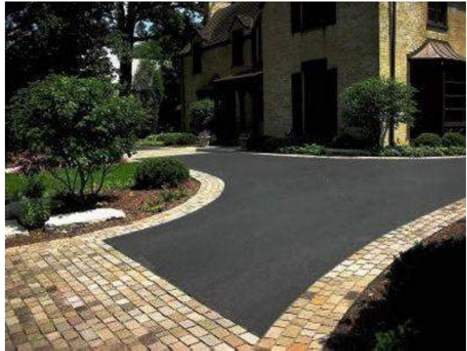
ASPHALT DRIVEWAY W/ CLAY PAVER BANDING