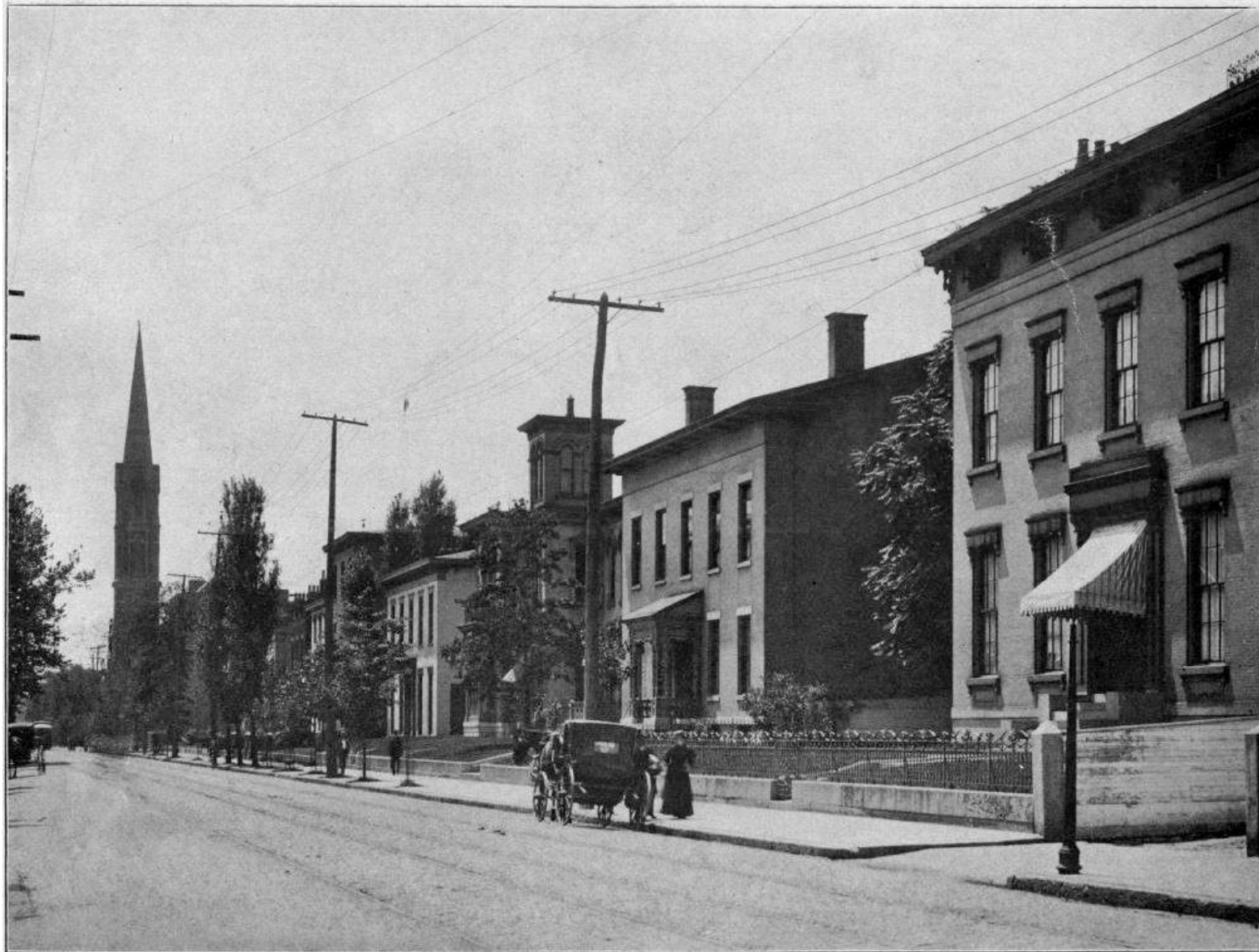
FOURTH AVENUE BETWEEN CHESTNUT STREET AND BROADWAY

Fence with Top Taller than 42" from Sidewalk at Front Property Line Precedent