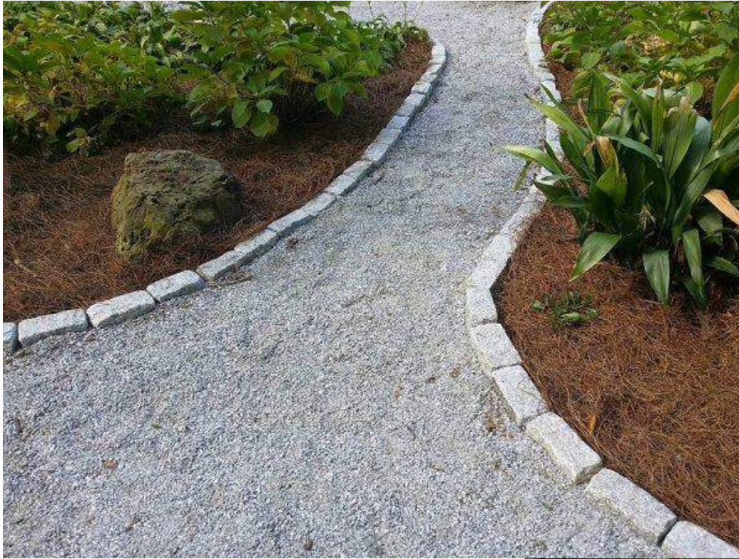
PAVER-EDGED GRAVEL PATH