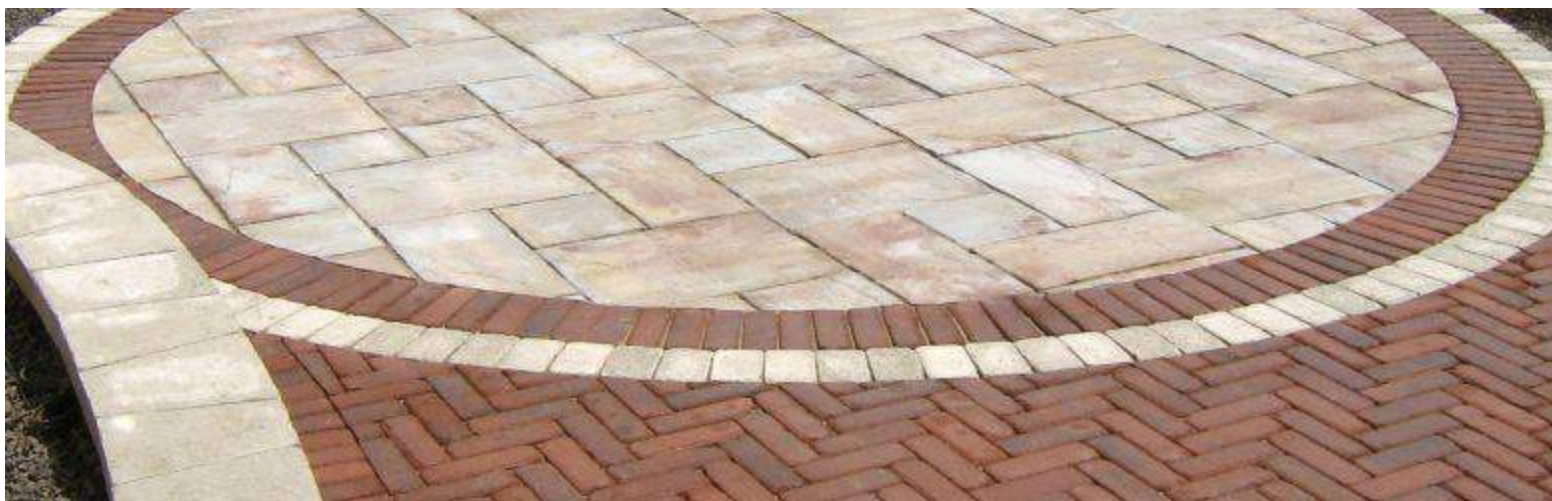
MOTOR COURT STONE INLAY W/ CLAY PAVERS