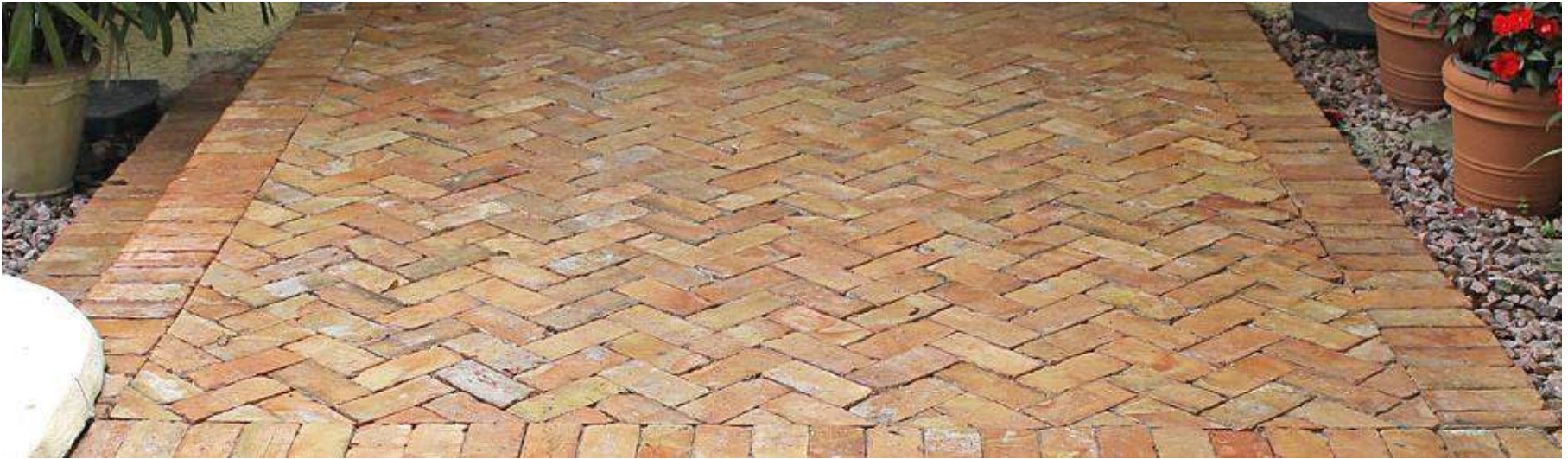
CLAY PAVER PATIOS/WALKWAYS