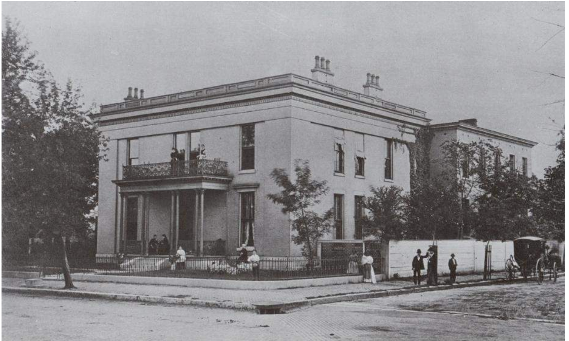
ca. 1845 - Col R.T Durrett home. S.E. corner Brook and Chestnut.

Wall Taller than 6' at property Line Precedent