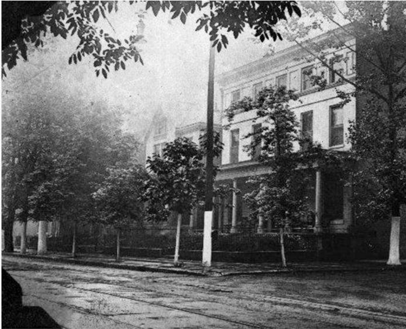
1907 - P.G. Coker's apartment building at 722 W. Chestnut Street

722 W. Chestnut St.- Fence with Top Taller than 42" from Sidewalk at Front Property Line Precedent