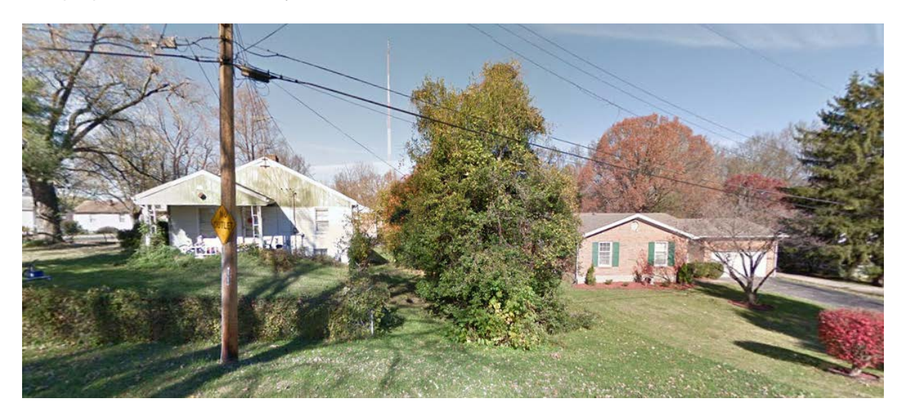
The properties across Eastern Avenue.