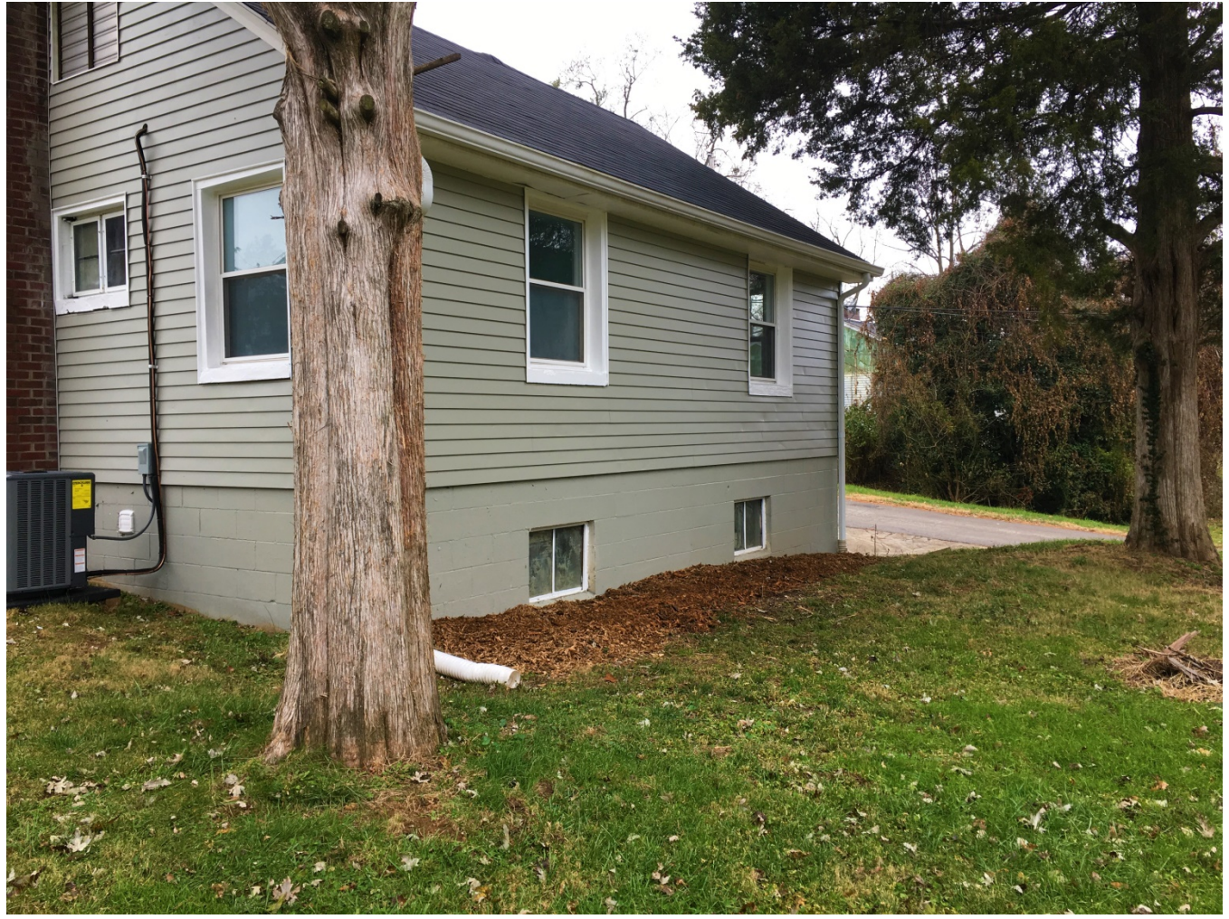
The location of the requested variance.