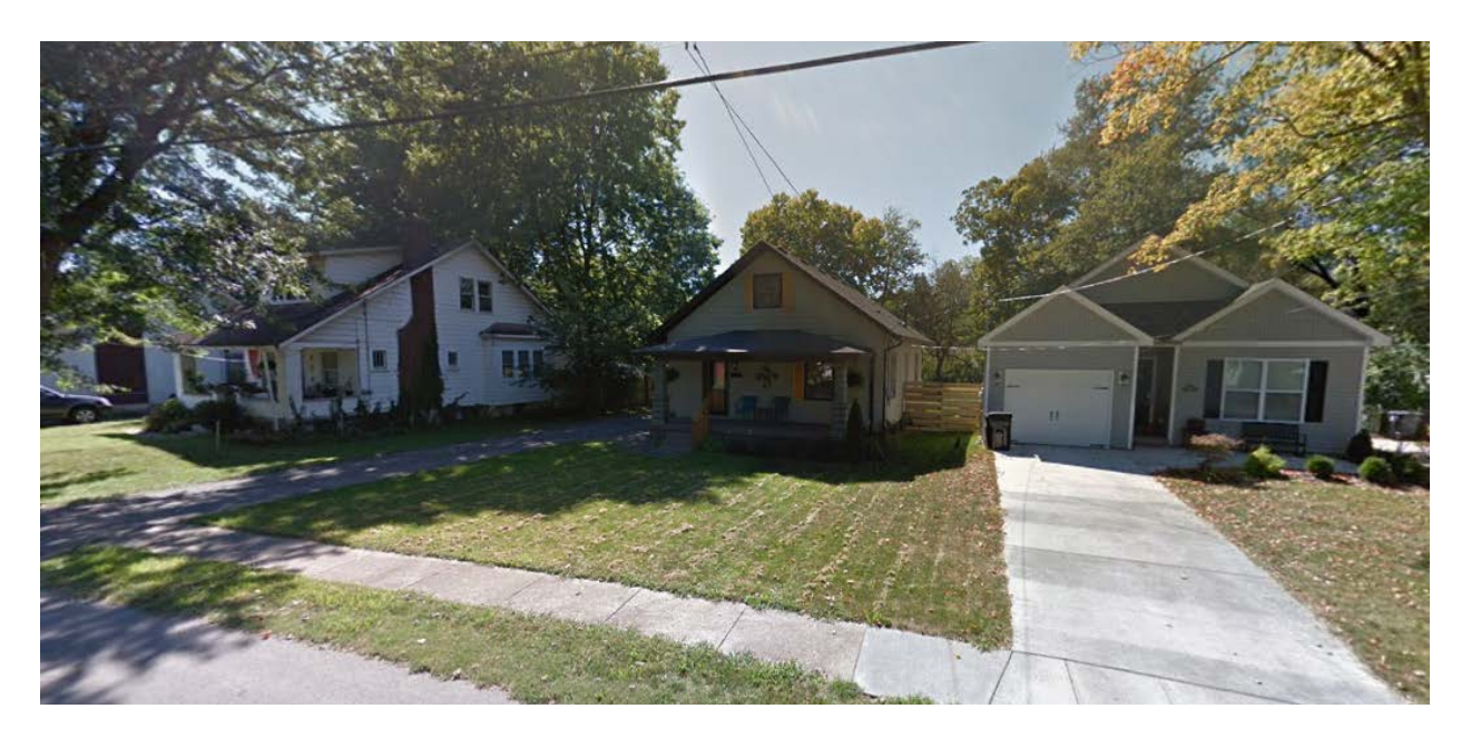
The properties across Country Club Road.