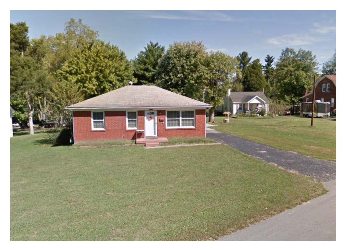
The property to the right of the subject property.