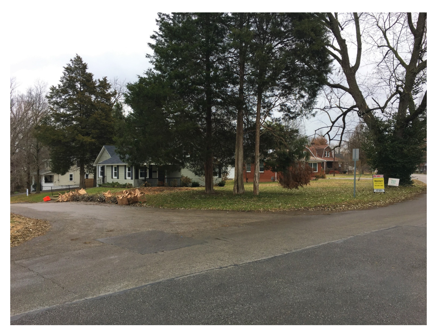
To the left of the subject property (Eastern Avenue).