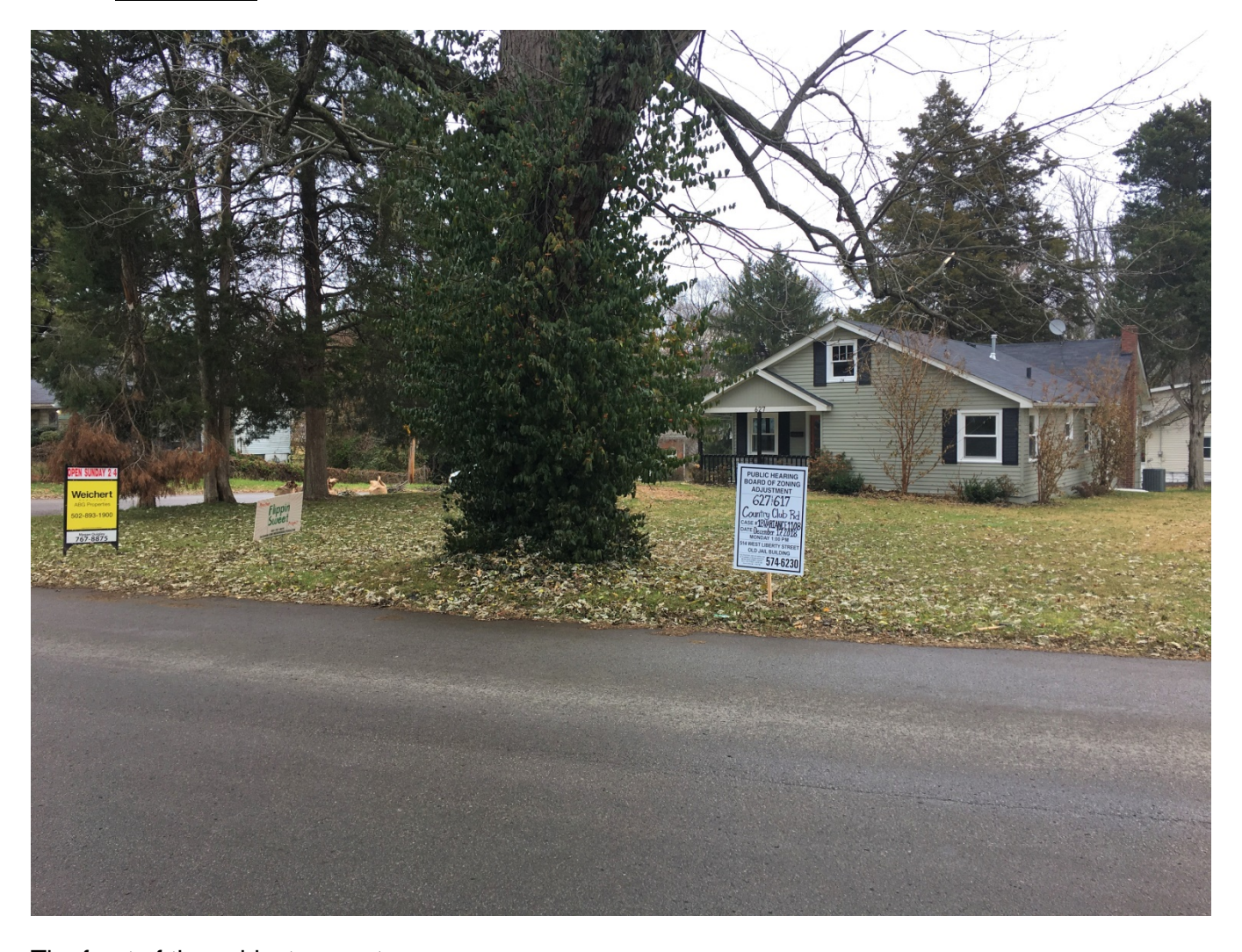
The front of the subject property.