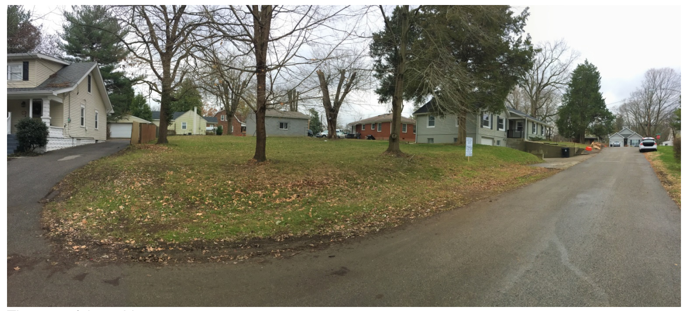
The rear of the subject property.