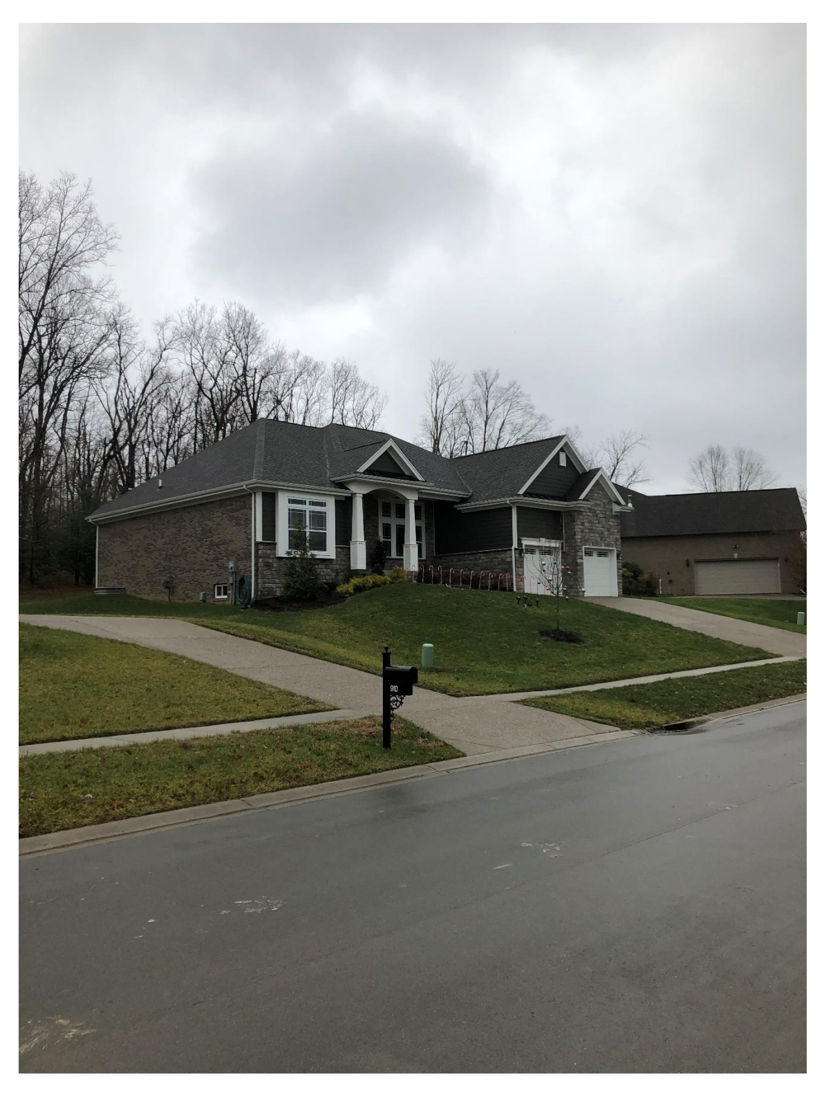
Property to the right of subject property.