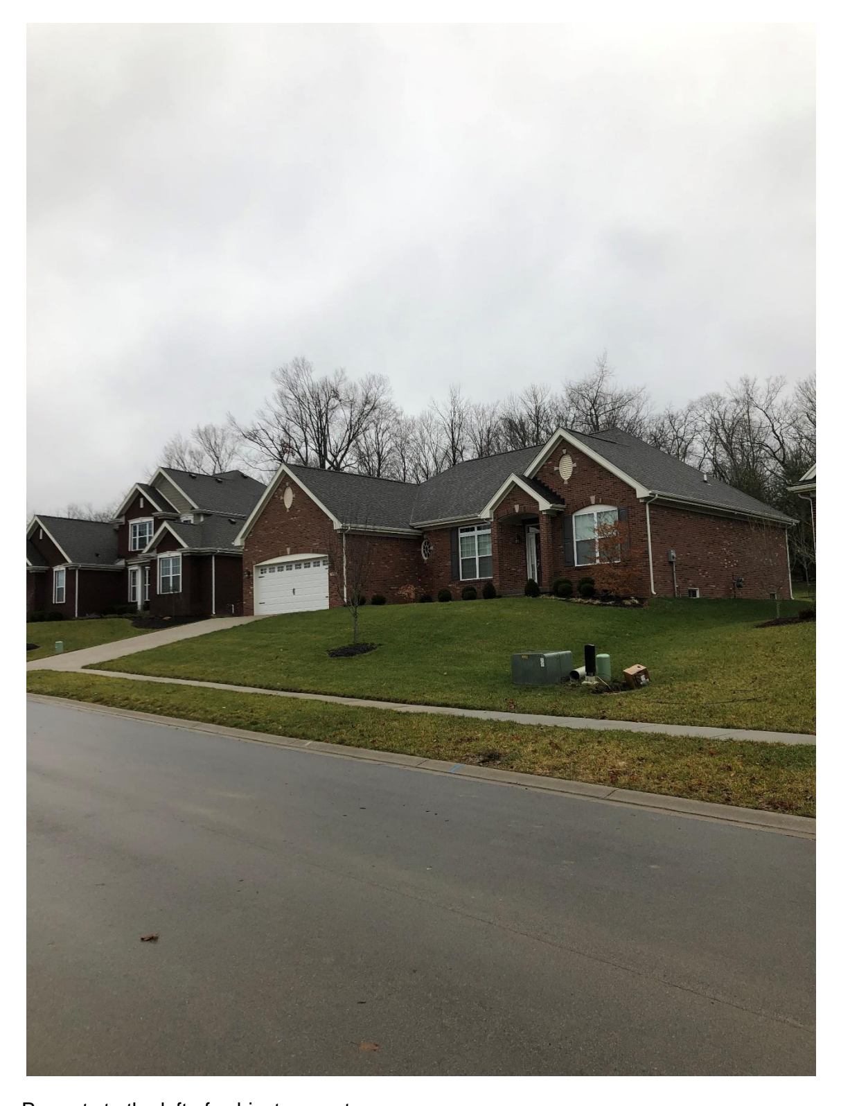
Property to the left of subject property.