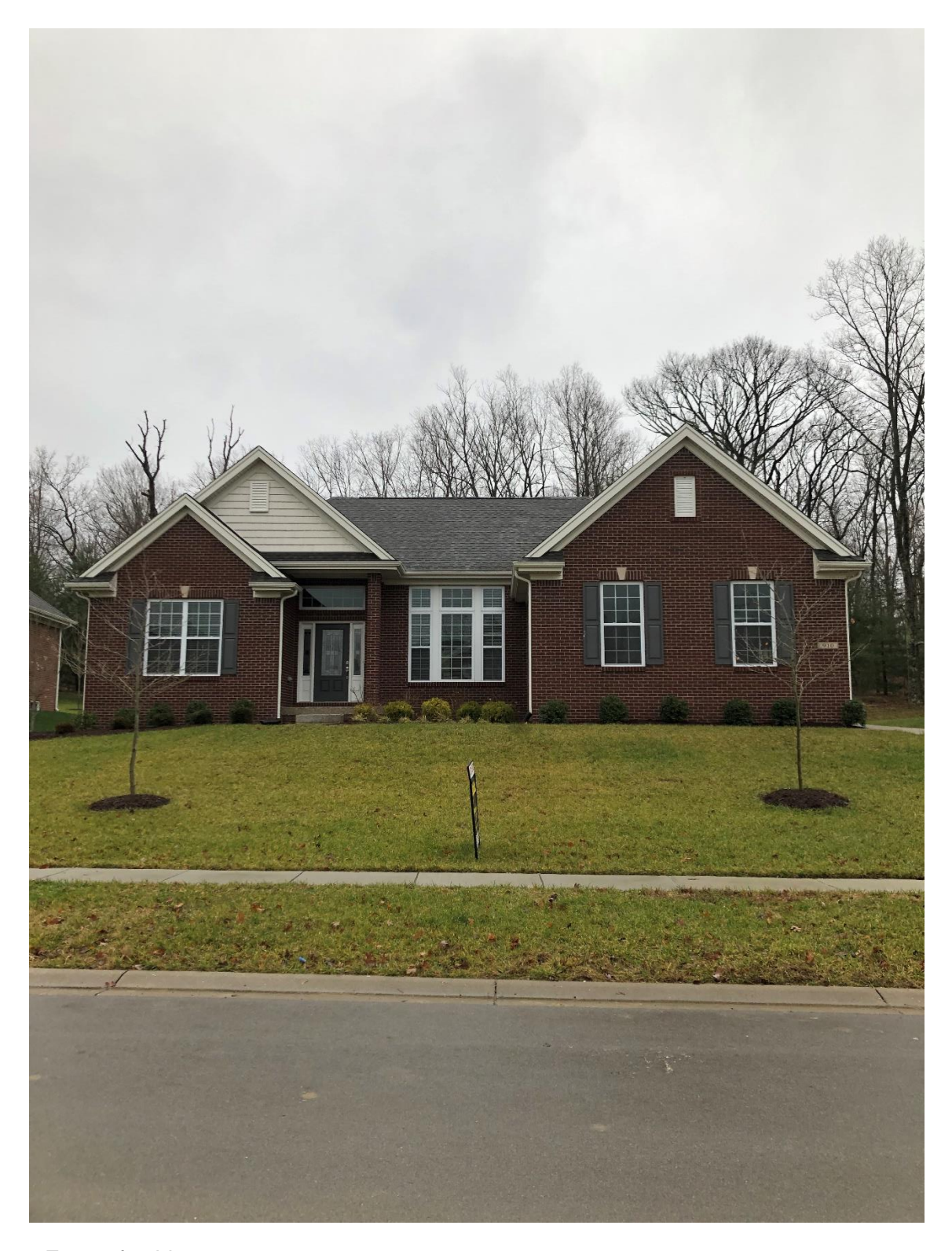
Front of subject property.