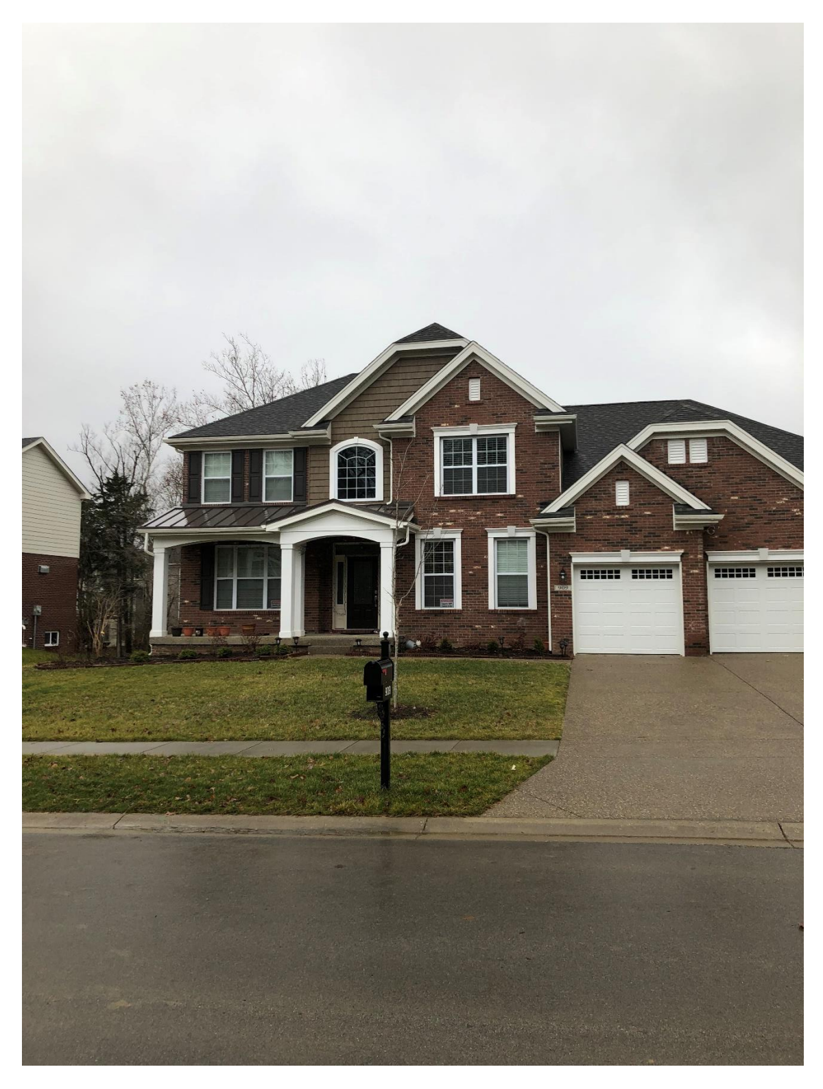
Property across Malone Place.