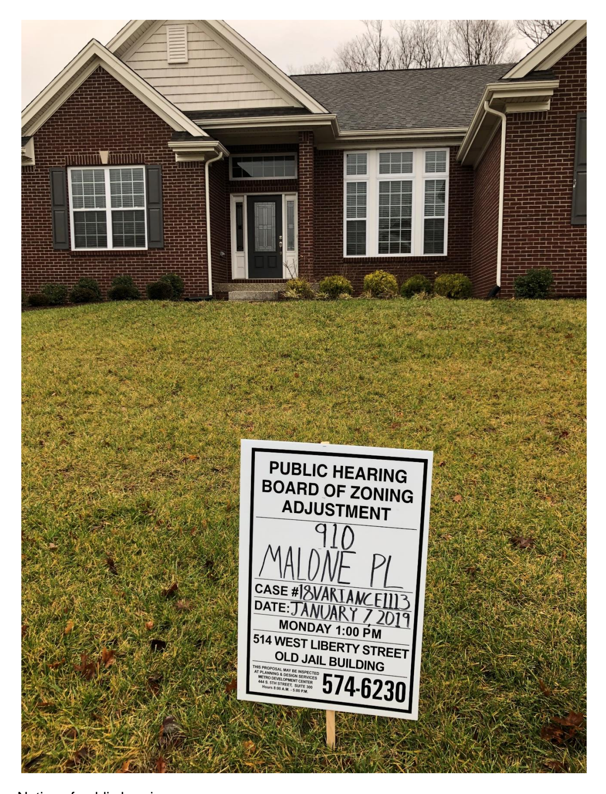
Notice of public hearing.