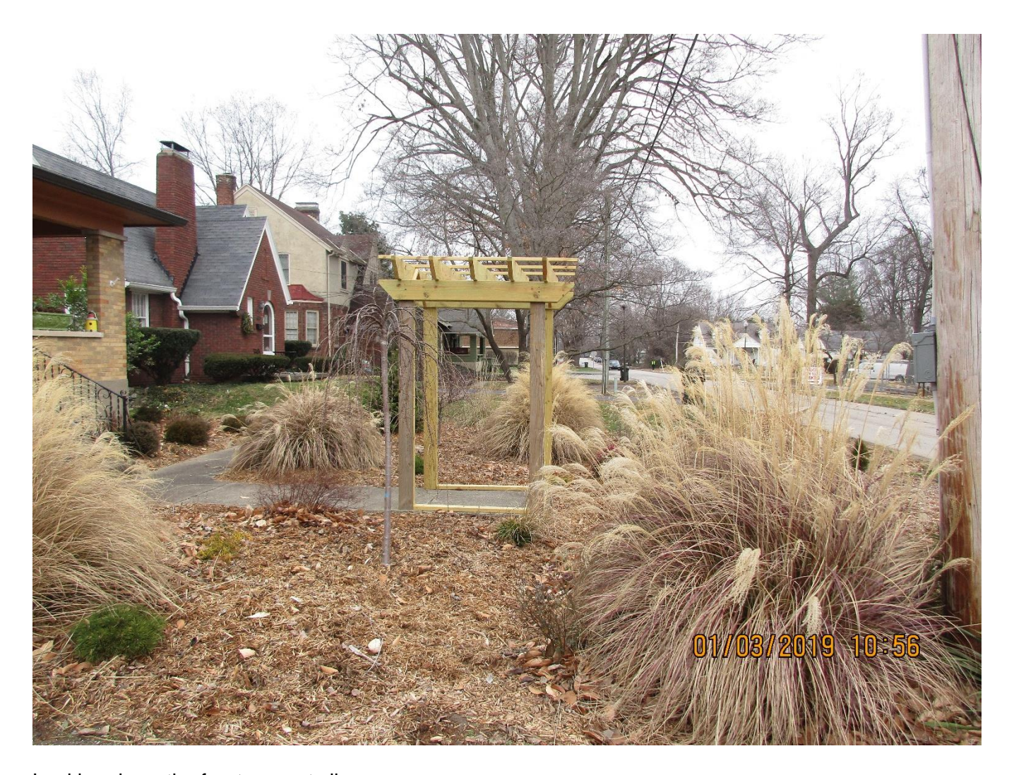
Looking down the front property line.