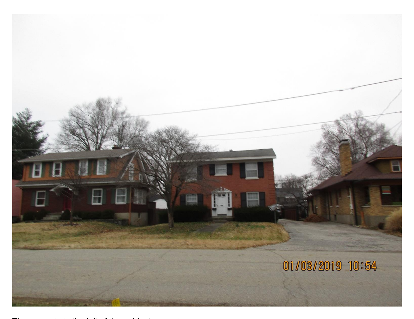
The property to the left of the subject property.