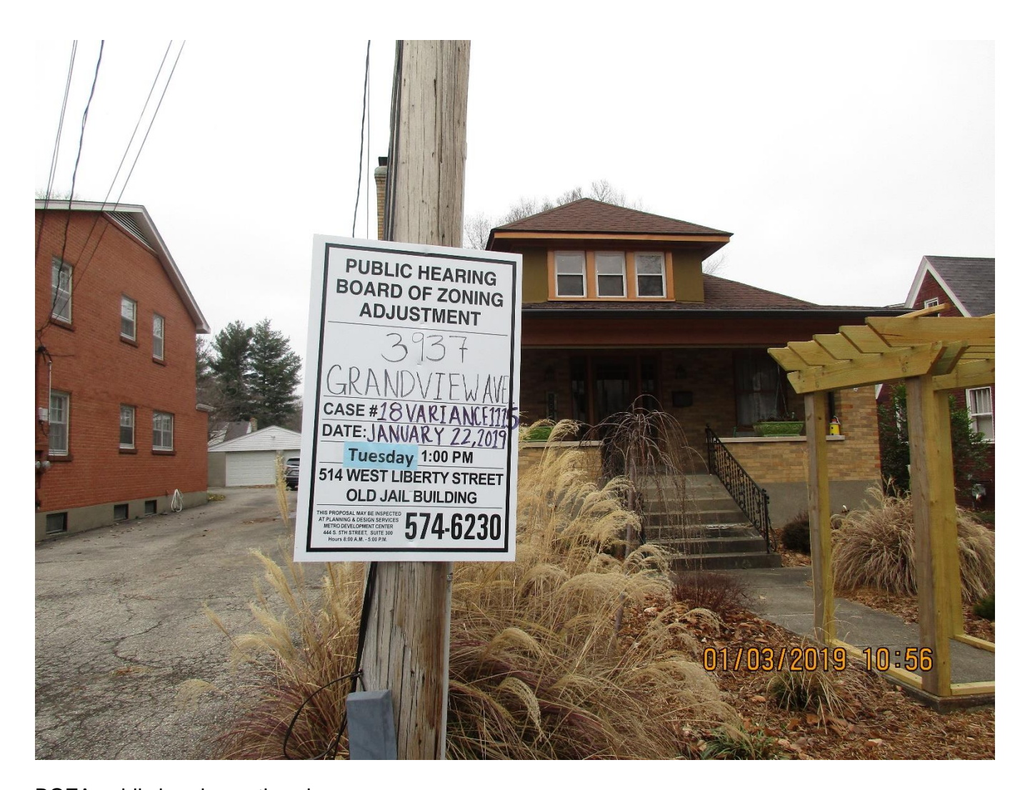
BOZA public hearing notice sign.