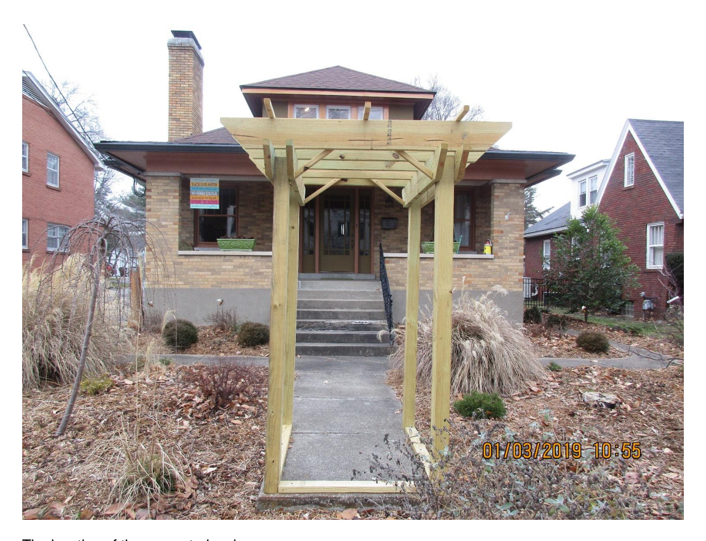
The location of the requested variance.