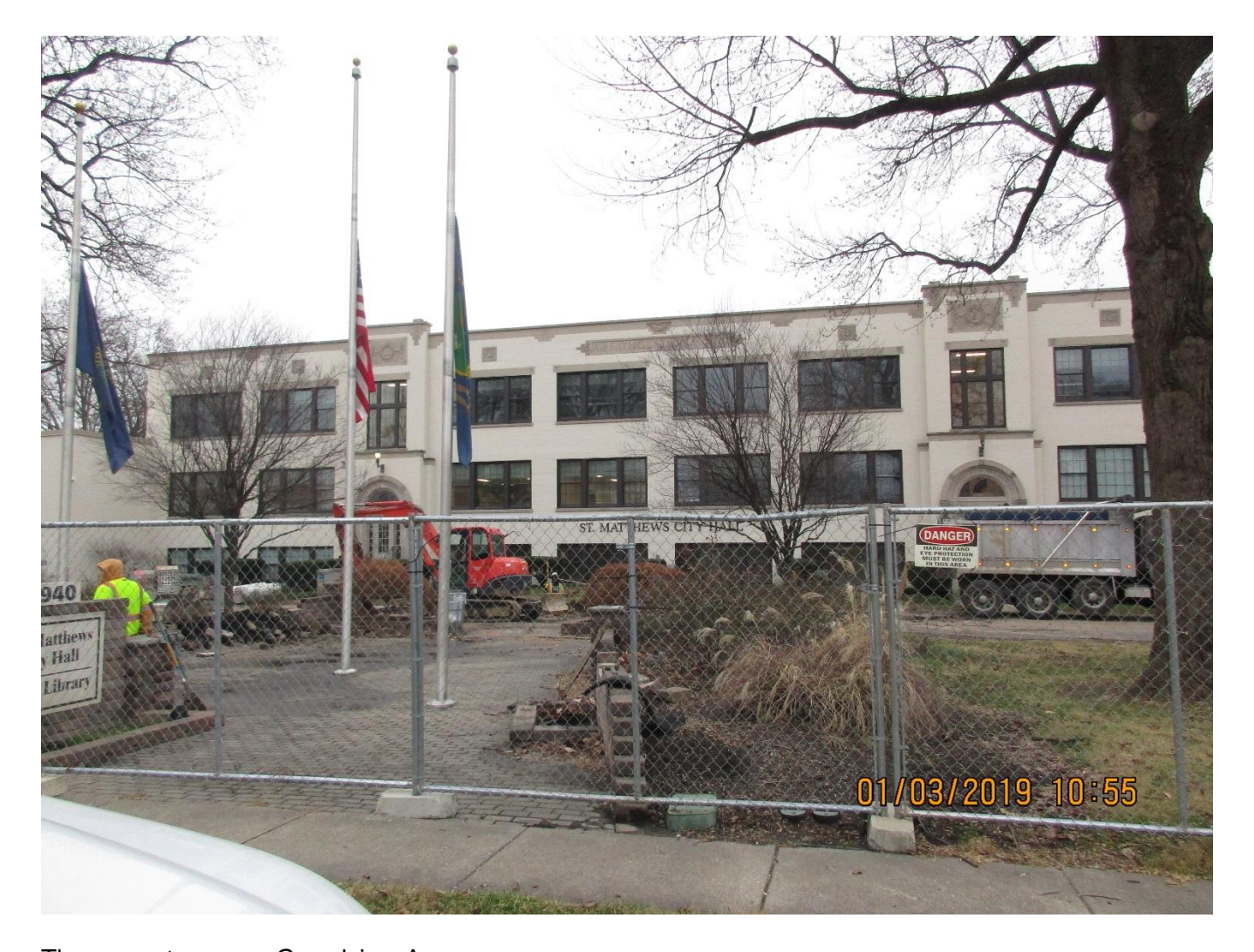
The property across Grandview Avenue.