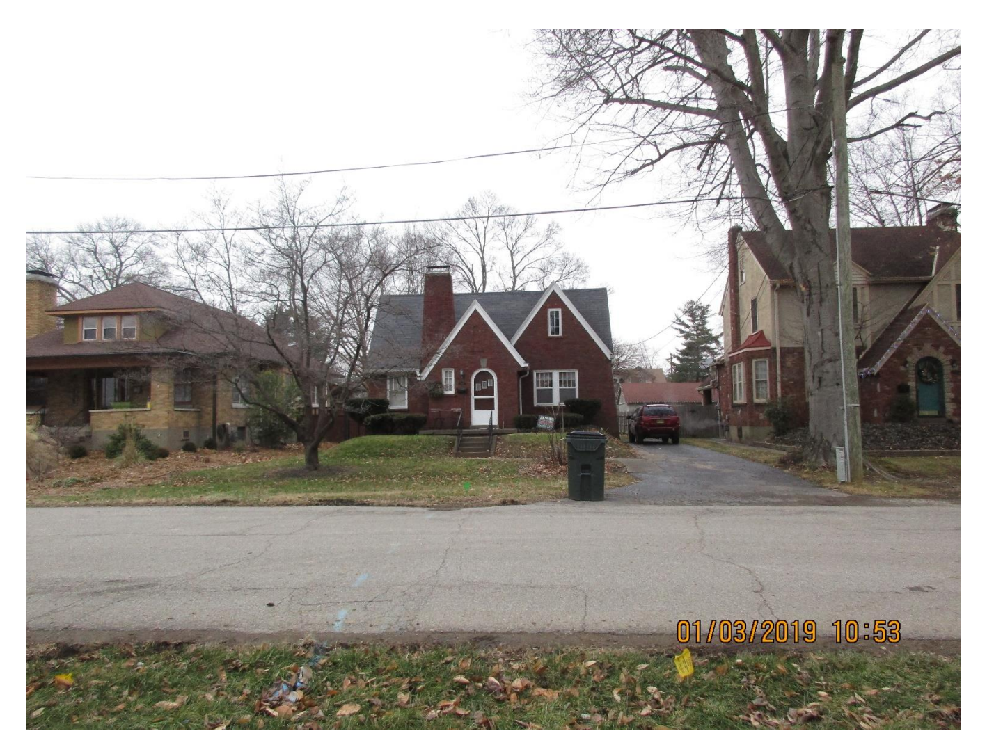
The property to the right of the subject property.