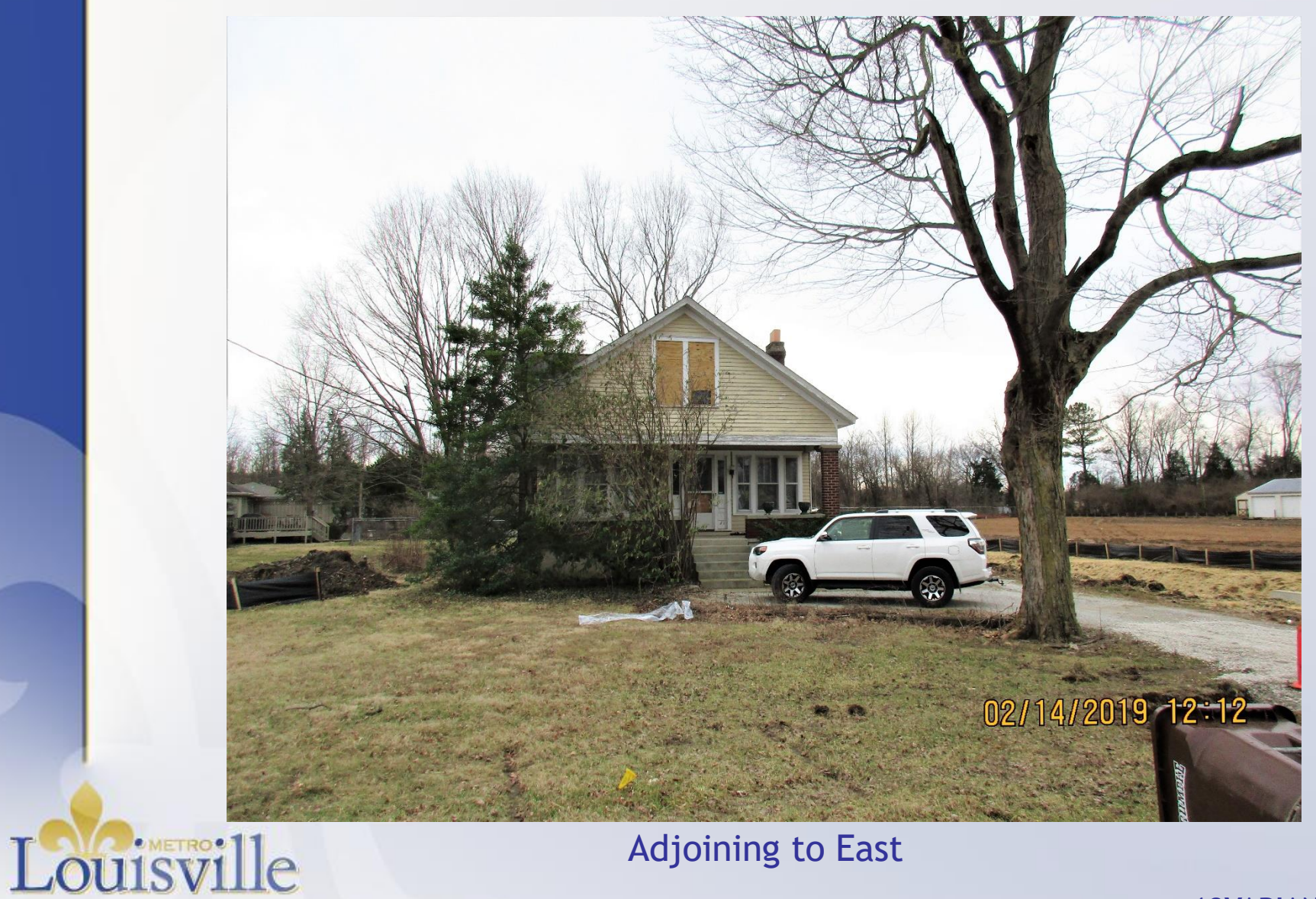
Adjoining to East