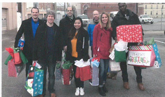
Volunteers from Humana delivered gifts this holiday season to home-bound and socially isolated clients through our Elf to an Elder program.