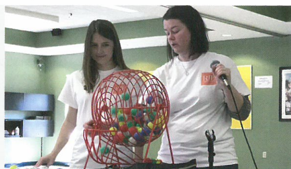
RJE Solutions volunteers spent the day at our Senior Center in West Louisville calling bingo and enjoying time with the participants.