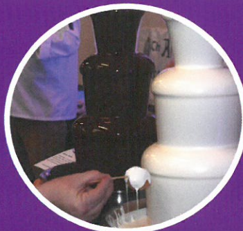
Guests sampled chocolate creations from over 20 local restaurants at the 13th annual Chocolate Dreams.