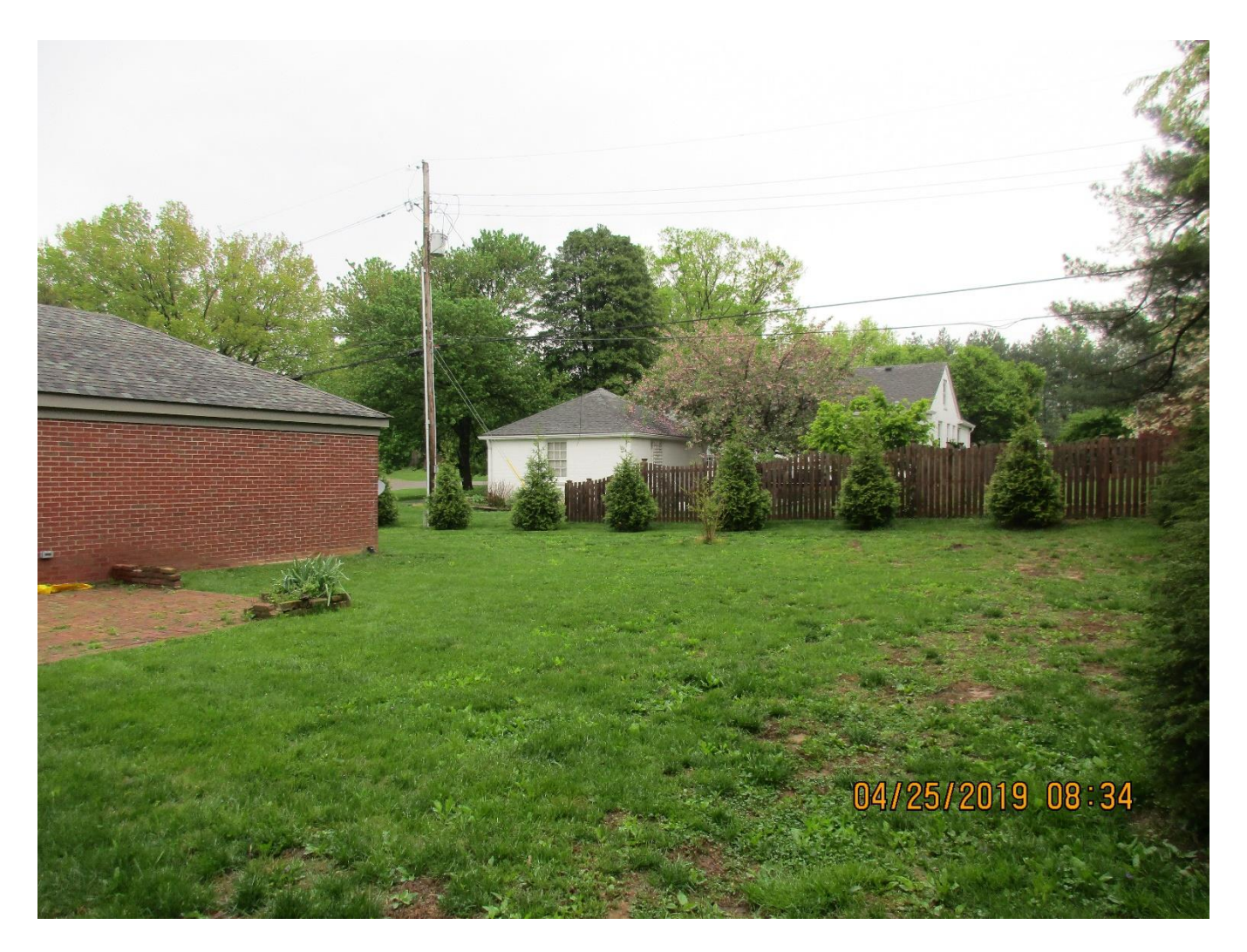
Variance area from the rear of the residence.