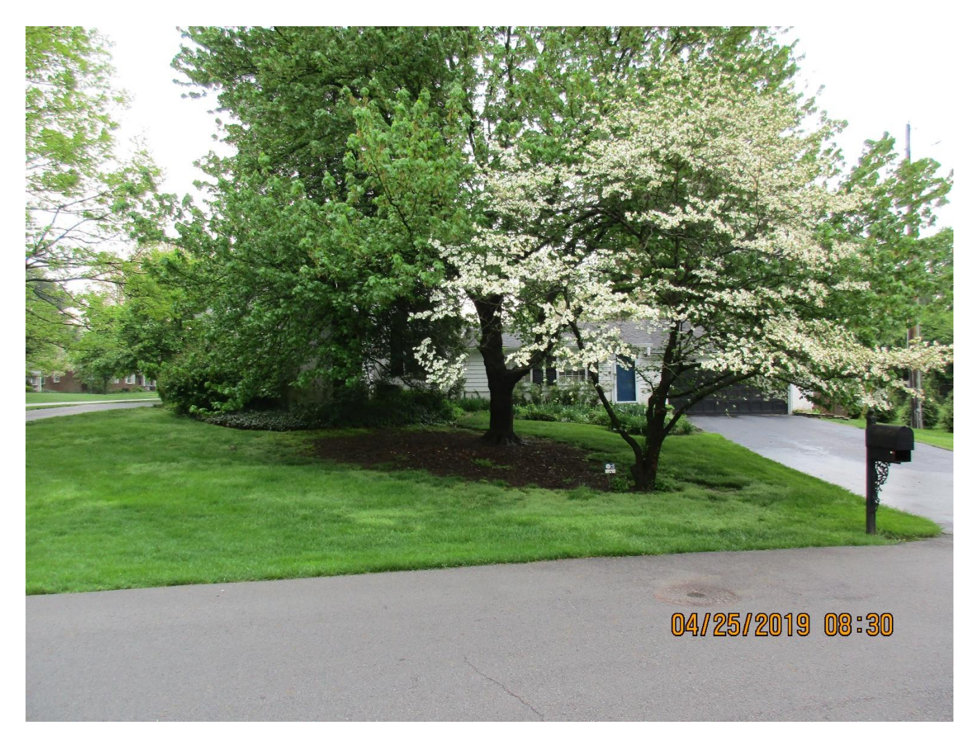
Property to the left.