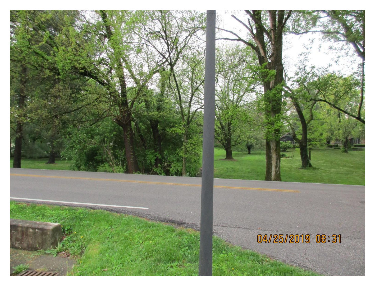
Property across Rudy Lane.