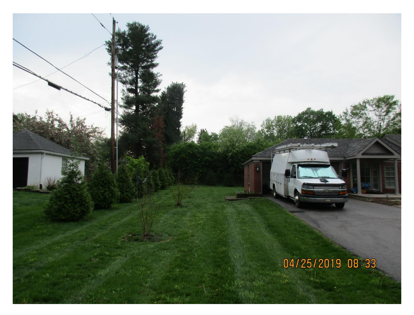
Variance area from Merrifield Road.