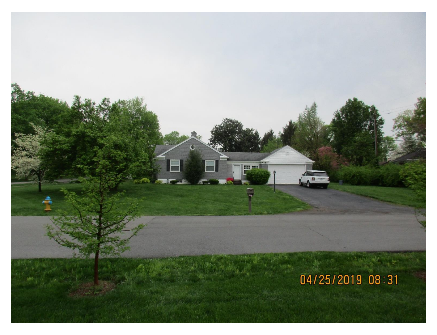
Property across Merrifield Road.