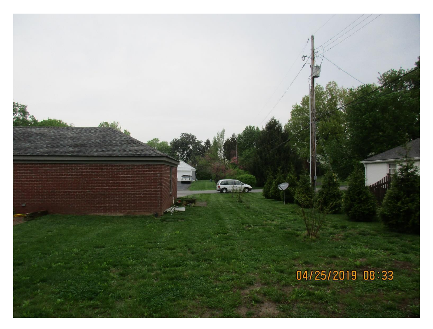
Variance area looking toward Merrifield Road.