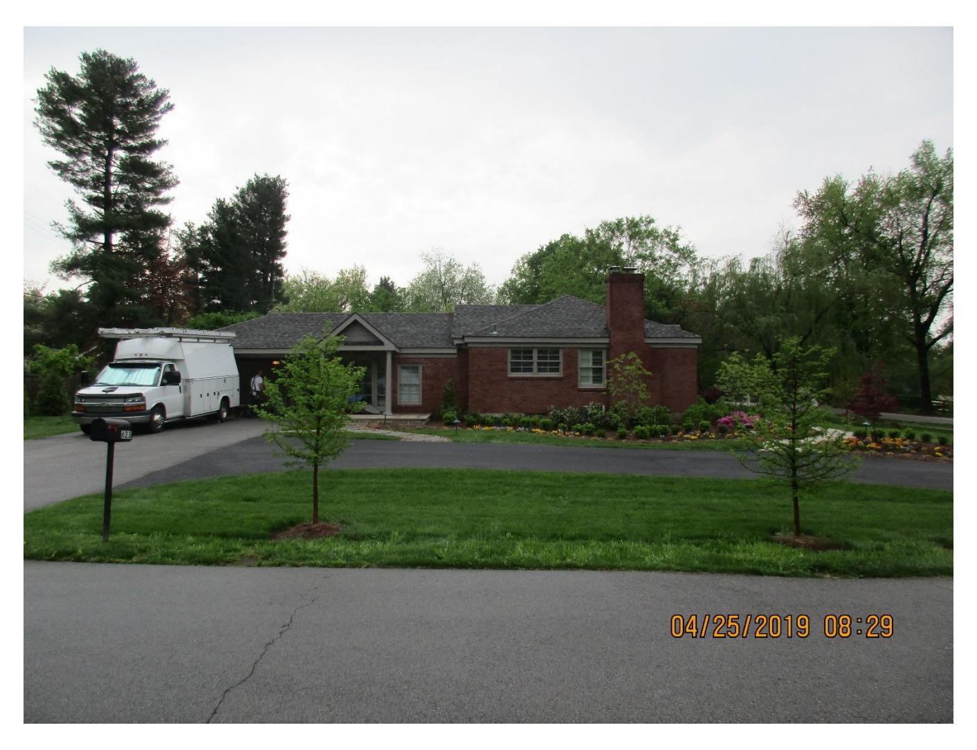
Front of the subject property.