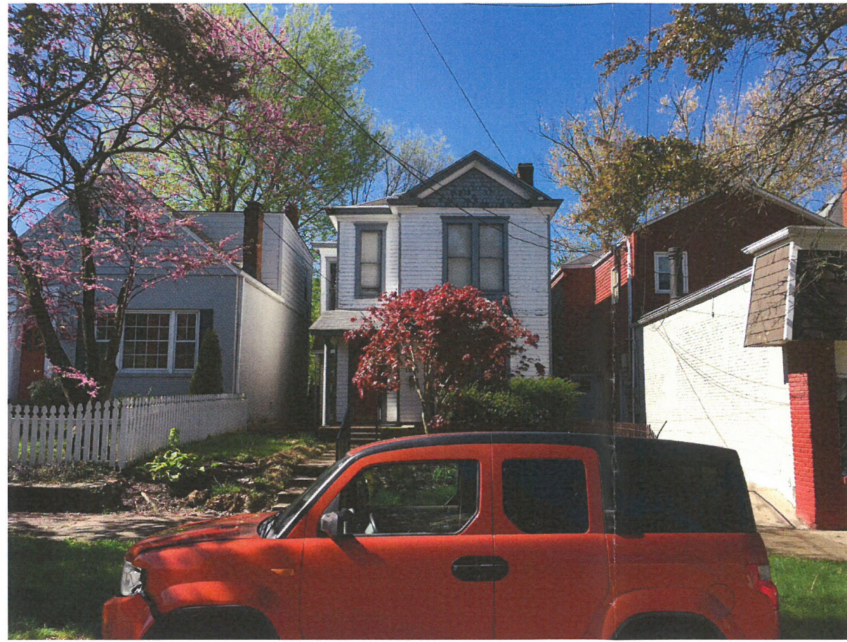
1836 FRANKFORT AVENUE