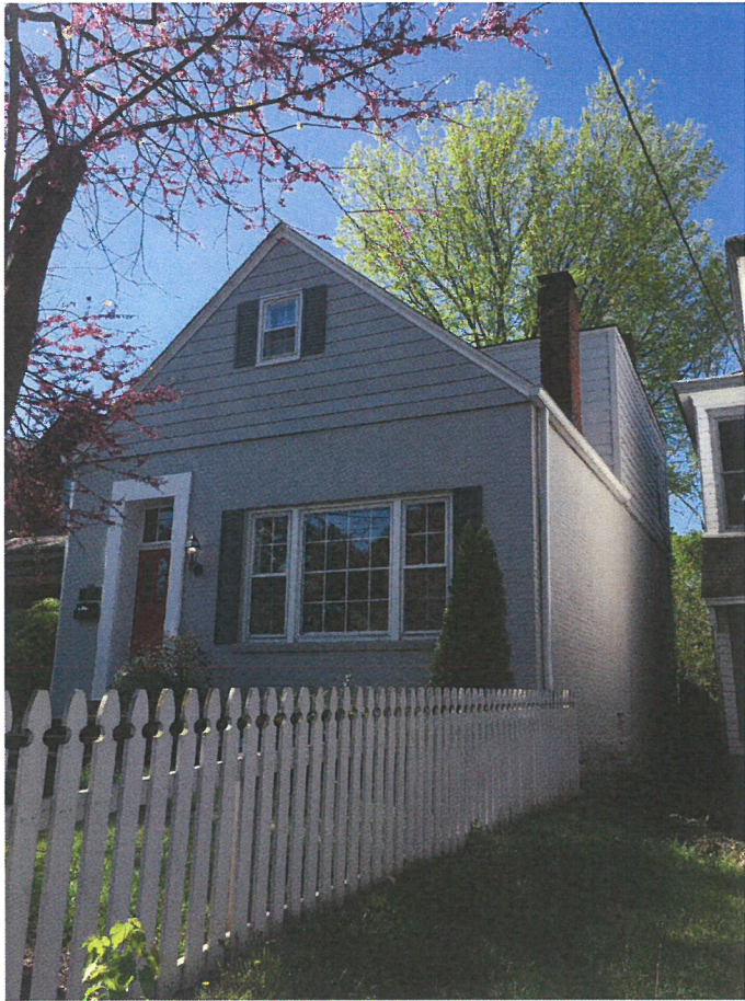
1838 FRANKFORT AVENUE