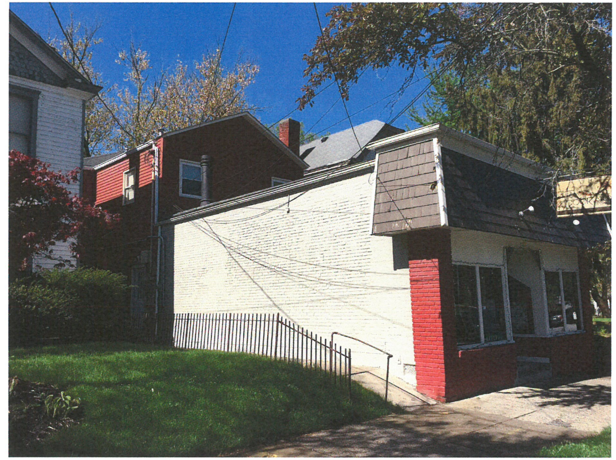
1832 FRANKFORT AVENUE