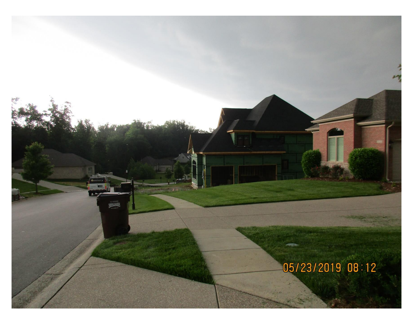
Looking west showing the front yard setback.