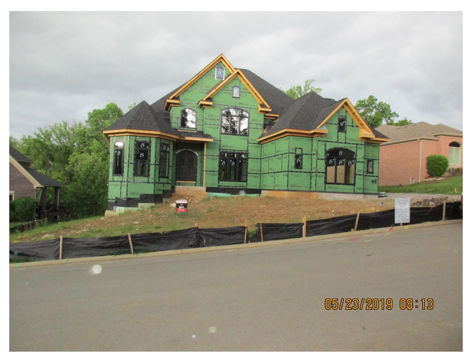
Front of the subject property.