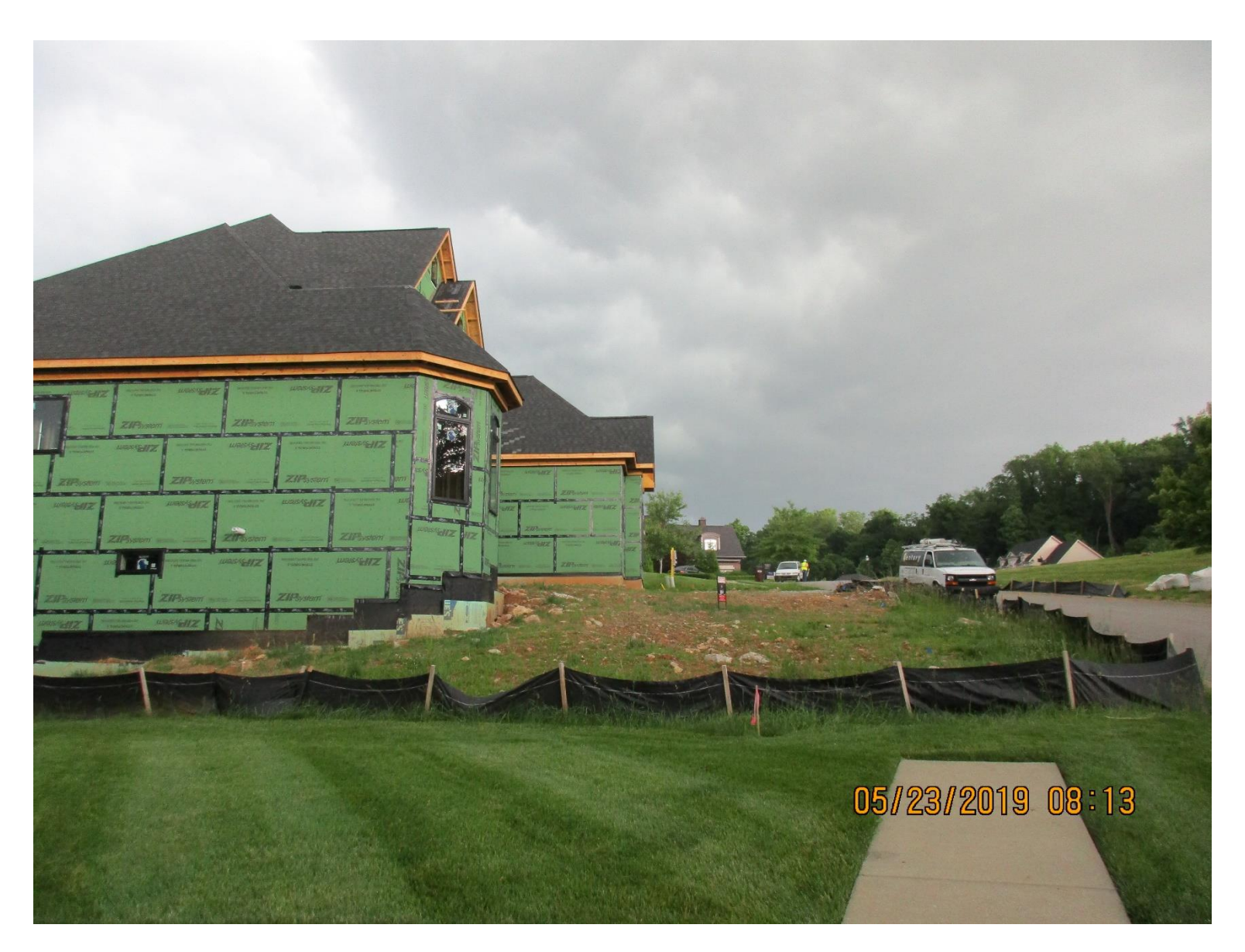
Looking east showing the front yard setback.