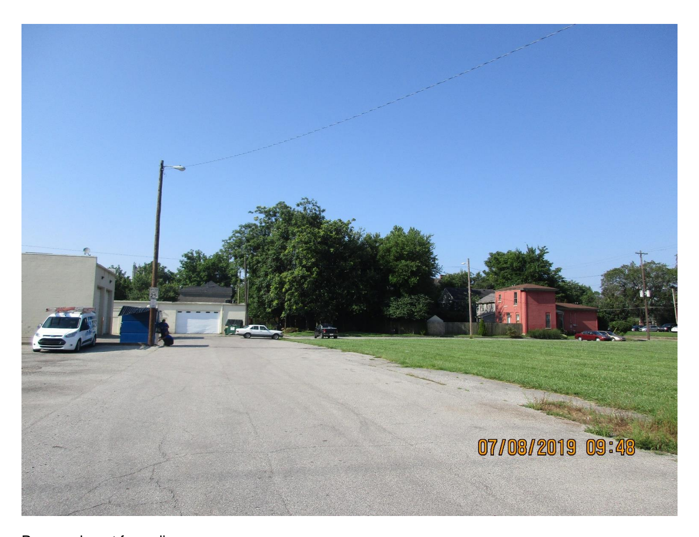
Proposed west fence line.