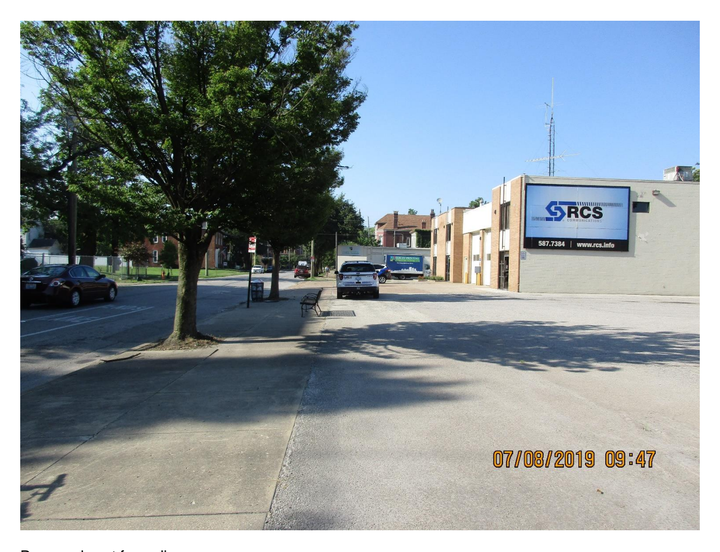
Proposed east fence line.