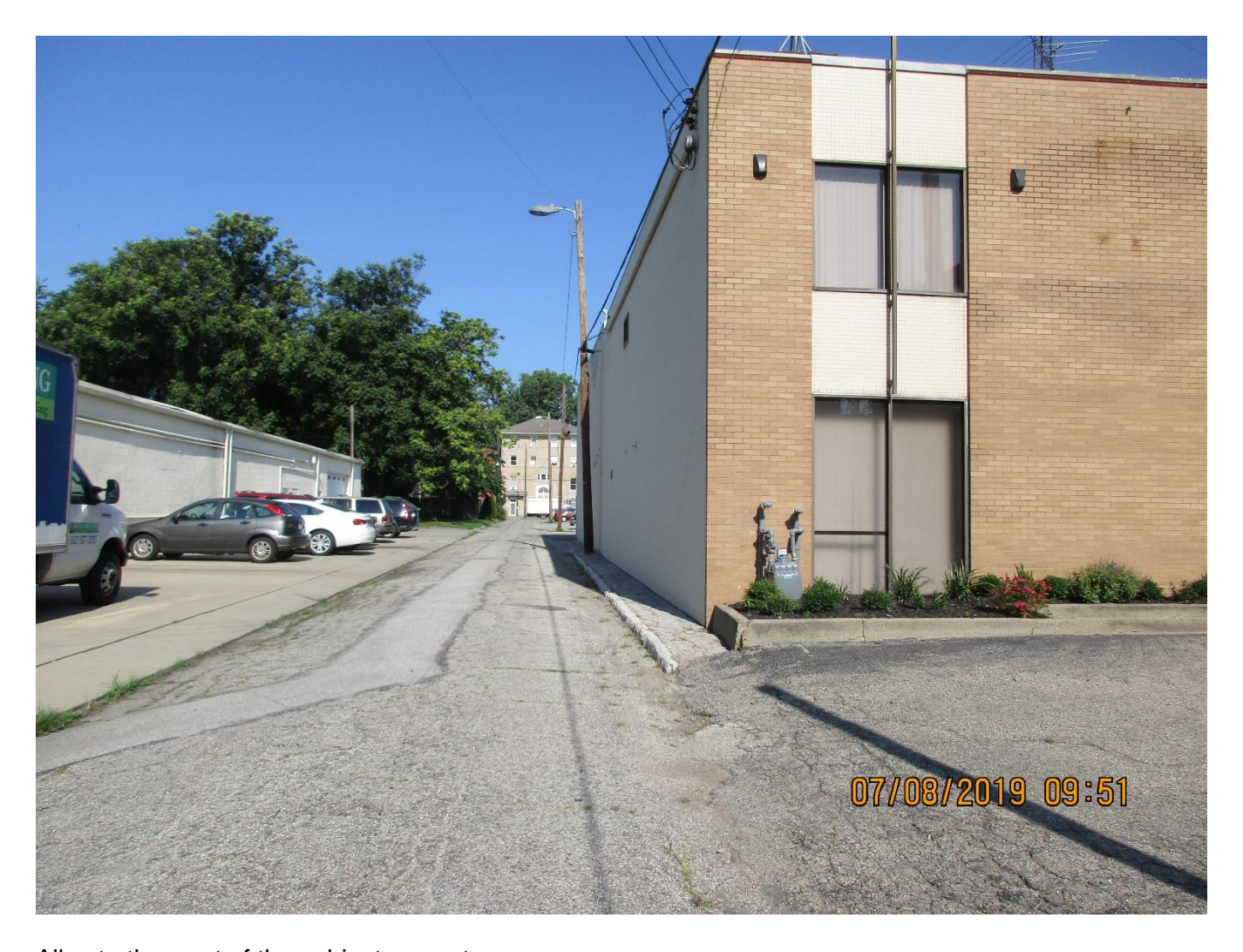
Alley to the west of the subject property.