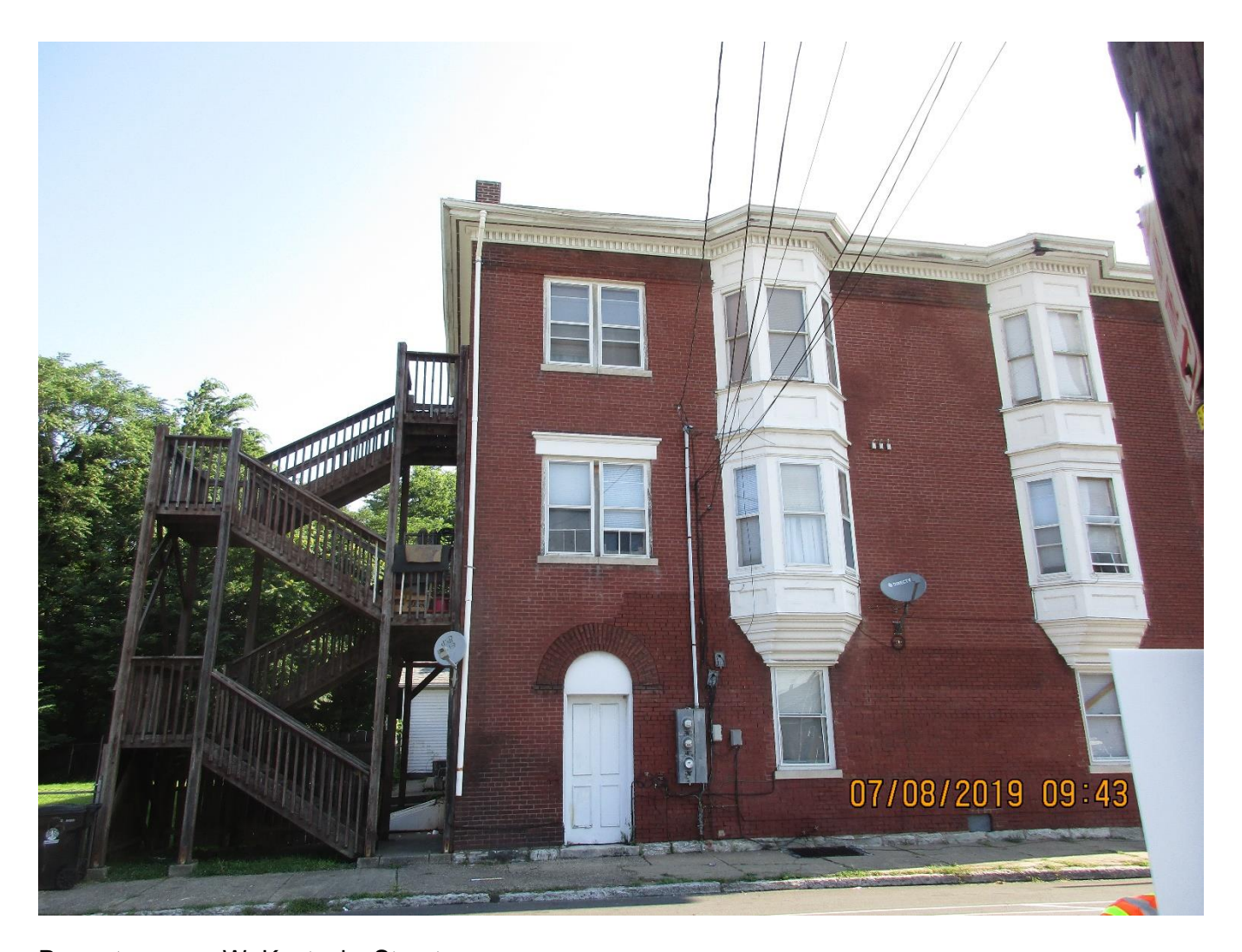
Property across W. Kentucky Street.