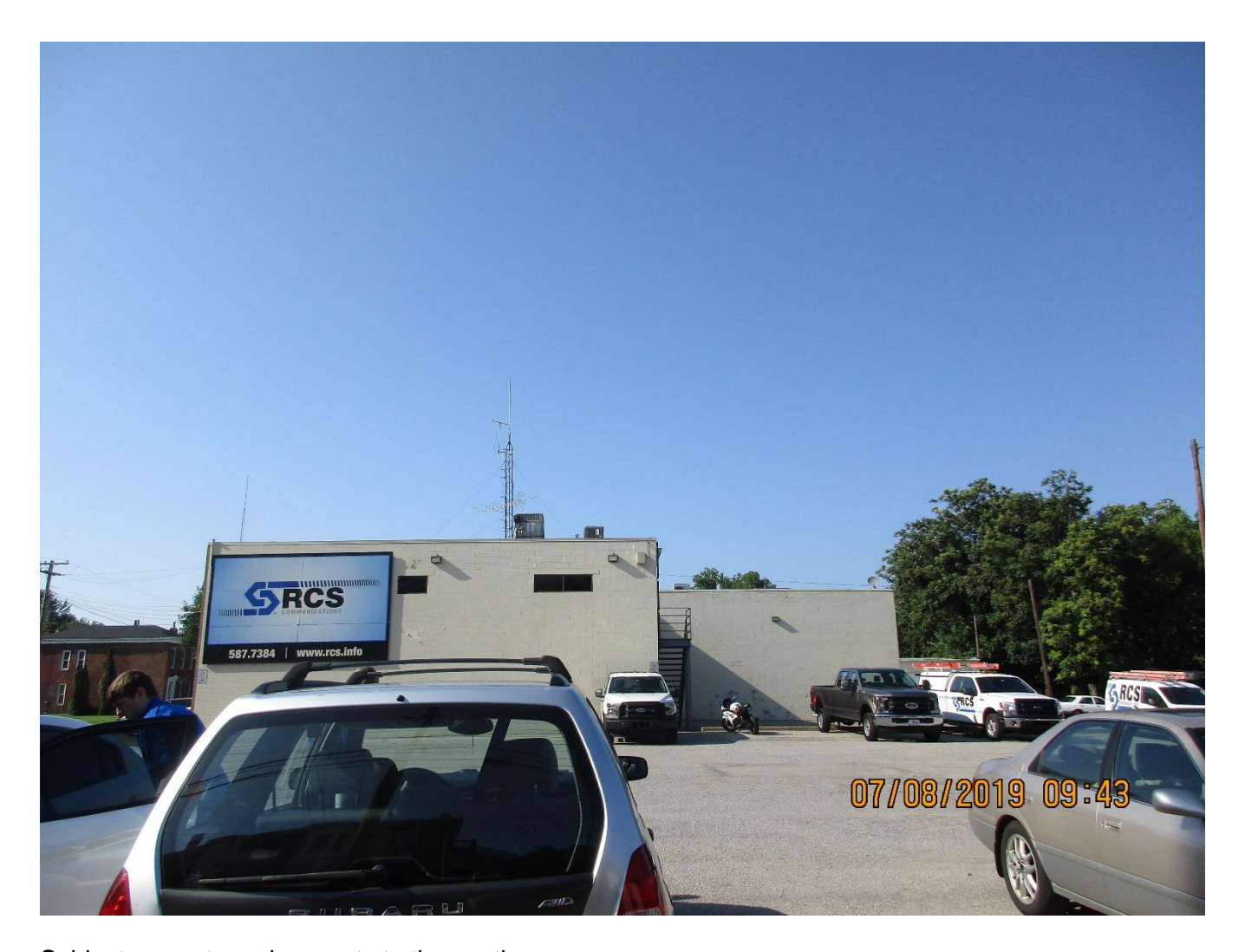
Subject property and property to the south.