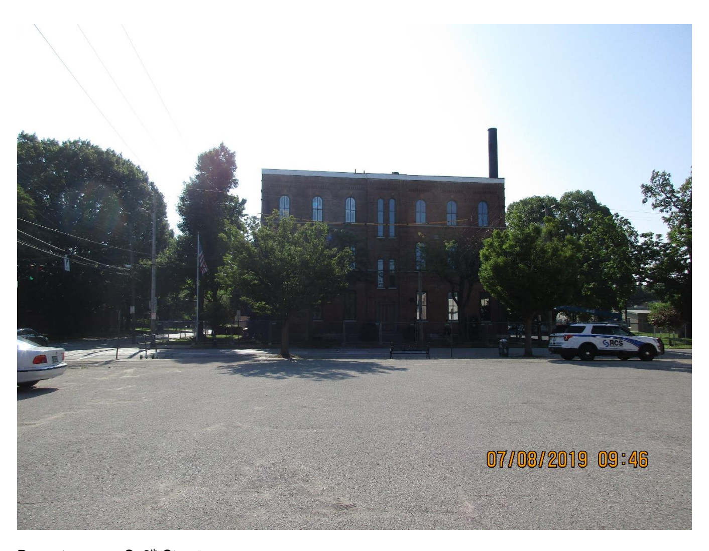
Property across S. 6<sup>th</sup> Street.