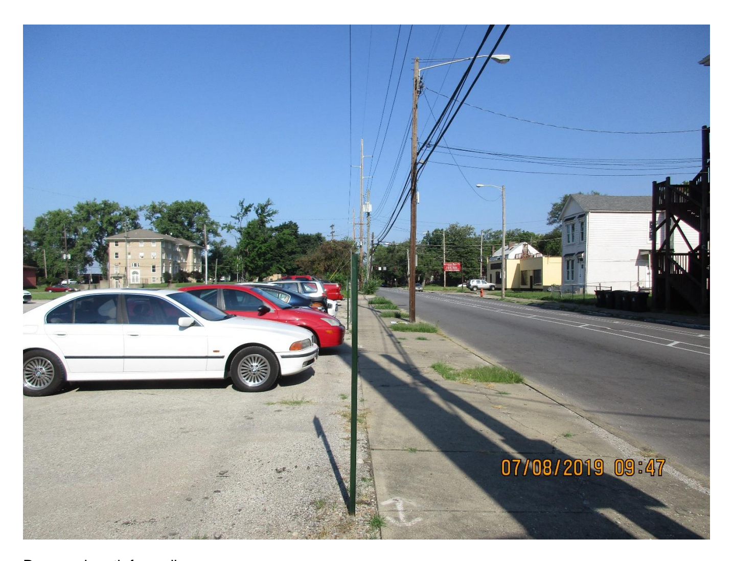
Proposed north fence line.