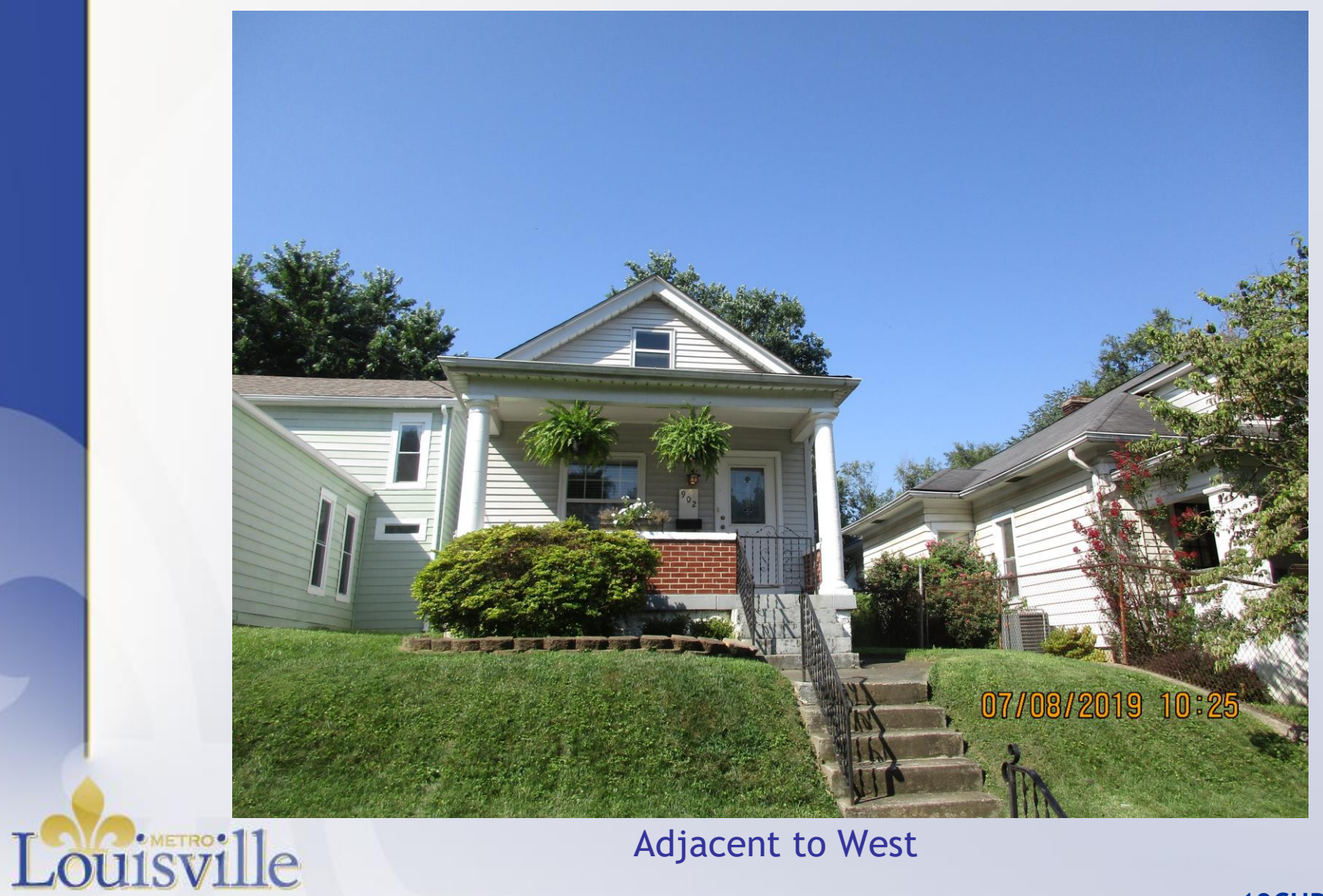
Adjacent to West