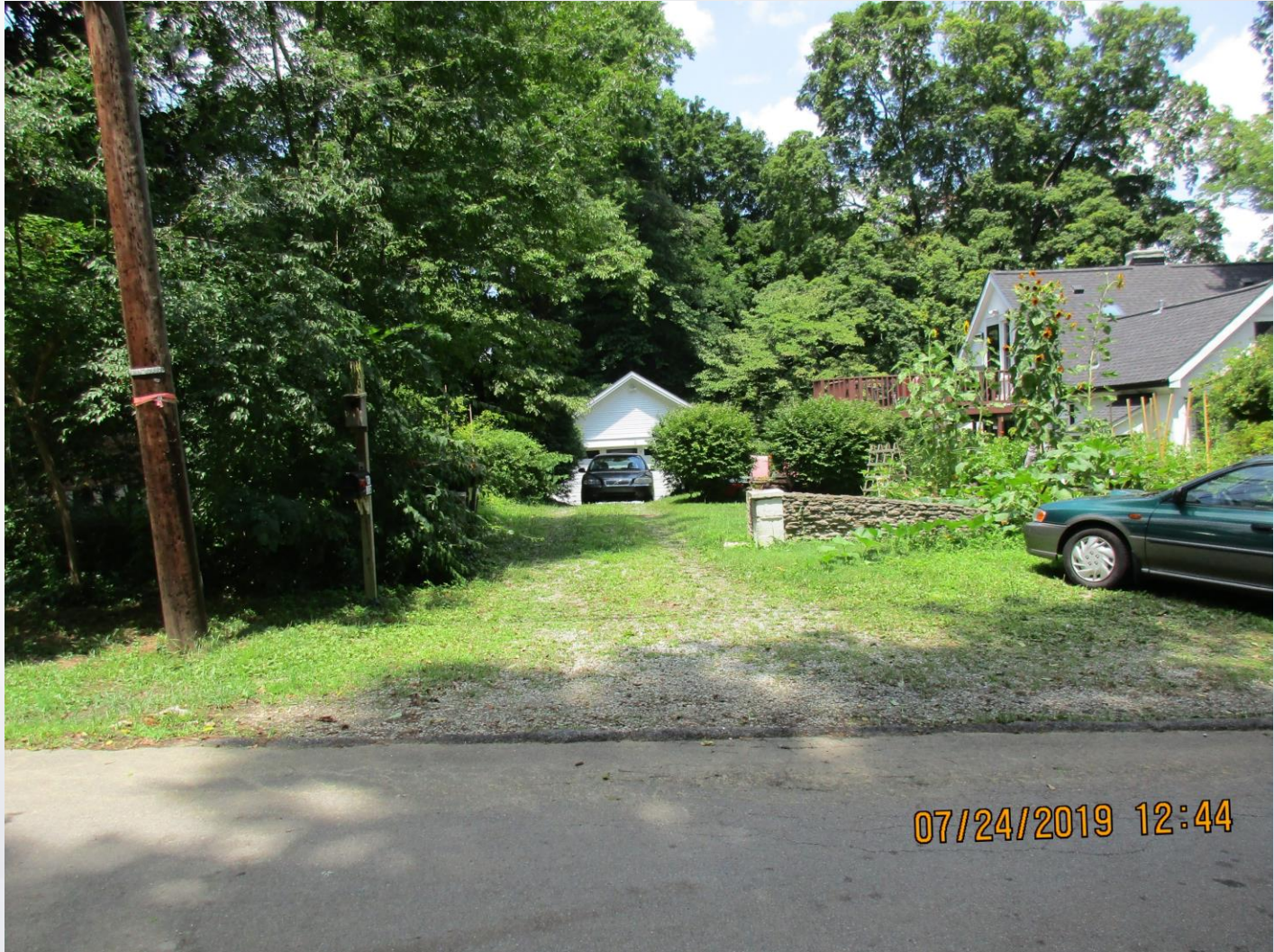
Driveway from Hawthorne