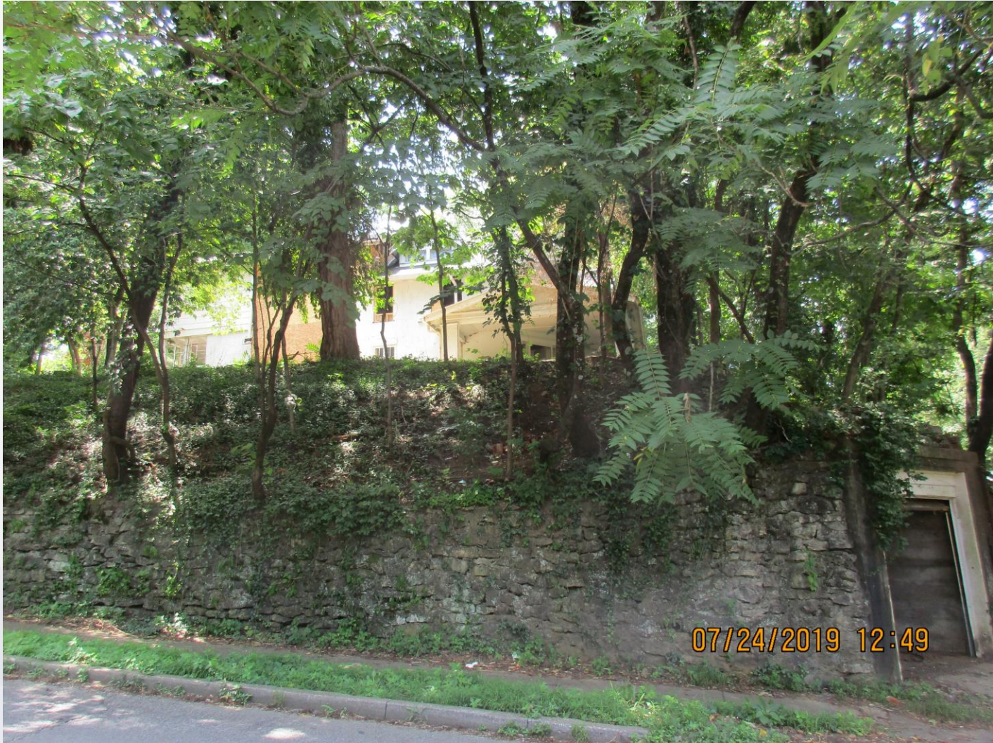
Adjacent to South