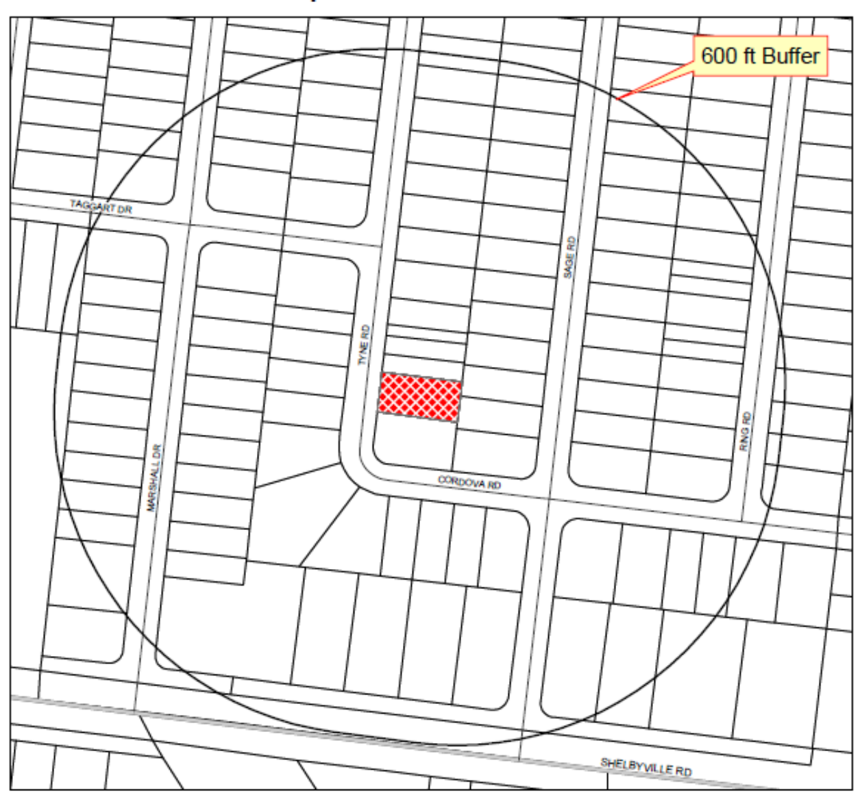
Map Created: 08/23/2019