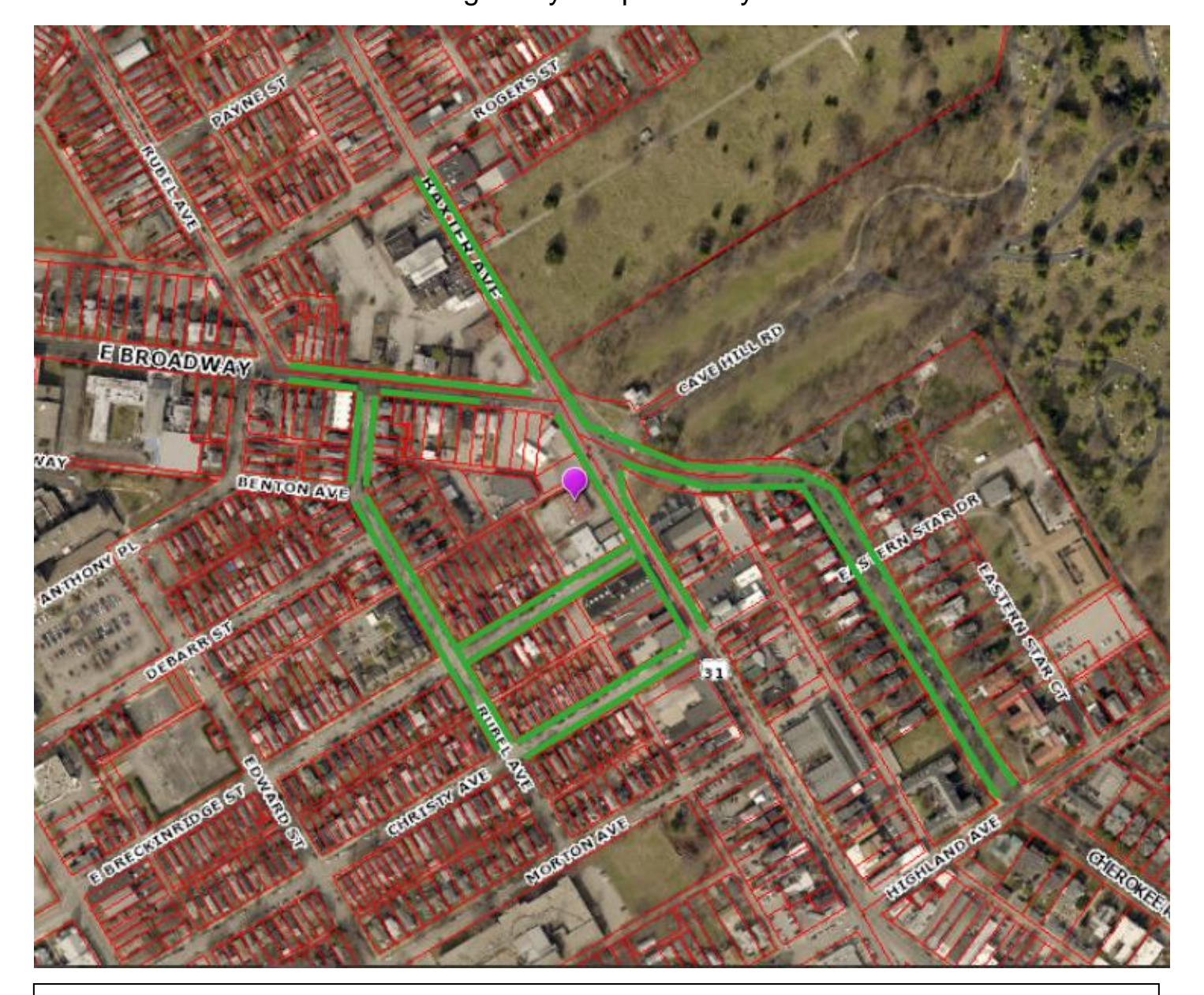
Figure 1. Aerial view of study parameters. Available on street parking spaces were counted on the streets outlined in green. The streets included in this study are within 1000 feet of 800 Baxter Ave. (1) Baxter Ave (Christy Ave to Rogers St); (2) Cherokee Rd (Highland Ave to Broadway); (3) Broadway (Baxter Ave to Rubel St); (4) Rubel St (Broadway to Christy Ave); (5) Christy Ave (Baxter to Rubel); (6) Breckenridge St (Baxter to Rubel).