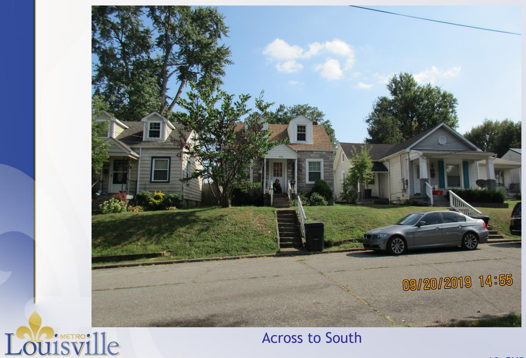
Across to South