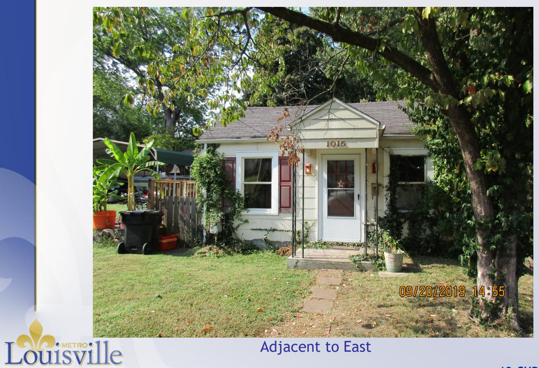
Adjacent to East