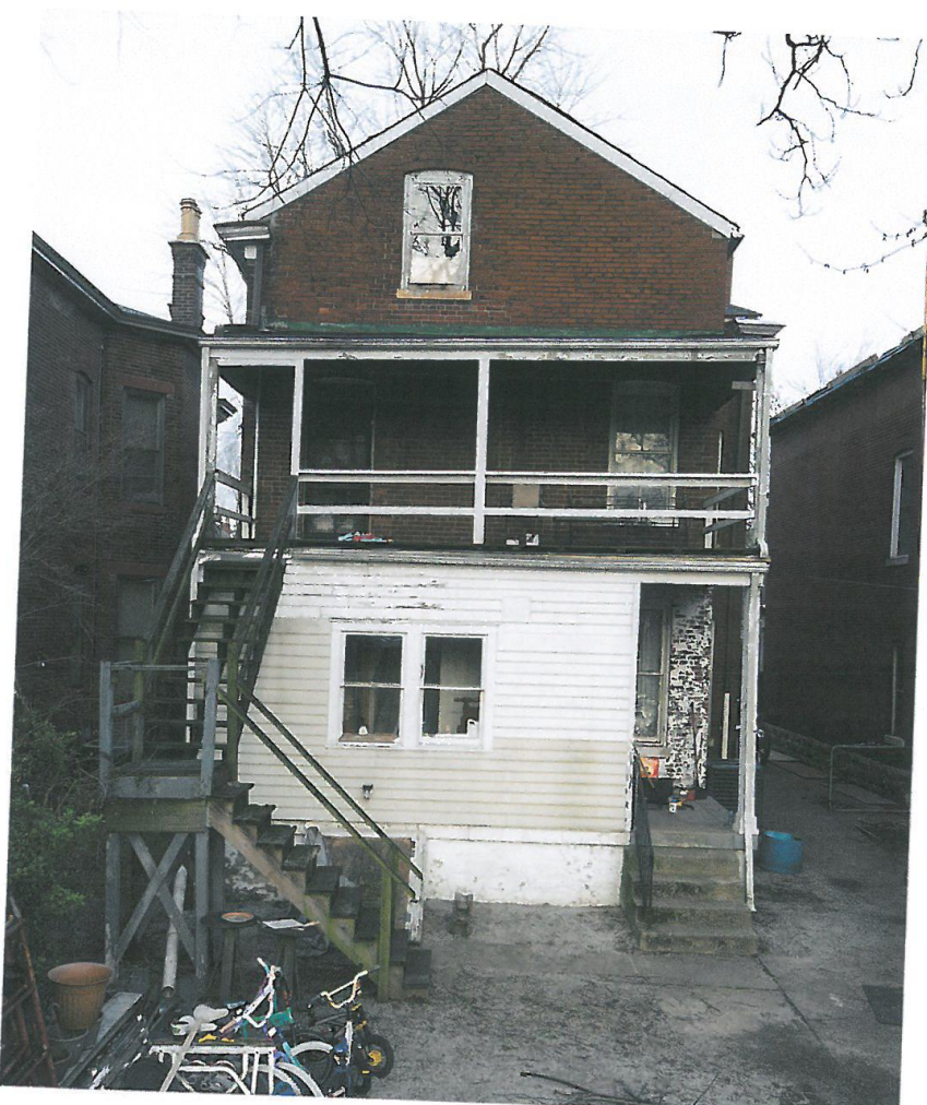
1212 S. 6th Street Rear entrance