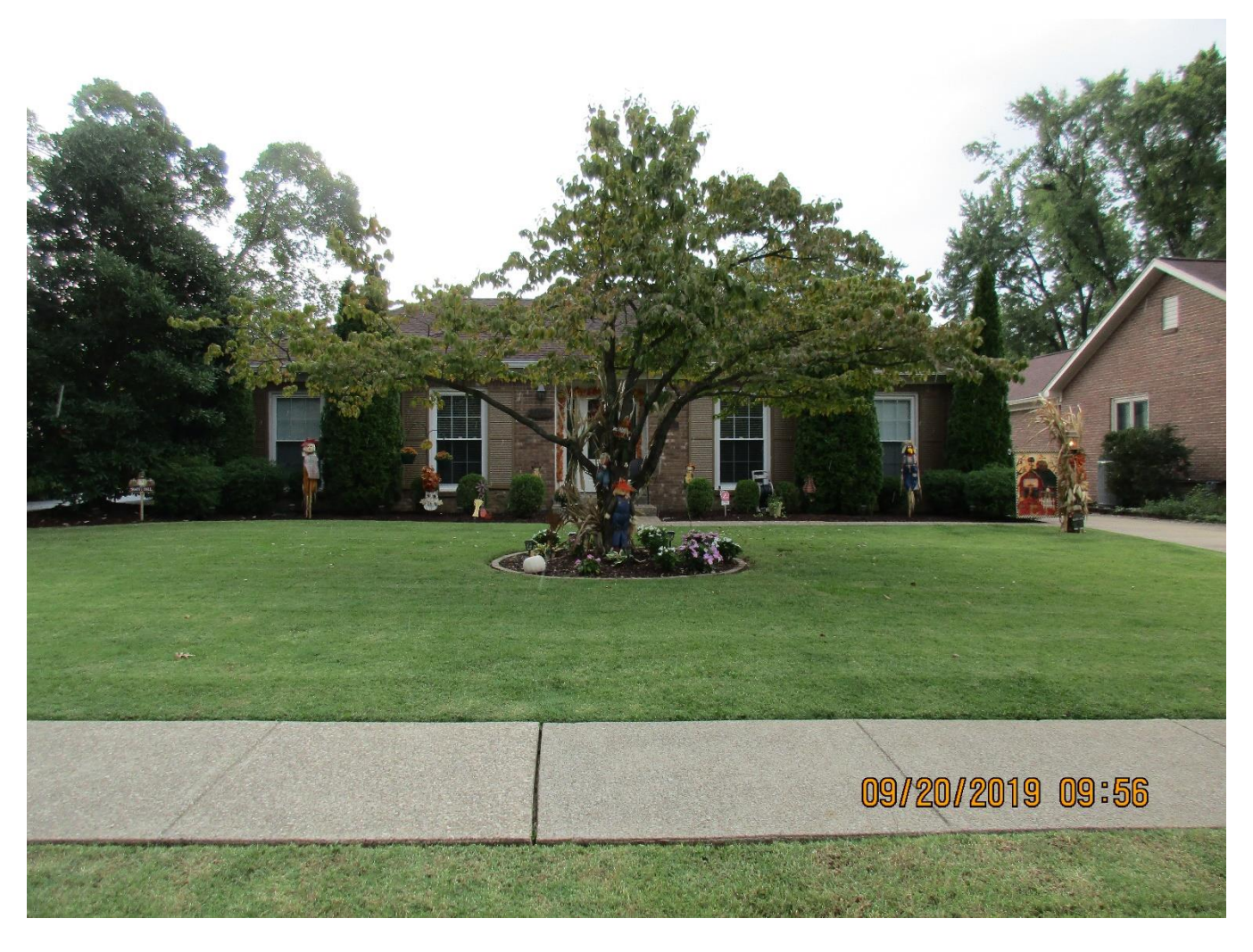
The front of the subject property.