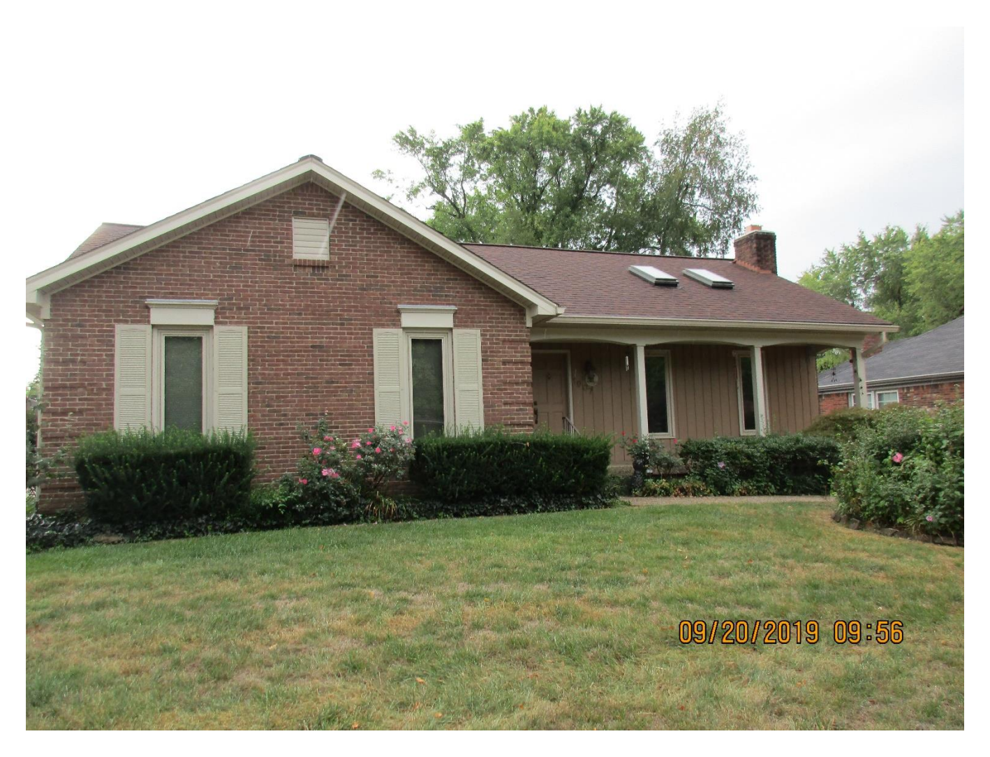
The property to the right.