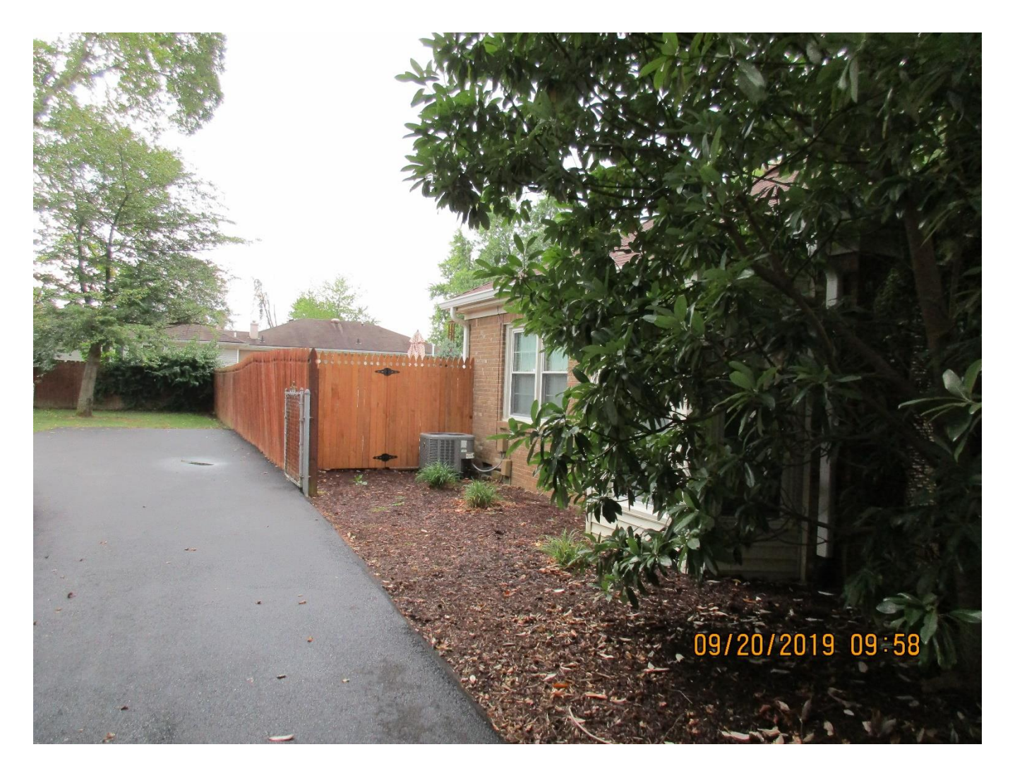
View of the deck area from adjoining property driveway.