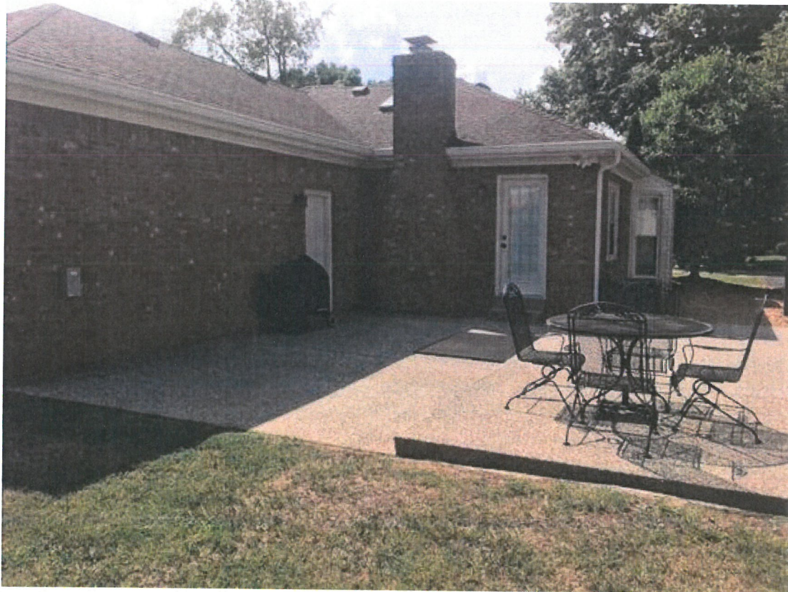
after the deck was built