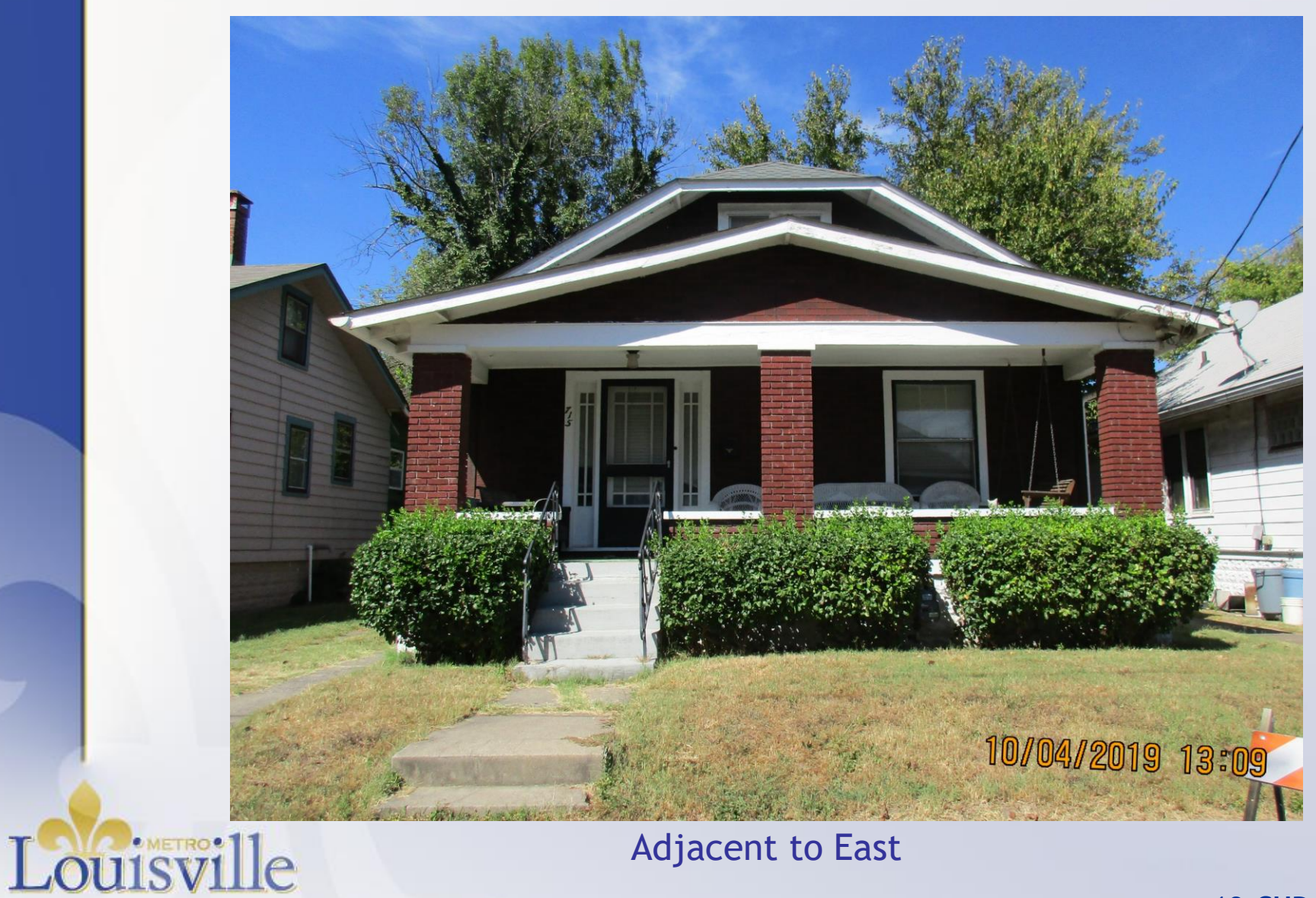
Adjacent to East