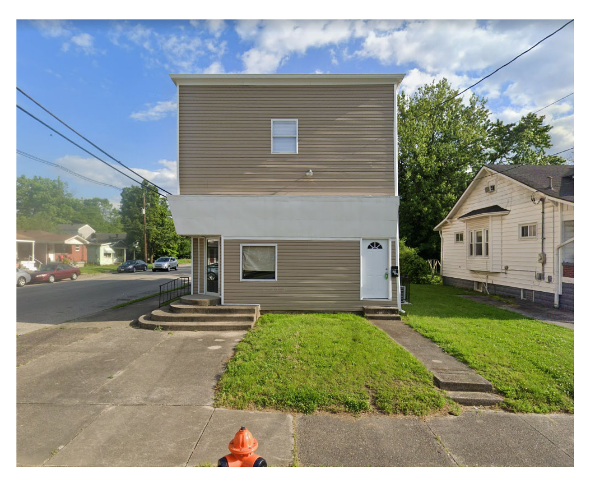
Google streetview photo – Dated May 2019