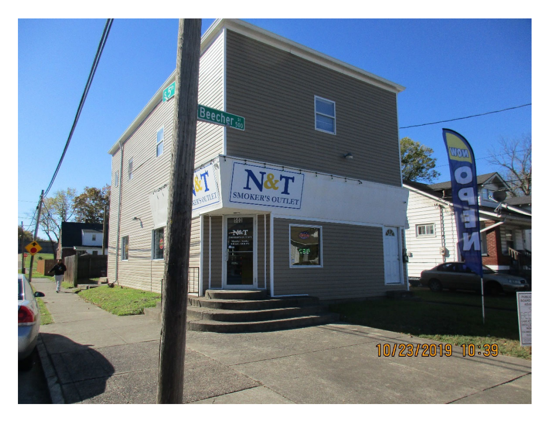
Current photo of property – as of 10/23/19