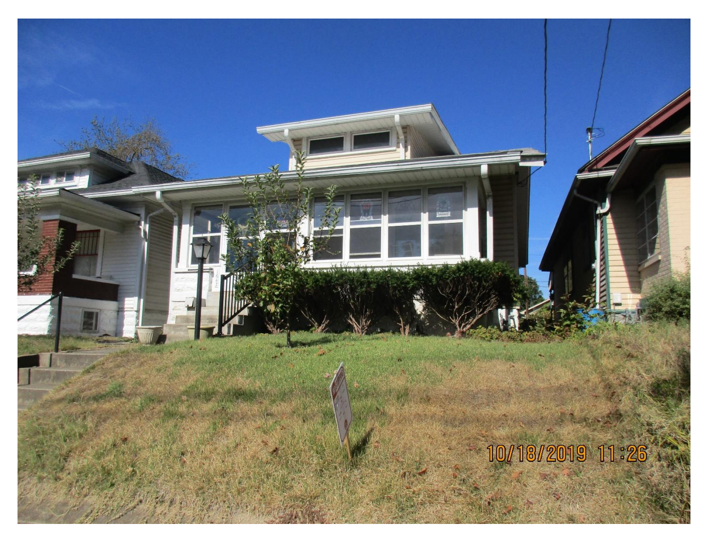
Property to the left.