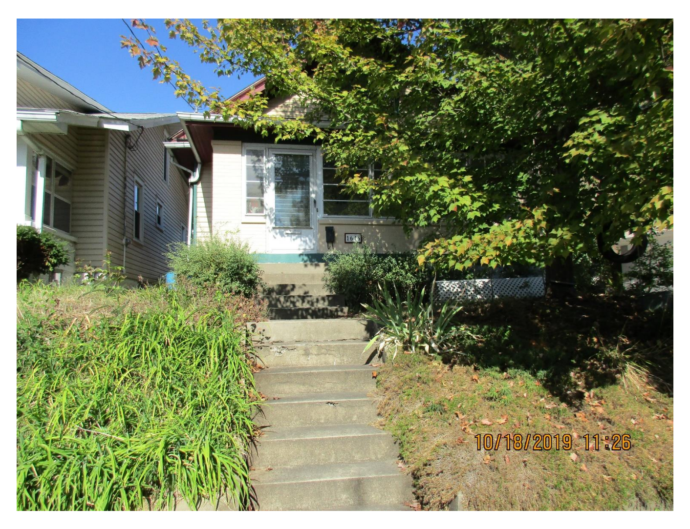
Front of the subject property.