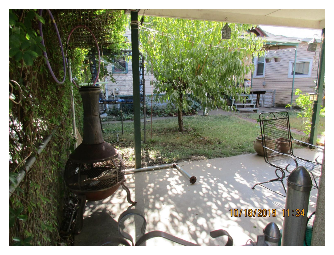
Existing private yard area.