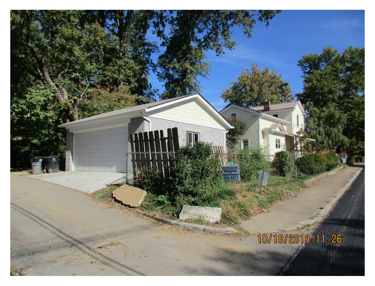
Property to the right.