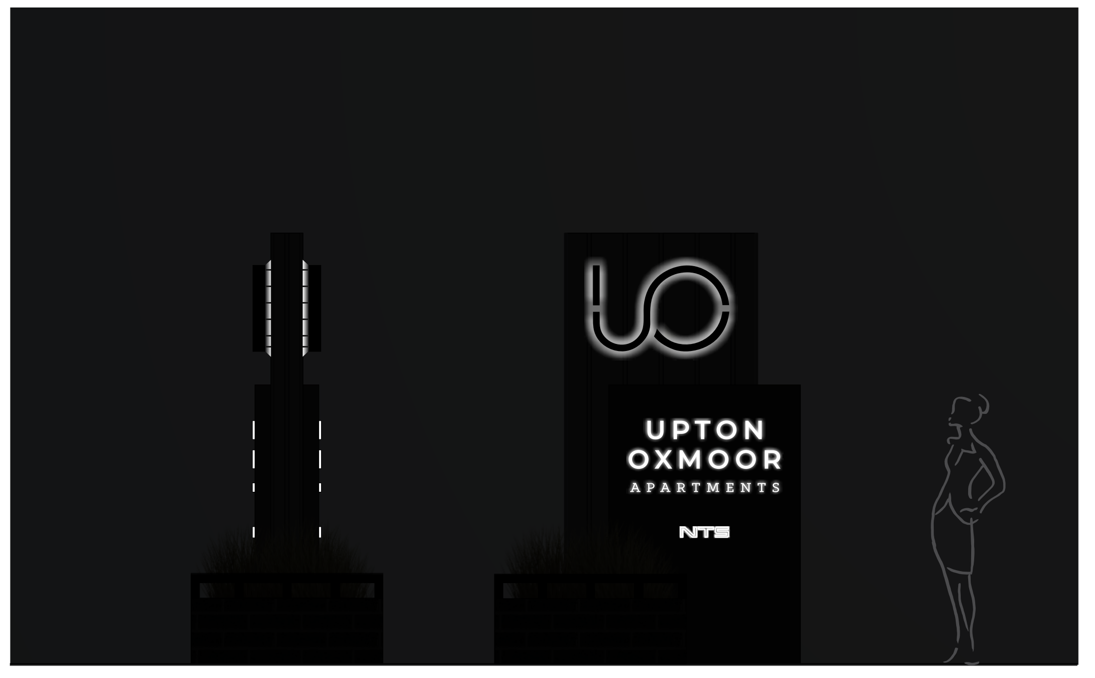
Main ID - 1 Monument Sign - A Qty: 01 Illuminated Night View